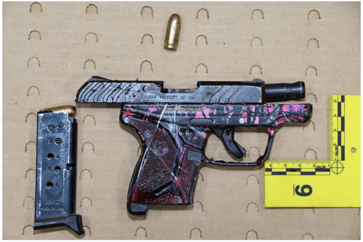
BCI CSU photo CAH_0592; Item #9, weapon possessed by Mitchell.

Various items of potential evidence were submitted to the BCI Laboratory for analysis. The actual reports should be consulted as the following synopsis does not include many of the details from the full reports.