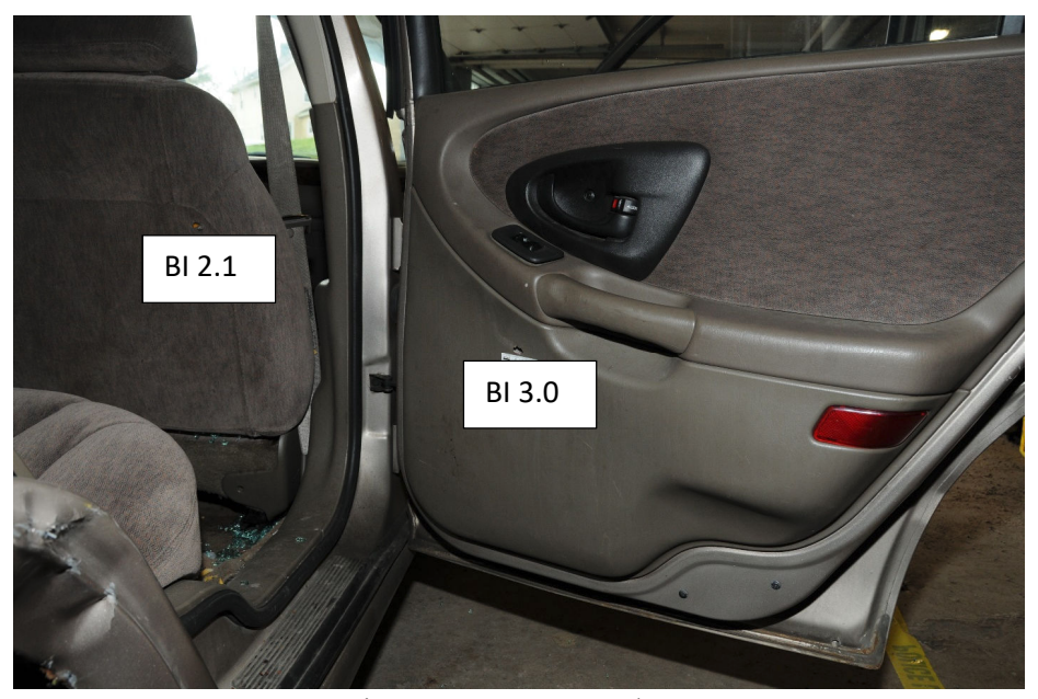
Figure 10, BI 2.1 and 3.0