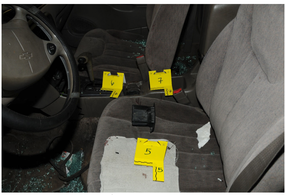
Figure 6, Items 5-7