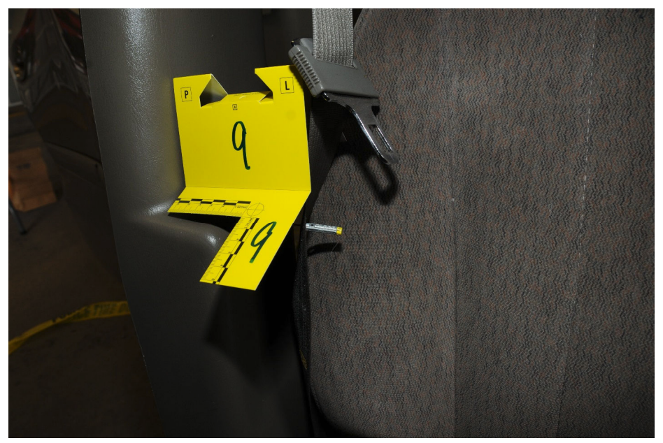
Figure 8, Item 9

The interior of the vehicle was examined for suspected ballistic impacts and several suspected ballistic impacts were observed (Table 2, Suspected Ballistic Impacts). The suspected ballistic impacts were photographed as they were found and examined for suspected ballistic evidence (Figures 9-11, BI 1.0-4.0). Projectiles were recovered from BI 1.0 and BI 3.0 (Items 10 and 11).