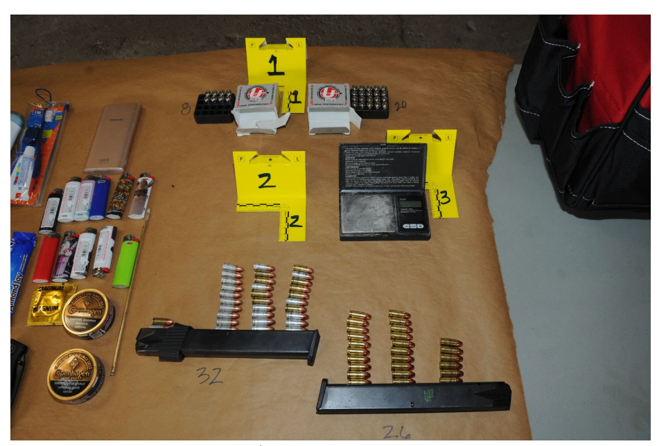
Figure 4, Items 1-3