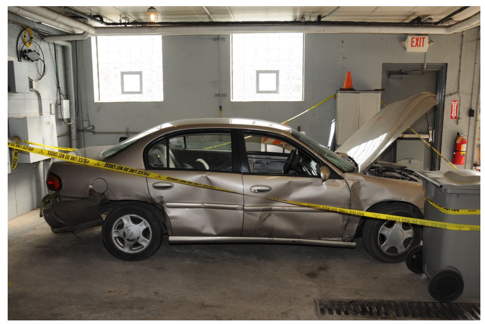
Figure 3, Overall photograph

The interior of the vehicle was photographed as it was found and examined for items of suspected evidence (Table 1, Items of Suspected Evidence). The items of suspected evidence were photographed as they were found and collected (Figures 4-8, Items 1-9).