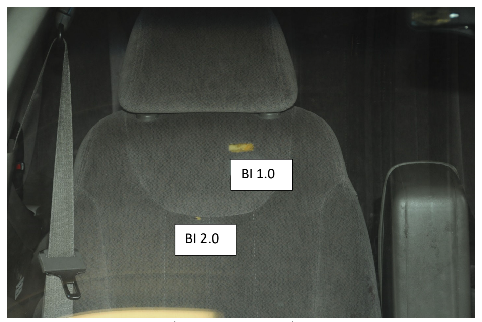
Figure 9, BI 1.0 and 2.0