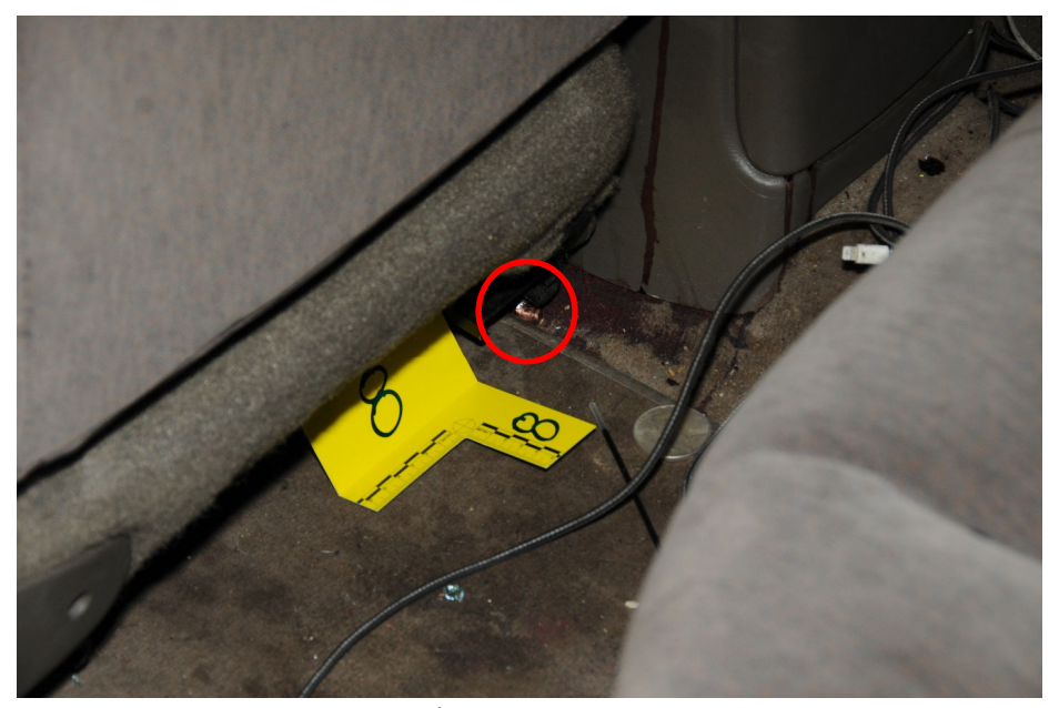
Figure 7, Item 8