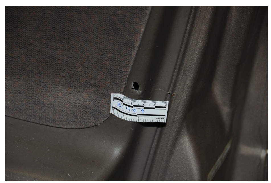
Figure 11, BI 4.0

All items of evidence were transported to the Ohio BCI Richfield Office (4055 Highlander Parkway, Richfield, Ohio 44286). An Inventory / Receipt Attachment form was filled out and signed by SA Boerner. A copy of the form was uploaded into Matrix.