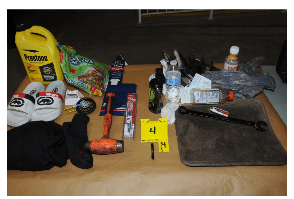
Figure 5, Item 4