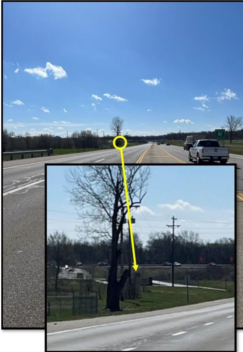
(Hicks point of view)

Officer-Involved Critical Incident - 14000 OH-104 Chillicothe, OH 45601 (L)