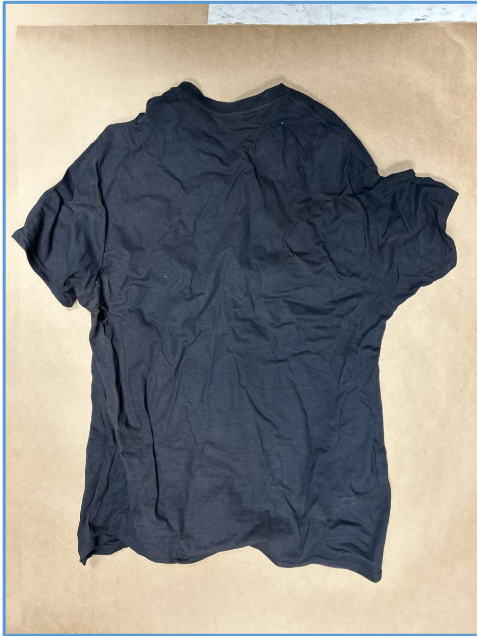
T-shirt back overall

Officer Involved Critical Incident - 2215 East Avenue, Akron, Ohio 44314