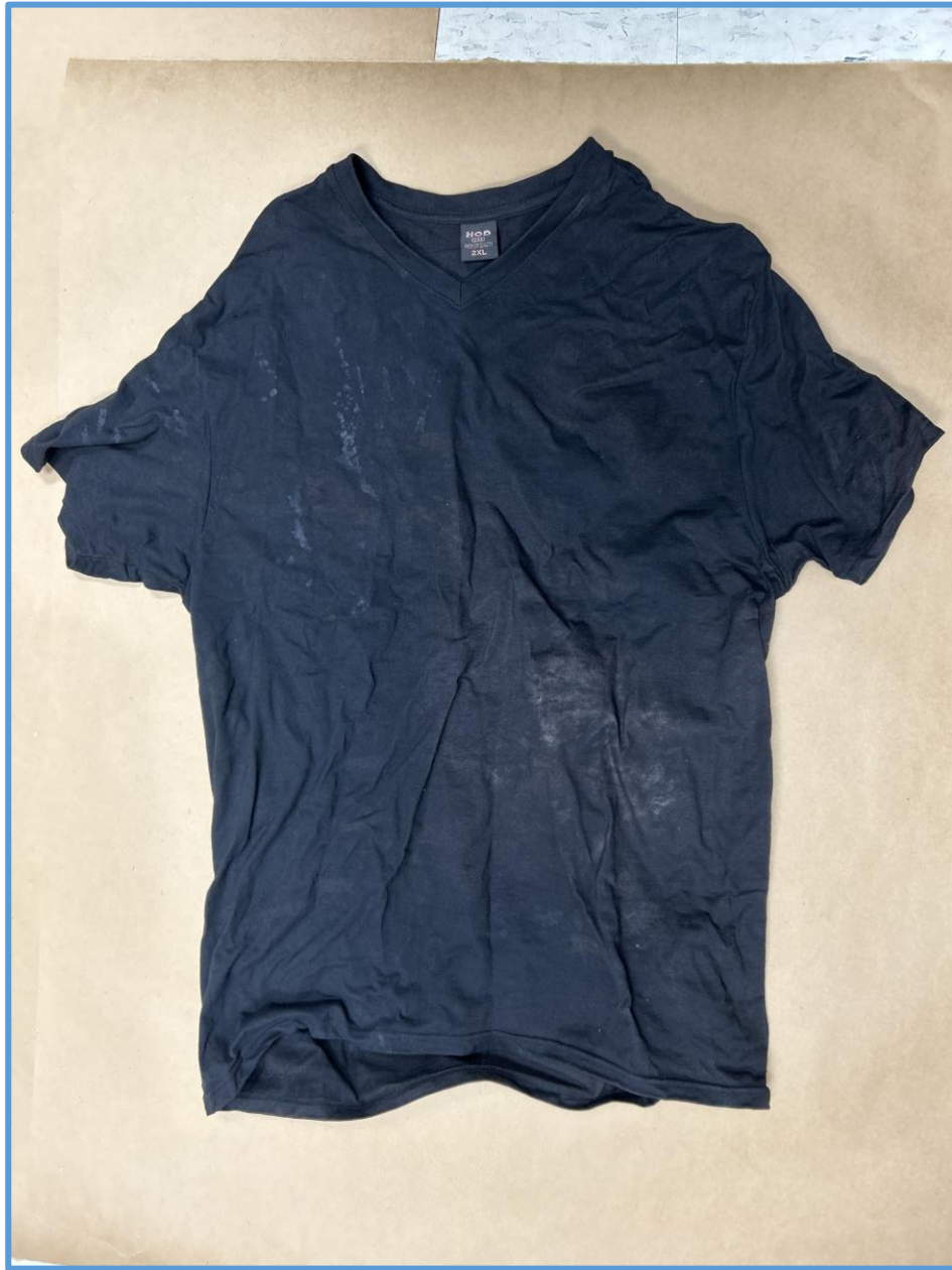
T-shirt front overall

Officer Involved Critical Incident - 2215 East Avenue, Akron, Ohio 44314