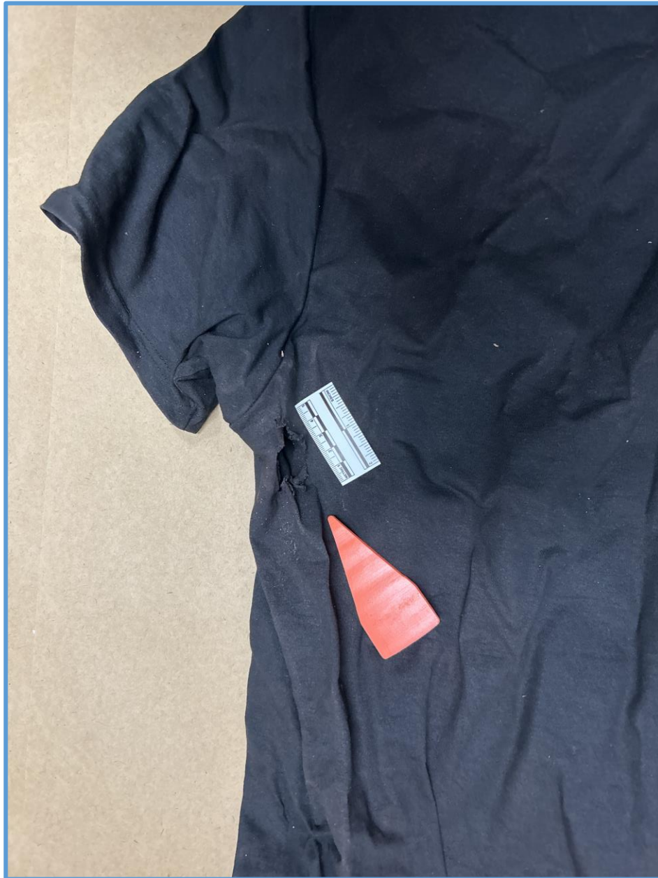
T-shirt defect 2

Officer Involved Critical Incident - 2215 East Avenue, Akron, Ohio 44314