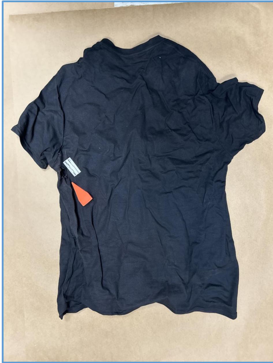
T-shirt defect 1

Officer Involved Critical Incident - 2215 East Avenue, Akron, Ohio 44314