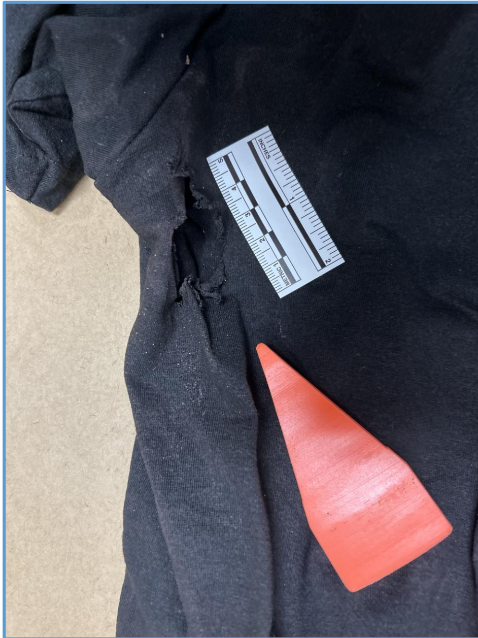
T-shirt defect 3

Officer Involved Critical Incident - 2215 East Avenue, Akron, Ohio 44314