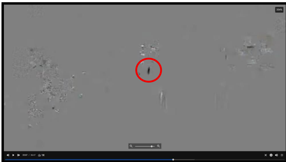
(22:07 into the recording: black item dropping to ground)

This document is the property of the Ohio Bureau of Criminal Investigation and is confidential in nature. Neither the document nor its contents are to be disseminated outside your agency except as provided by law - a statute, an administrative rule, or any rule of procedure.