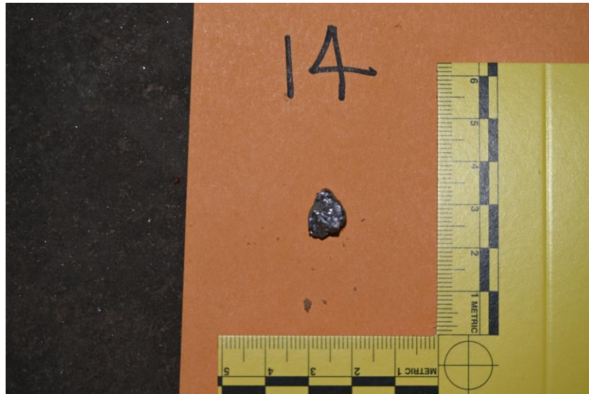
Fig. 5: The recovered projectile fragment.

Officer Involved Critical Incident - 3487 Belmont Avenue, Youngstown, Ohio, 44505