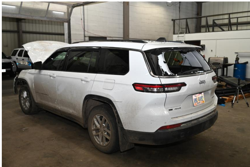
Fig. 1: The involved 2001 Jeep Grand Cherokee.

Agents contacted LTPD Detective Jeff Palmer and were escorted to the secure garage where the vehicle had been stored. The subject vehicle, a white 2001 Jeep Grand Cherokee, VIN 1C4RJKAG1M8160830, bearing Ohio registration KMQ4492, was photographed as it was found.