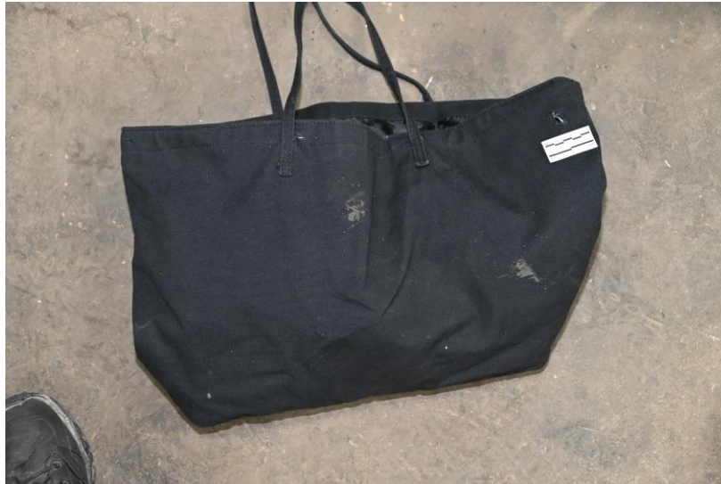
Fig. 7: Black tote bag from the left second row seat. A ballistic impact is marked with a scale.

On the left second row seat, agents located a black tote bag with one ballistic impact on the side of it. A fired projectile (item 16) was found inside the bag. It was photographed and sealed into a paper envelope.