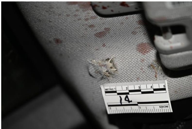
Fig. 4: Ballistic impact in the front row headliner where the projectile fragment (item 14) was recovered. The front right corner of the driver's sun visor is visible at right.

A projectile fragment (item 14) was found to have terminated in the front row headliner near the rear-view mirror. It was recovered from the headliner and photographed with scale, then sealed into a paper envelope.