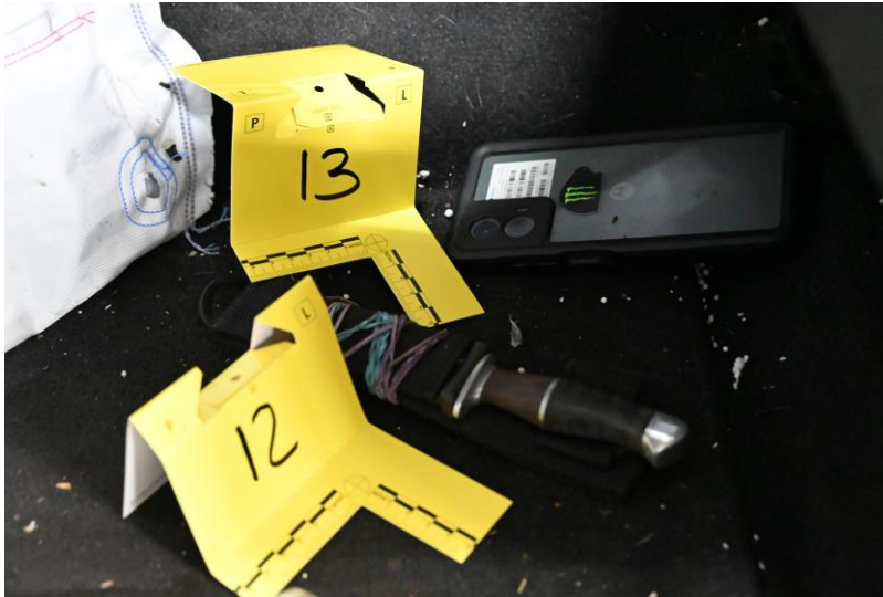
Fig. 3: A fixed blade knife in a nylon sheath and a Motorola cell phone on the driver's floor.

Officer Involved Critical Incident - 3487 Belmont Avenue, Youngstown, Ohio, 44505