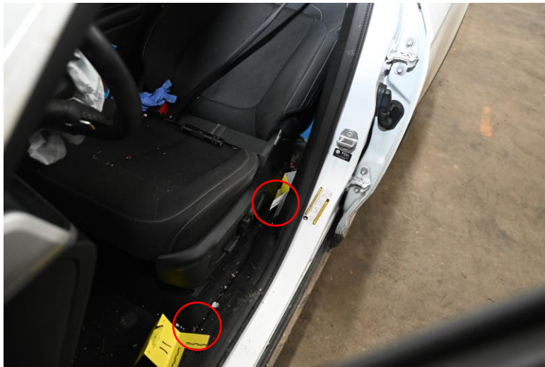
Fig. 2: Fired projectiles (items 10 and 11, circled) on the floor of the driver's area.

Once the vehicle had been documented, agents conducted a search of the passenger cabin. On the floor of the driver's area, agents located two fired projectiles (evidence items 10 and 11), a fixed blade knife inside a nylon sheath (item 12), and a Motorola touchscreen cell phone (item 13). The projectiles and cell phone were sealed into paper envelopes, and the knife was sealed in a cardboard box.