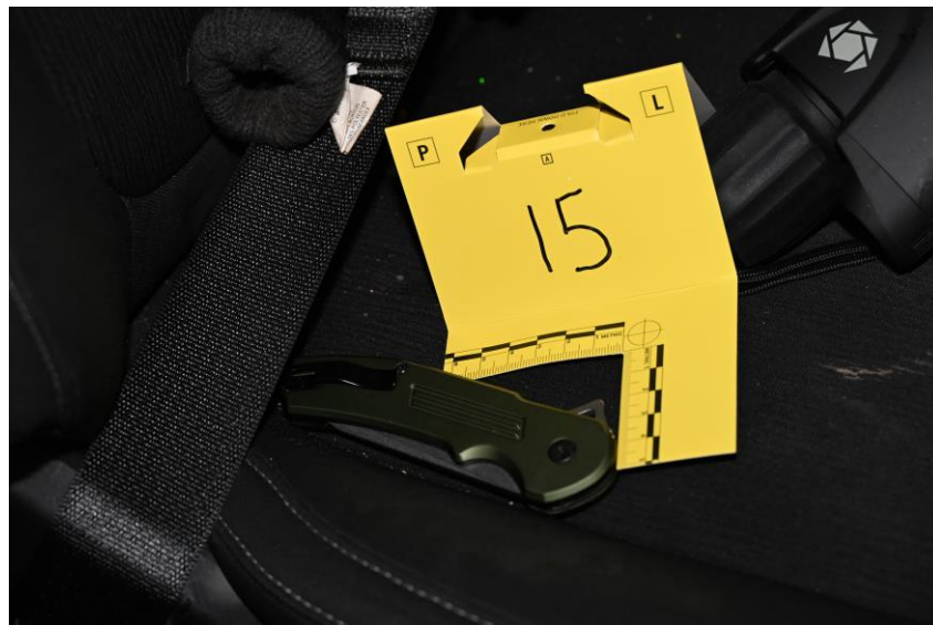
Fig. 6: Green “Buck” folding knife on the front passenger seat.

A green “Buck” brand folding knife was located on the front passenger seat. It was photographed and sealed into a cardboard box.