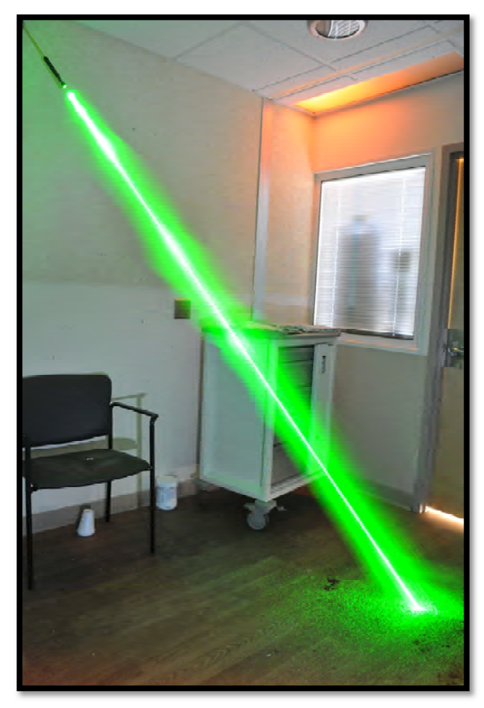
[Laser trajectory toward west wall of patient room #9]

Officer Involved Critical Incident - 500 South Cleveland Ave., Westerville, Ohio 43081 (L)