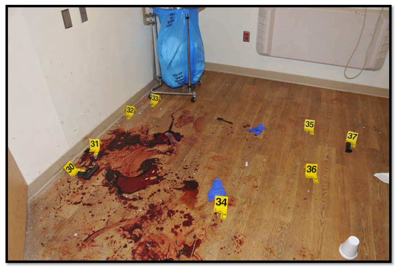
[Evidence located in Patient Room #9]

Officer Involved Critical Incident - 500 South Cleveland Ave., Westerville, Ohio 43081 (L)