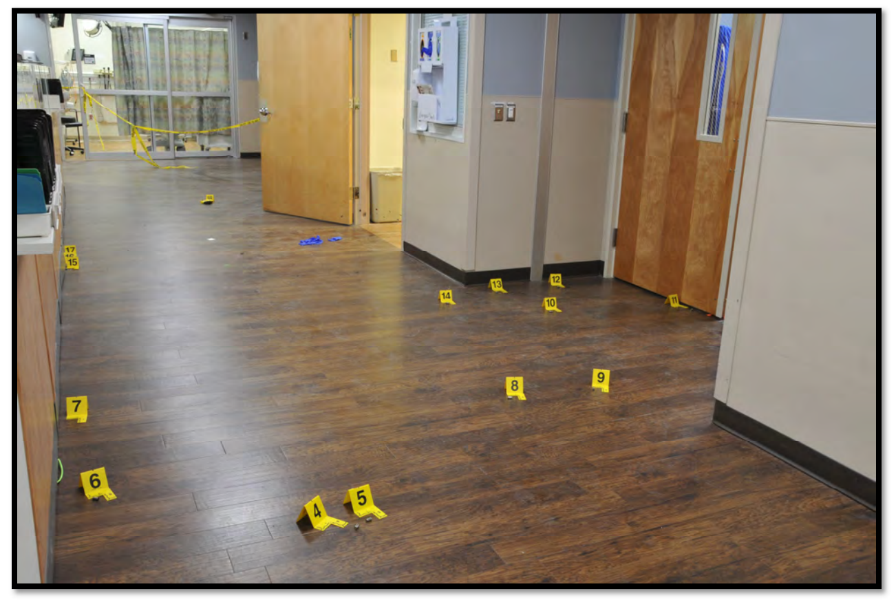
[Casings located in the trauma hallway]

Two tasers were observed on the ground in the trauma hallway. A yellow and black taser with '9010B' on the top of the taser was on the ground near the door to patient room #9. The taser had a serial number of, Sector and no cartridge was present in the taser. The taser was collected as item #18. A yellow and black taser with '14' on the top was lying on the ground behind the double doors to the hallway near patient room #9. The taser had a serial number of, Sector The taser had a deployed cartridge still attached, and the wires stretched from the taser, under the hallway door, around the corner and into patient room #9. Agents located a taser barb that was stuck in the floor inside patient room #9. The taser and the taser wire barb were all collected as item #26.