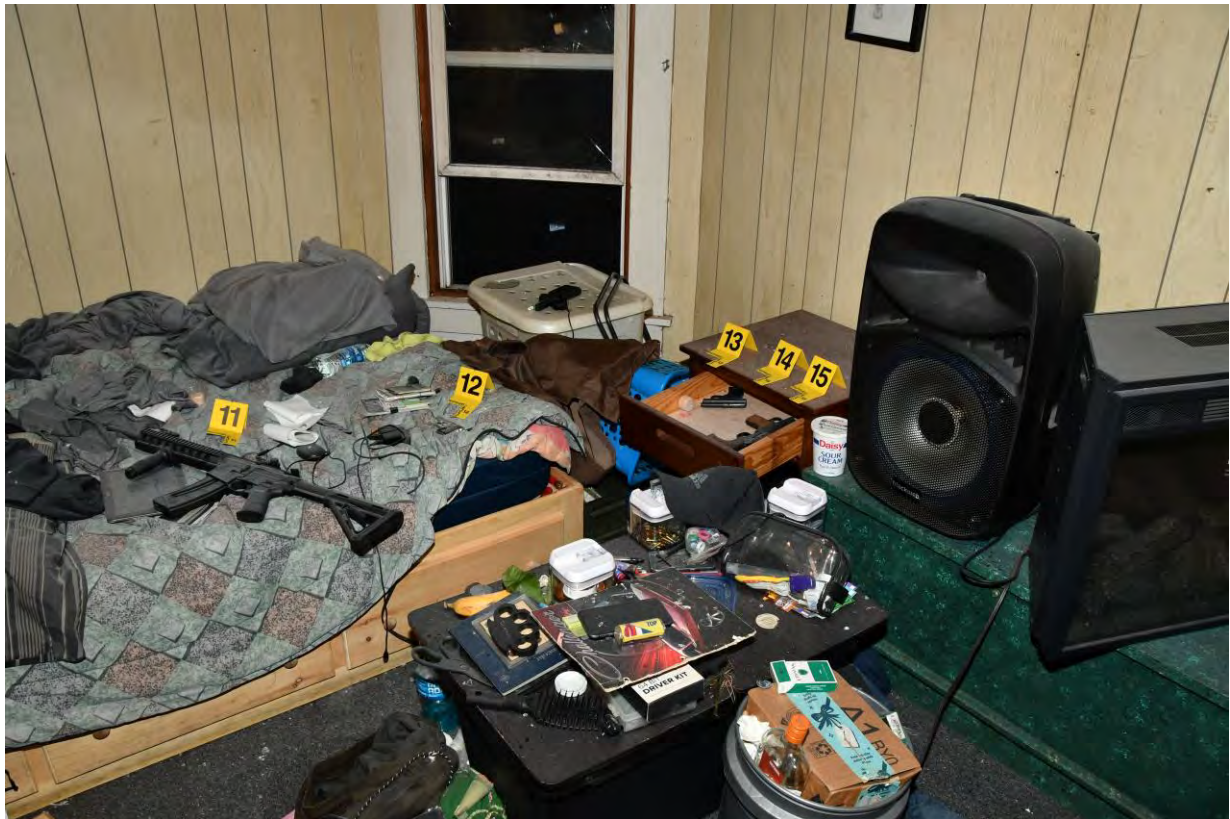
Image 3. Front bedroom firearms with placards near bed