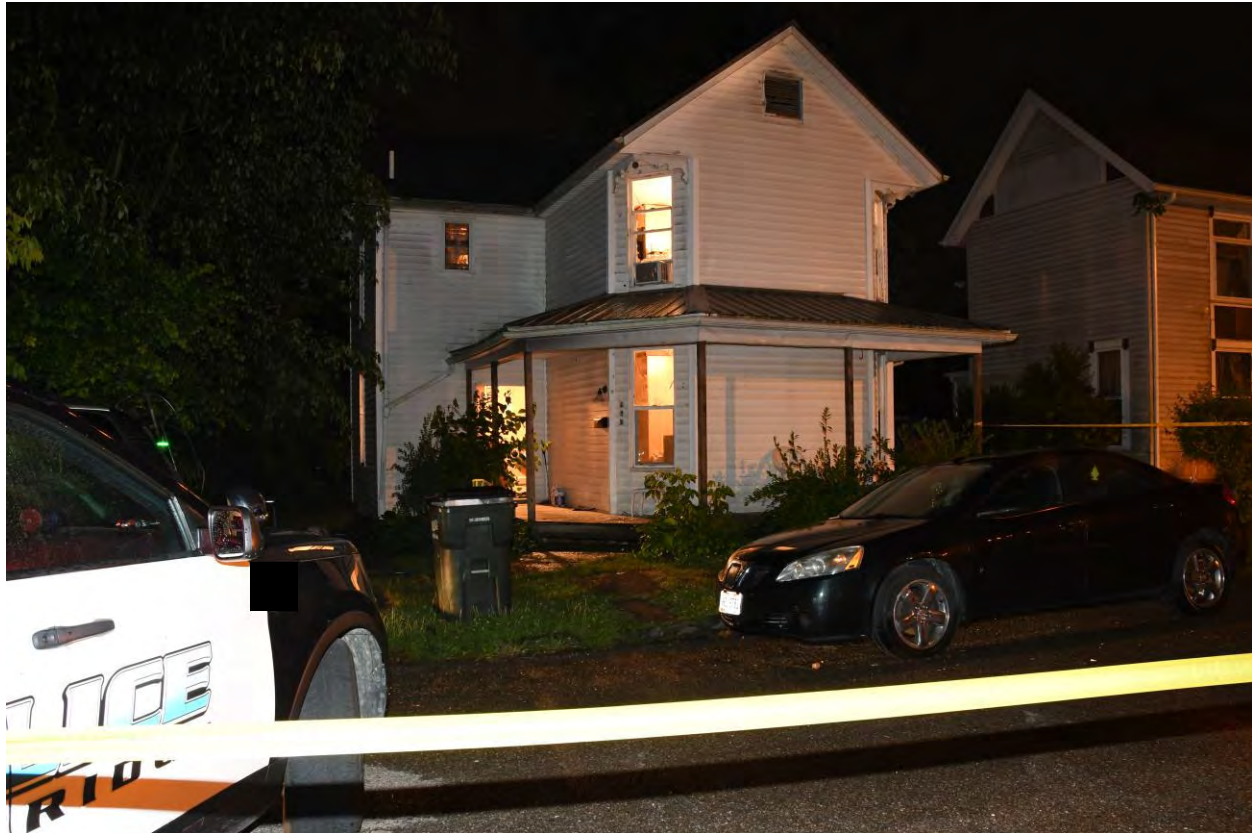
Image 1. 428 Foster Ave. Cambridge, Ohio