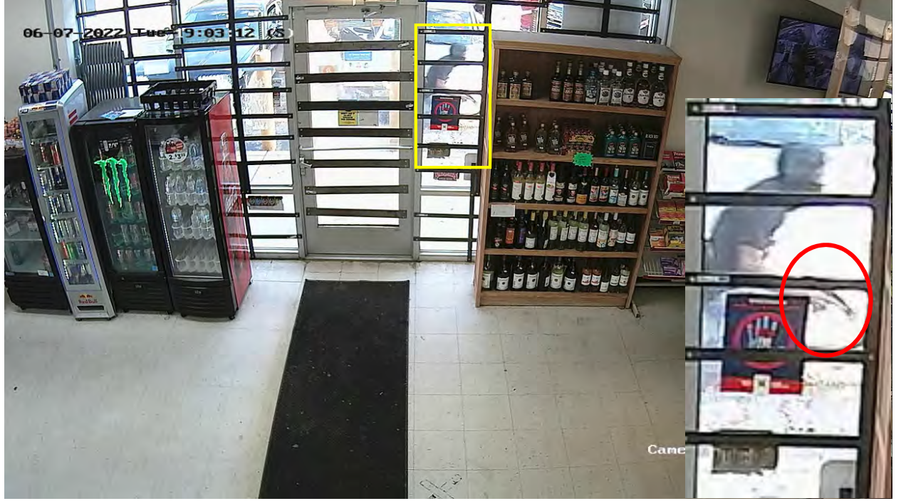
F125_ Striblin with object in right hand_Cam 5; includes cropped area. Red and yellow markings added by SA Collins