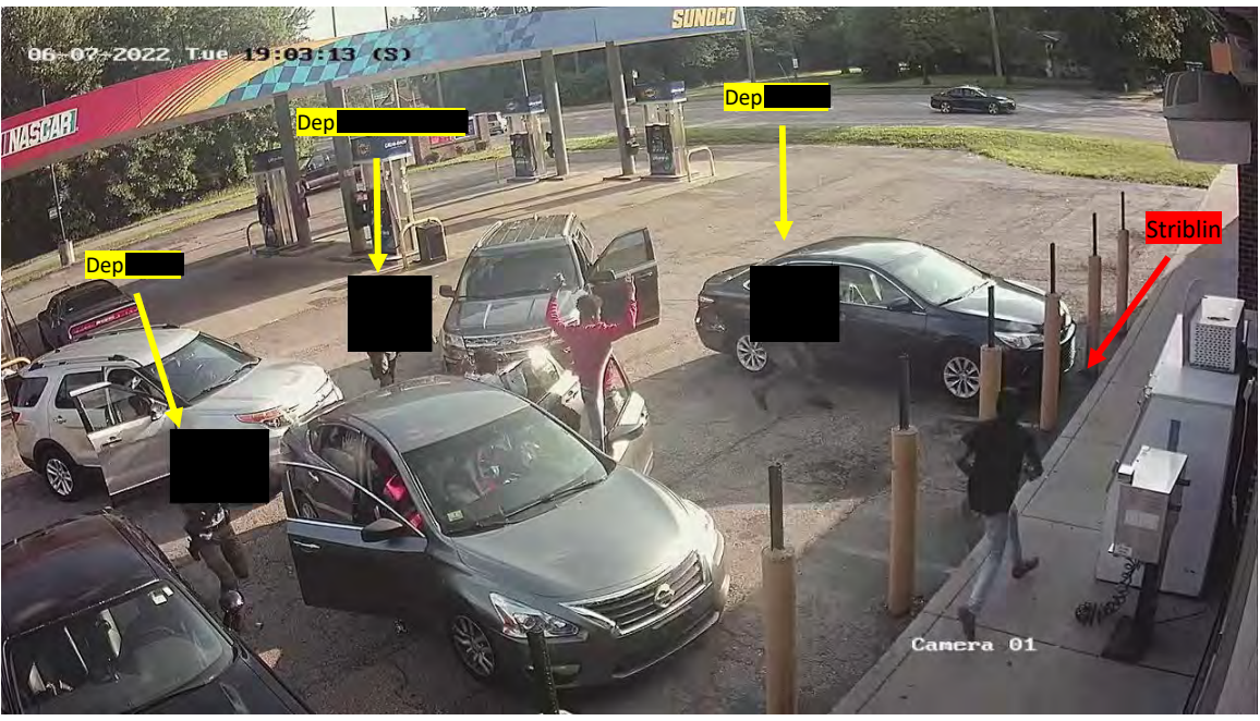
F4790_Deputies appear to fire_Cam1. Red and yellow markings added by SA Collins

As multiple shots appeared to be fired, Striblin was seen falling to the ground shortly thereafter. Deputies were viewed securing Striblin and other individuals associated with the vehicle. Deputies were also viewed rendering aid to Striblin.