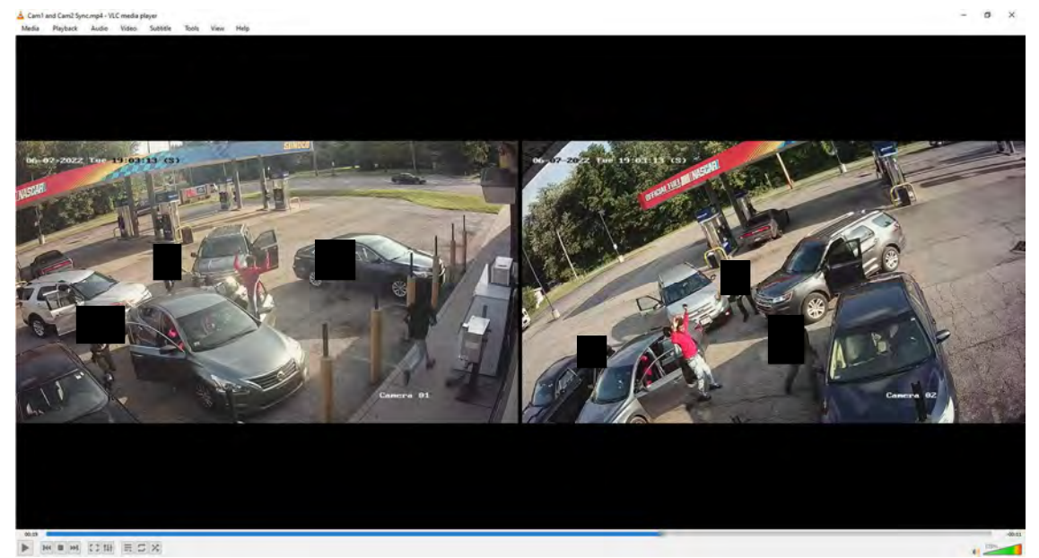
Figure 3: Screenshot of Camera 1 and Camera 2 synced.

As mentioned above, SA Collins created a sub-clip of Camera 1 and synced it with Camera 2. This was done so the viewer may see the respective cameras side-by-side. Figure 3 below depicts the approximate moments deputies were believed to be firing their weapons.