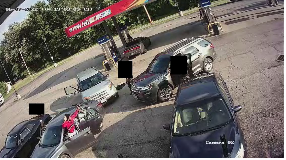
Figure 2: F412_Franks appeared to have a black object in his left hand_Cam2

As mentioned above, SA Collins created a sub-clip of Camera 1 and synced it with Camera 2. This was done so the viewer may see the respective cameras side-by-side. Figure 3 below depicts the approximate moments deputies were believed to be firing their weapons.