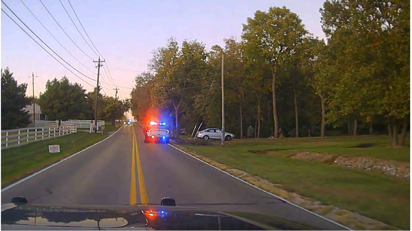
Singleton Cruiser Camera 1