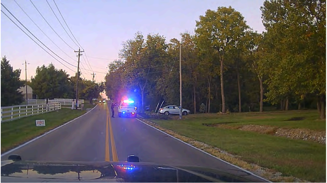
Singleton Cruiser Camera 2