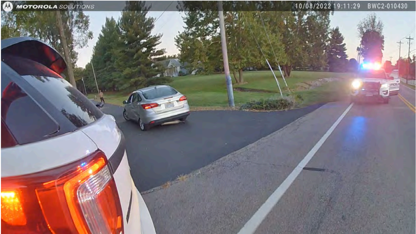
Reed BWC 1