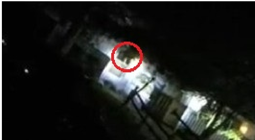
Officer Cutshall Helmet Video Screenshot - 34:14 minute mark - gun observed