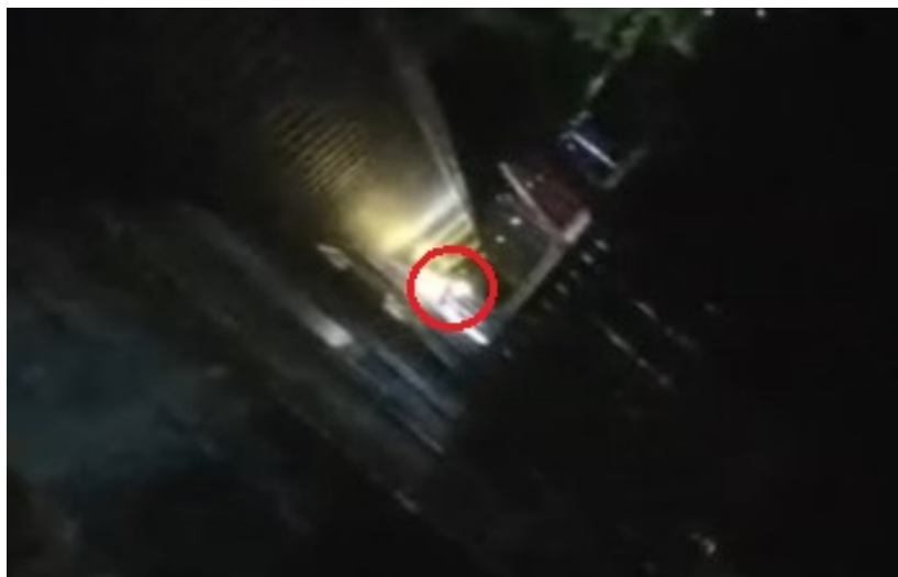
Officer Dillelo Helmet Video Screenshot – 6:33 minute mark – subject's arm extended with gun