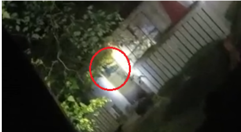
Officer Shope Helmet Video Screenshot – 27:28 minute mark – Subject's arm extended with a gun