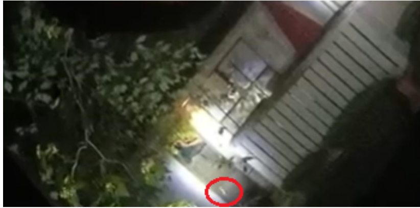
Officer Shope Helmet Video Screenshot – 50:07 minute mark – magazine falling to the ground