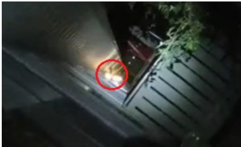
Officer Dillelo Helmet Video Screenshot – 29:03 minute mark – subject raised arm out of the door