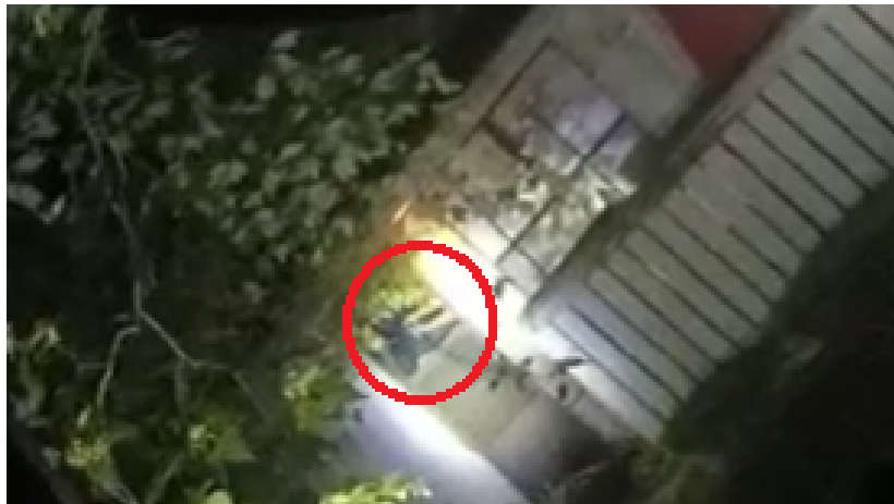
Officer Shope Helmet Video Screenshot – 50:05 minute mark – subject with two arms extended (believed to be ejecting the magazine)