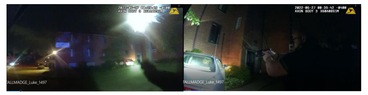
Figure 3 Figure 4

The above images are from Officer Luke's body-worn camera footage. Based upon Officer Luke's body-worn camera footage, Officer Luke is observed arriving on scene just after the shooting (Figure 1). Officer Luke and other officers are observed approaching the individual (Figure 2). After a few moments, Officer Luke is observed running across the street and approaching the individual's vehicle (Figure 3). Officer Luke and other officers are observed clearing the individual's vehicle (Figure 4).