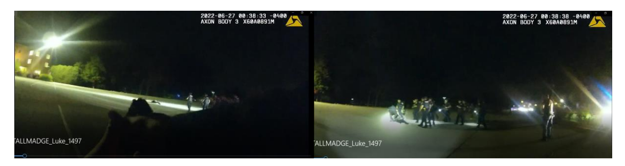
Figure 1 Figure 2