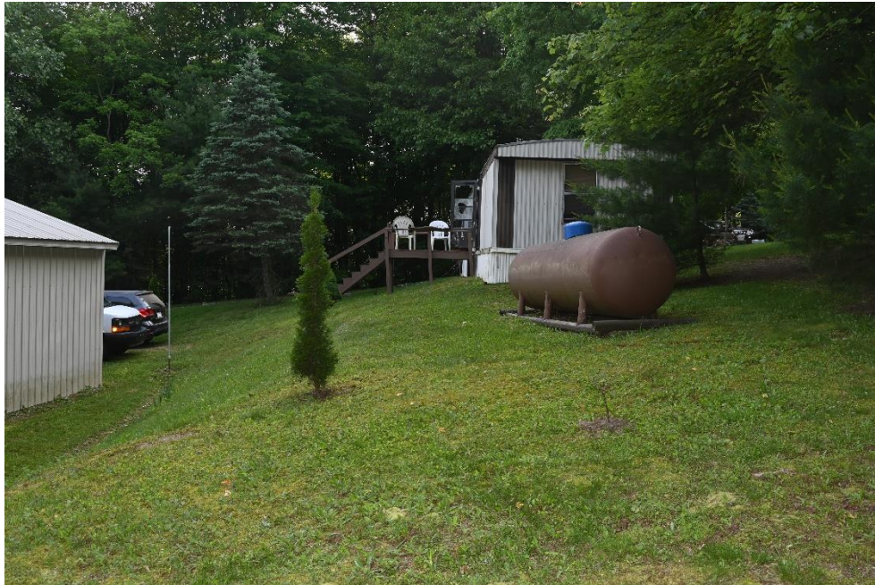
Figure 2: Exterior Overall Photograph

Officer Involved Critical Incident - 10180 Busenburg Rd., Howard, OH 43028, Knox County