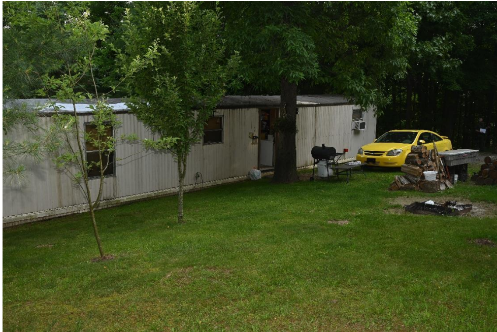
Figure 4: Exterior Overall Photograph

Officer Involved Critical Incident - 10180 Busenburg Rd., Howard, OH 43028, Knox County