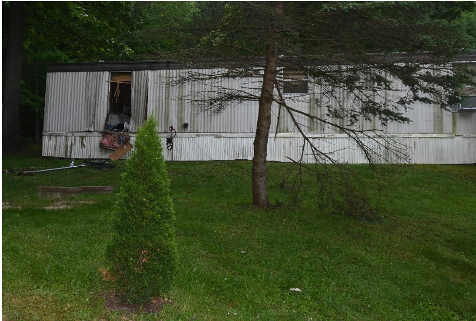
Figure 6: Exterior Overall Photograph

Officer Involved Critical Incident - 10180 Busenburg Rd., Howard, OH 43028, Knox County