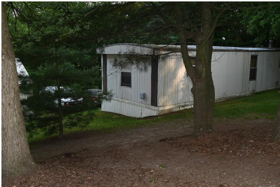
Figure 3: Exterior Overall Photograph

This document is the property of the Ohio Bureau of Criminal Investigation and is confidential in nature. Neither the document nor its contents are to be disseminated outside your agency except as provided by law - a statute, an administrative rule, or any rule of procedure.