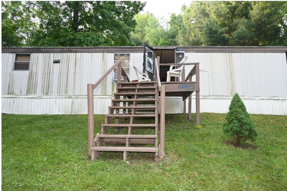
Figure 1: Exterior Overall Photograph

The primary scene consisted of a manufactured house. The residence can be described as a white single-wide manufactured home with a wooden porch off the front door. The front door had a storm door with a glass pane. The glass pane was broken. The front door entered into an open concept living room and kitchen. A bedroom with two beds was located to the south of the living room. A laundry room and an exterior rear door were located to the north of the kitchen. The bathroom was located to the west of the laundry room. On the north side of the home, a bedroom was located with two deceased individuals. A male, later identified as Lloyd Ray (July 20, 1961, W/M), was located with a rifle in his hands. A female, later identified as Laretta Beltz (April 1, 1957, W/F), was located on the floor near the end of the bed. The bedroom had a large hole in the exterior wall from SWAT's efforts. A purse was located to the north of the house in the woods.