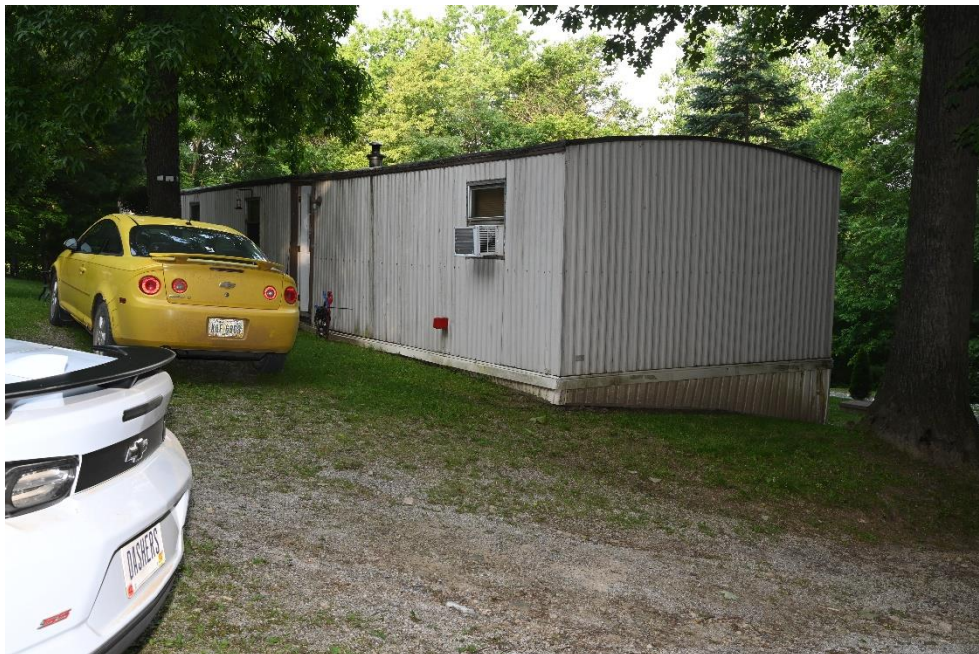
Figure 5: Exterior Overall Photograph

This document is the property of the Ohio Bureau of Criminal Investigation and is confidential in nature. Neither the document nor its contents are to be disseminated outside your agency except as provided by law - a statute, an administrative rule, or any rule of procedure.