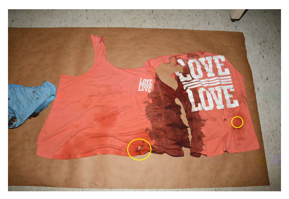
Figure 2, Pink Tank Top w/ Defects

The third package contained a gray sweatshirt. The sweatshirt was cut, presumably by medical personnel. The sweatshirt was photographed (Figures 3-5 Gray Sweatshirt w/ Defects). Several defects were located on the left front upper arm area. Several defects were located on the center left side front of the sweatshirt. A defect was observed in the lower right area of the pocket. Several defects were located on the back of the right arm. Suspected blood was located on the left side of sweatshirt. Locations of the defects are described as the item is lying flat.