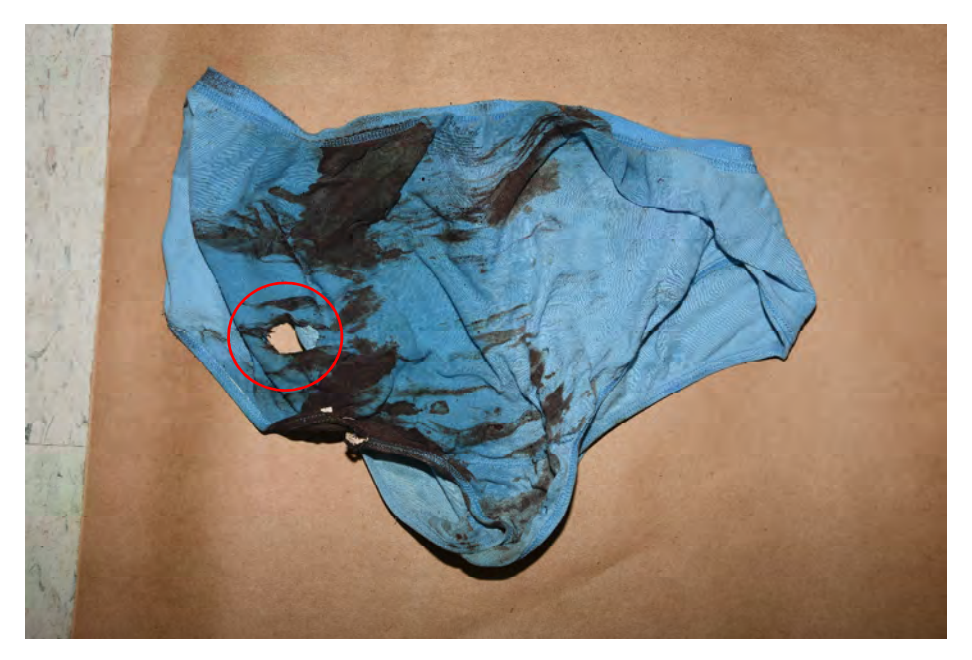
Figure 1, Blue Underwear w/ Defects

The first package contained a pair of blue women's underwear. The item was photographed (Figure 1, Blue Underwear w/ Defects). The underwear had a defect in the rear left side. Suspected blood was located on the back of the underwear in the general area of the defect. Locations of the defects are described as the item is lying flat.