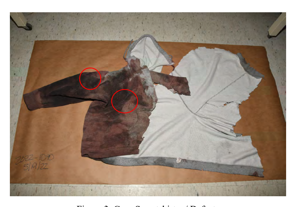
Figure 3, Gray Sweatshirt w/ Defects