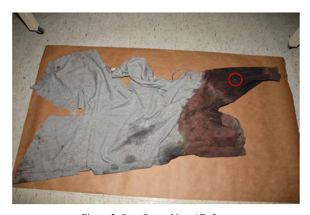
Figure 5, Gray Sweatshirt w/ Defects

All items were repackaged separately with their original packaging and placed into temporary evidence locker #1.