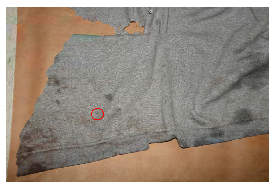
Figure 4, Gray Sweatshirt w/ Defects

This document is the property of the Ohio Bureau of Criminal Investigation and is confidential in nature. Neither the document nor its contents are to be disseminated outside your agency except as provided by law - a statute, an administrative rule, or any rule of procedure.