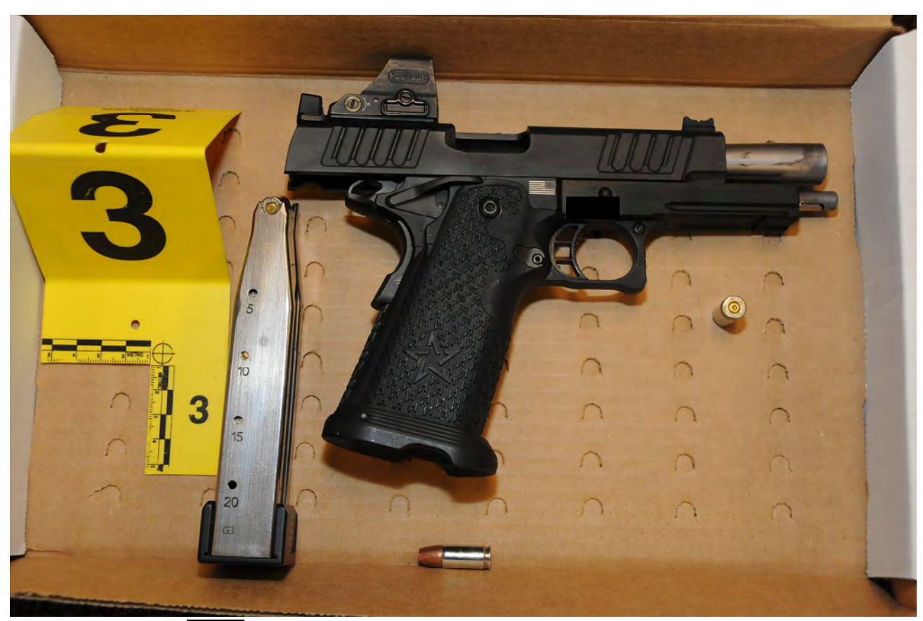
Image 1. firearm: magazine containing 18, 1 loose cartridge, and 1 fired casing

SA Austin released these items to SAS Durst while on scene and cleared the area at approximately 1540 hours.