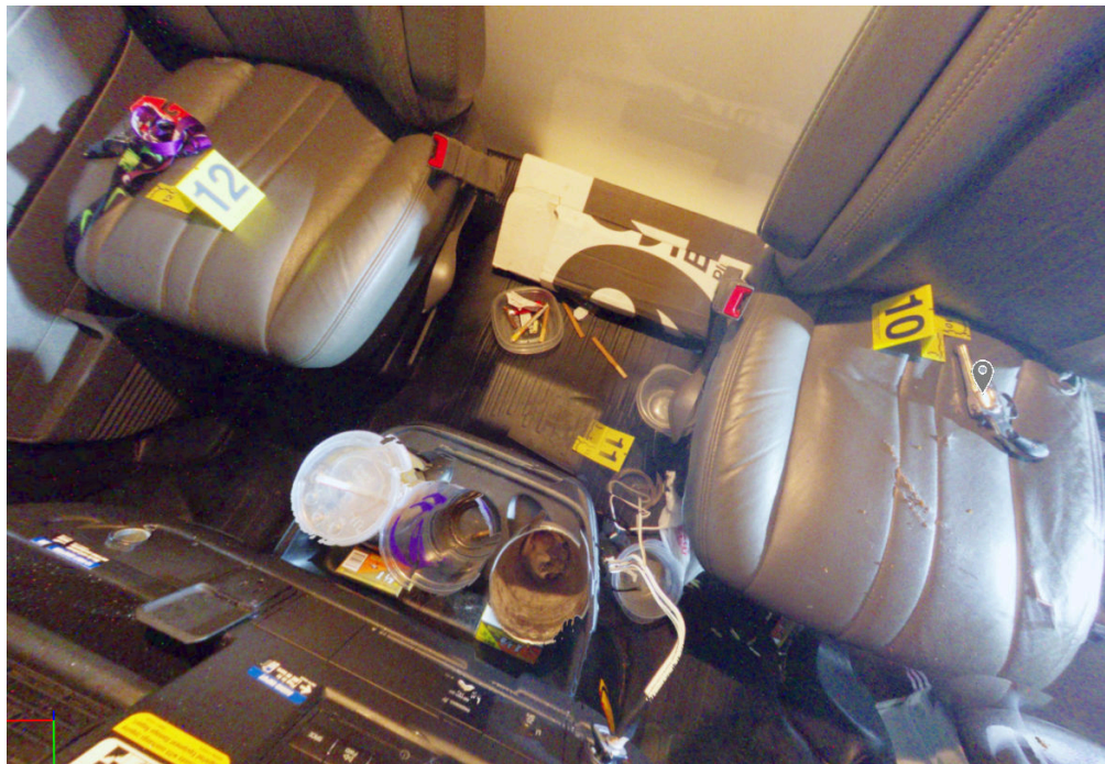
Figure 2: Inside of U-Haul (scan screenshot)

In the U-Haul, a 5-shot revolver with 5 live rounds in the cylinder was located on the driver's seat. The revolver was collected and labeled Evidence Item #10 . A cellphone was located on the floorboard in the center. The cellphone was collected and labeled Evidence Item #11 . Two lanyard key chains were on a U-Haul Key. The key chains were located on the passenger seat, it was collected and label Evidence Item #12 . The driver's seat and the area around the door had suspected blood.