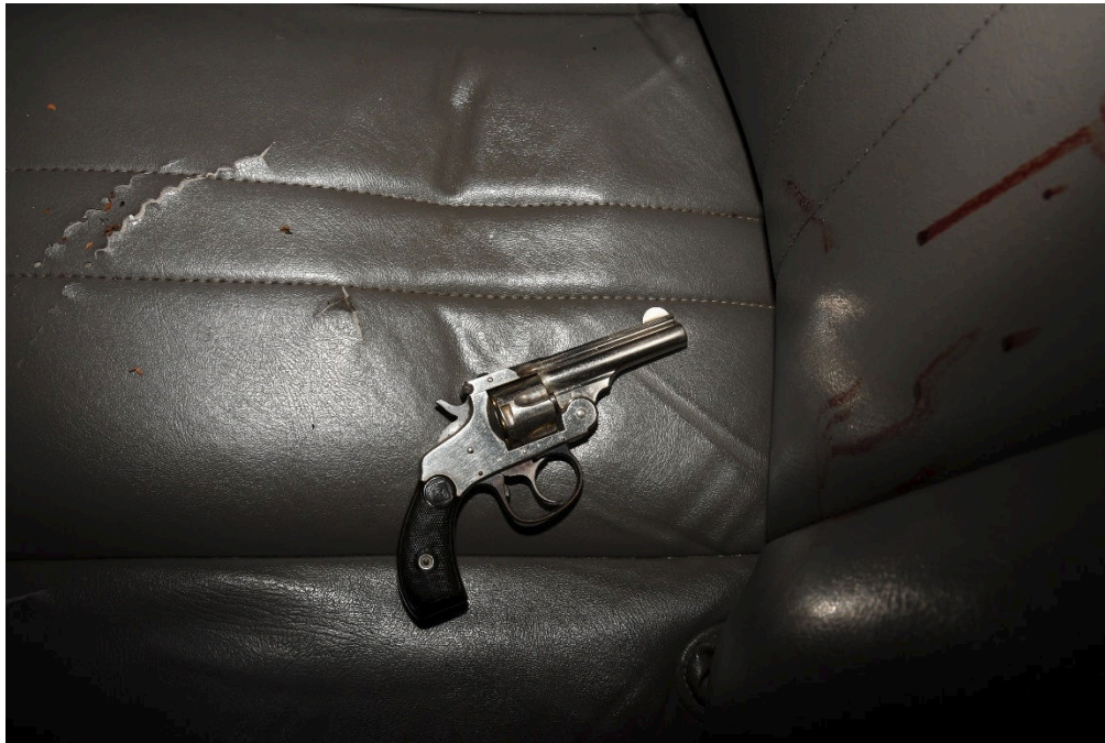
Figure 3: Revolver found in U-Haul

Officer Involved Critical Incident - 2215 East Avenue, Akron, Ohio, 44314