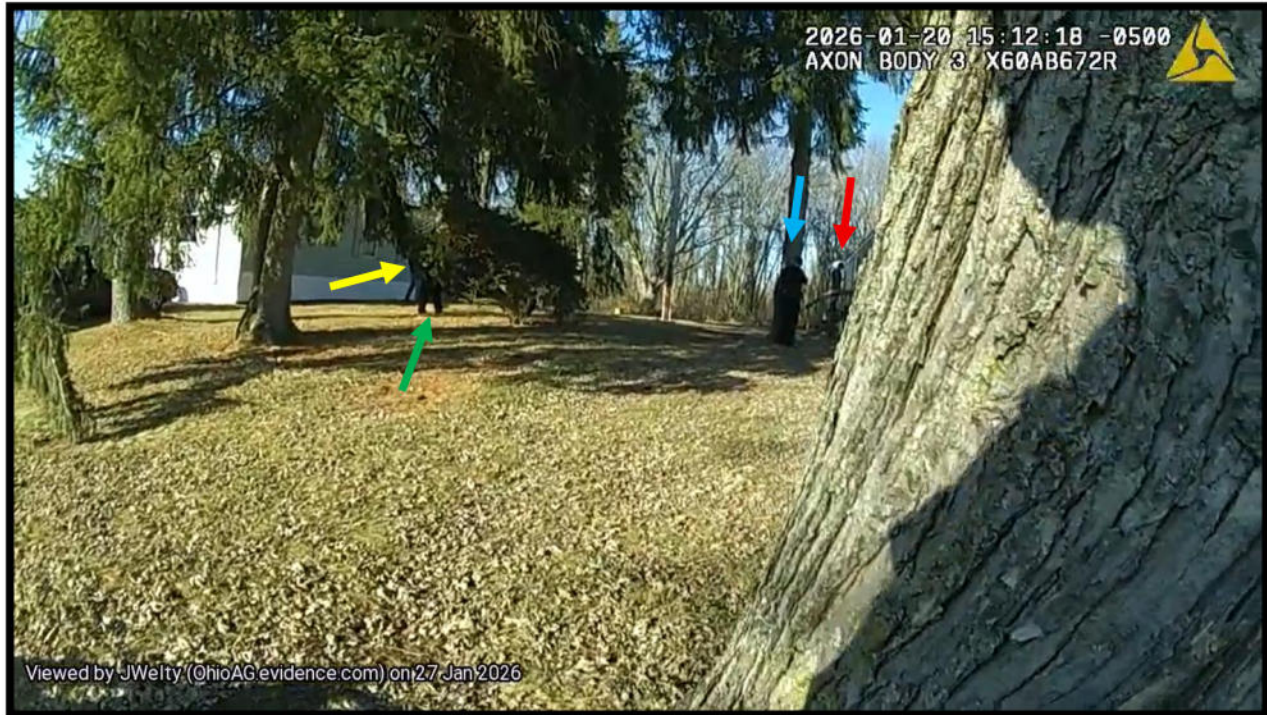
(15:12:18 hours: Locations of officers and Dalton)

2026-0240 Officer Involved Critical Incident - 4800 Duvall Rd., Lot 303, Ashville, OH 43103 (L)