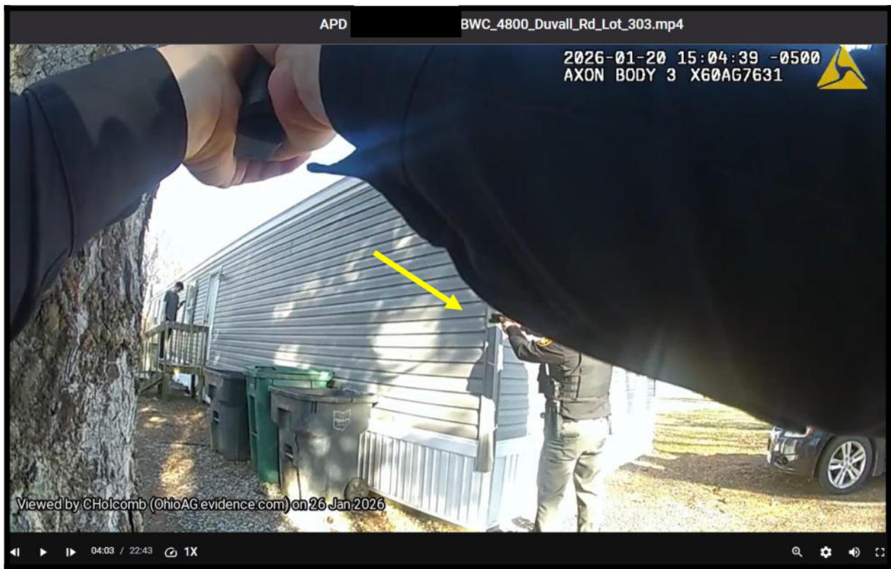
(15:04:39 hours: ██████████ arrives on scene [yellow arrow])

At 15:04:39 hours, ██████████ arrives on scene and takes position at the corner of the residence (see yellow arrow below).