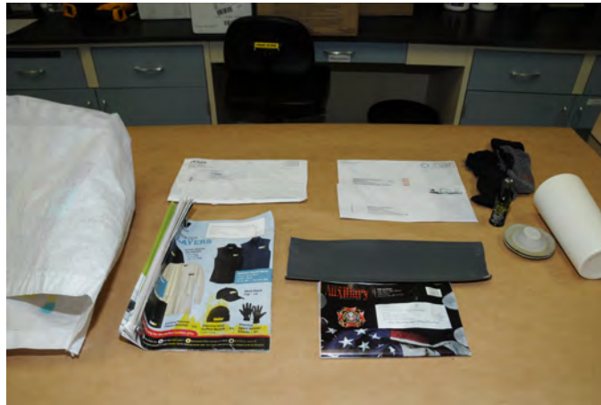
Item 7, Contents of Aldi bag