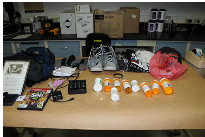
Item 2, Contents of blue backpack

This document is the property of the Ohio Bureau of Criminal Investigation and is confidential in nature. Neither the document nor its contents are to be disseminated outside your agency except as provided by law – a statute, an administrative rule, or any rule of procedure.