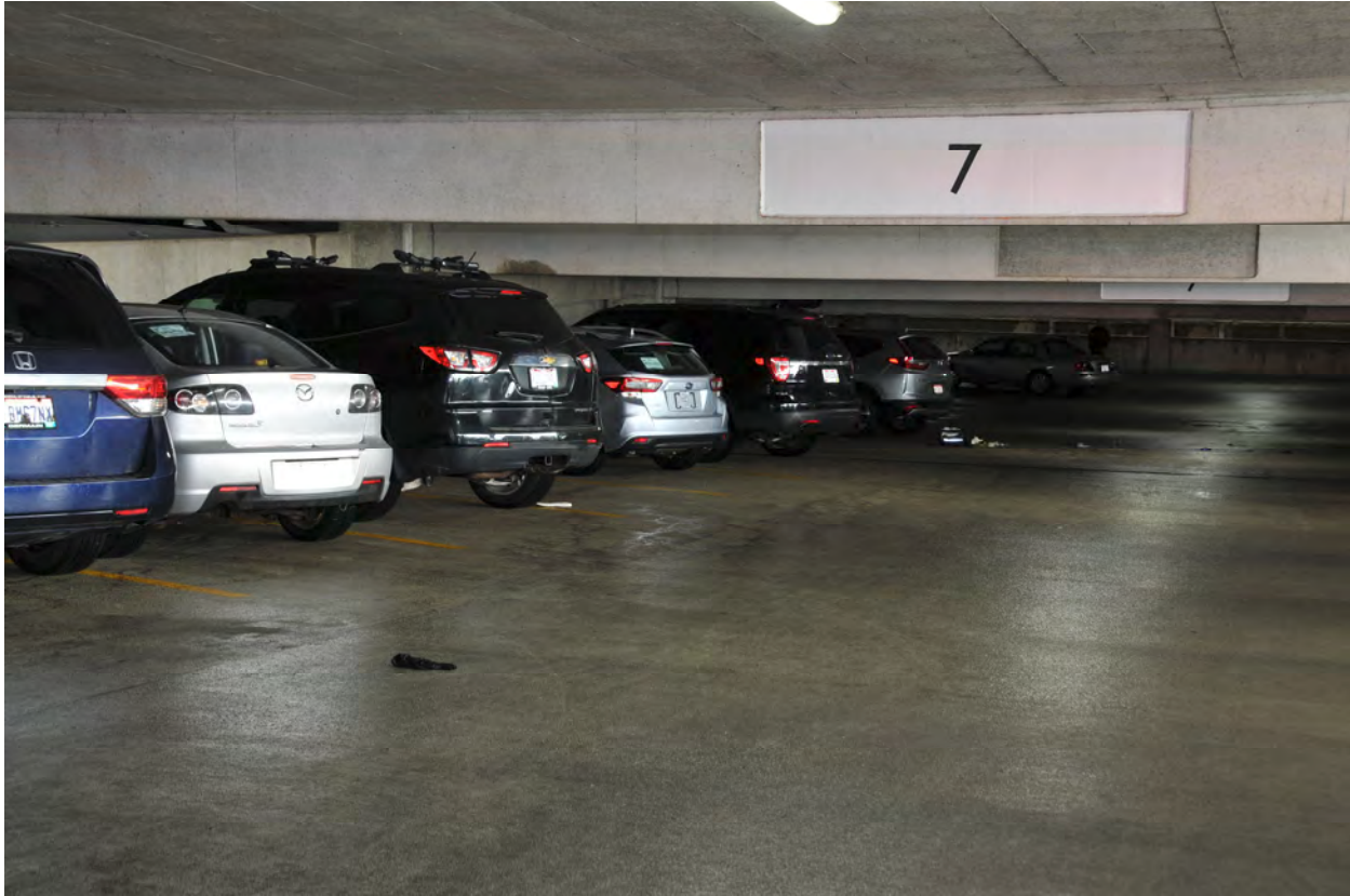
BCI CSU Photo JCD_6106; Overall scene

Officer-Involved Critical Incident – 34 E. Fulton Ave., Columbus 43215