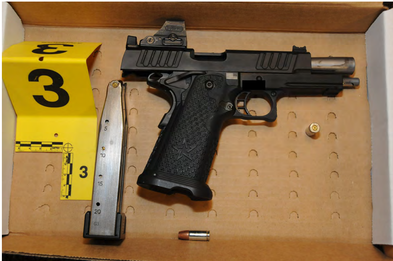
BCI CSU Photo MLA_5879; Item 3, Scene 2 Staccato Pistol

"Source Identification" is described as the analysis identified the items as having extremely strong support for the proposition that the evidence originated from the same source and the likelihood for the proposition that the evidence arose from a different source is so remote as to be considered a practical impossibility.