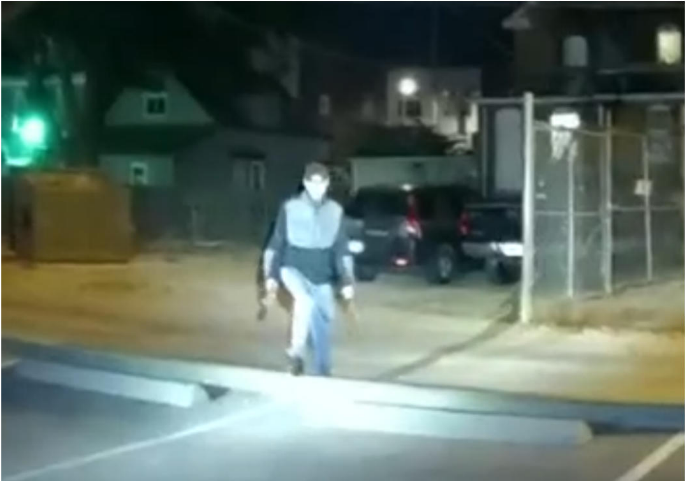
Screenshot from [REDACTED] body-worn camera footage, 01:30:45 hours, 9/10/2024

Ignoring all commands, Mahmoudi stepped onto the parking lot and advanced directly toward [REDACTED]