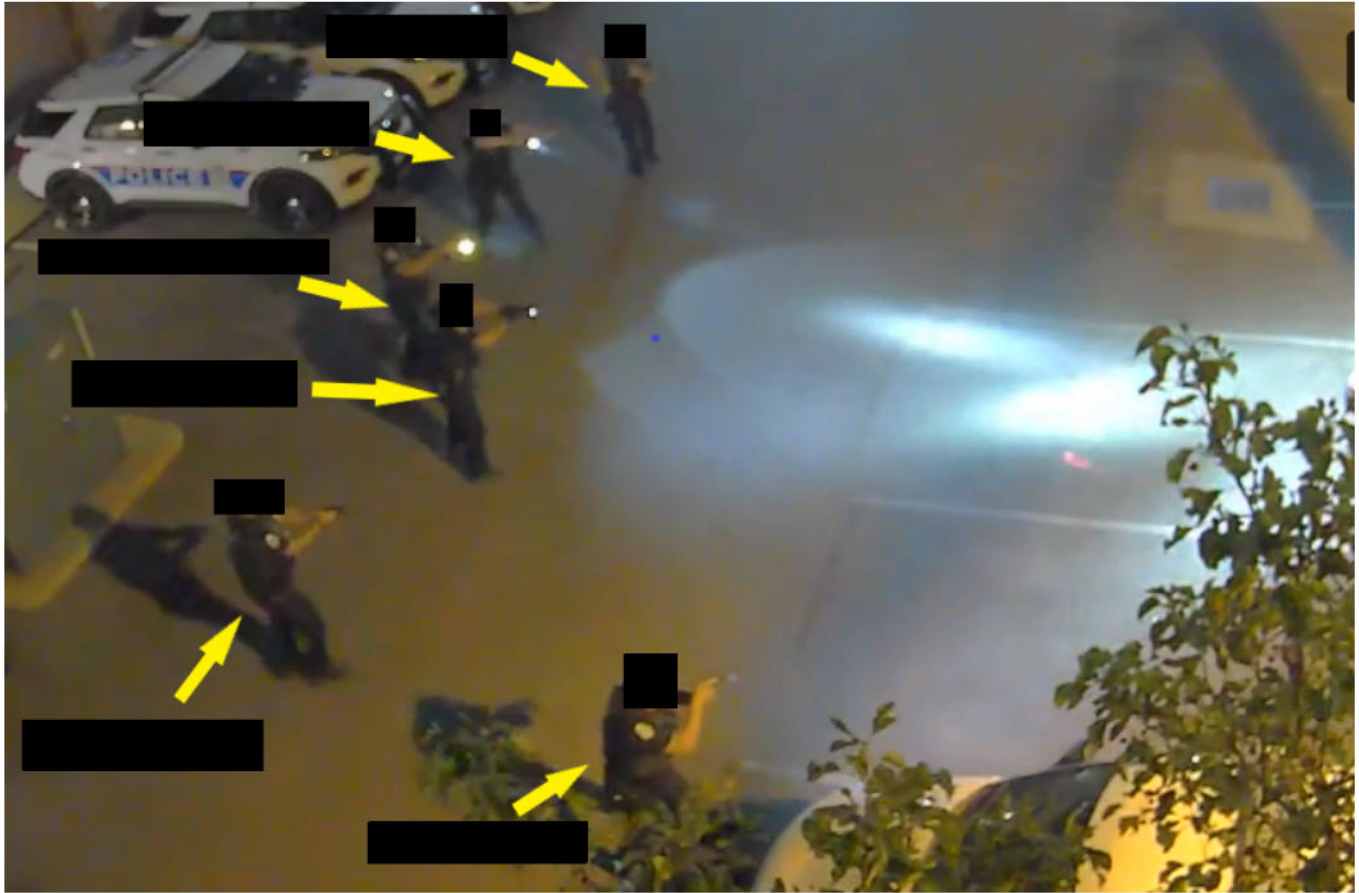
Screenshot from camera overlooking rear parking lot of Precinct 4 substation

The following image, from the same camera view, depicts the officers immediately after their weapons were discharged. The officers then approached Mahmoudi to secured him in handcuffs and render first aid. The officers' positions were documented in the image.