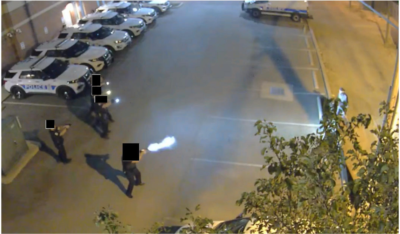
Screenshot from camera overlooking rear parking lot of Precinct 4 substation

The officers then simultaneously discharged their weapons at Mahmoudi. The following image is from a camera overlooking the parking lot of the substation. It depicts the positions of the officers at the moment they discharged their weapons.