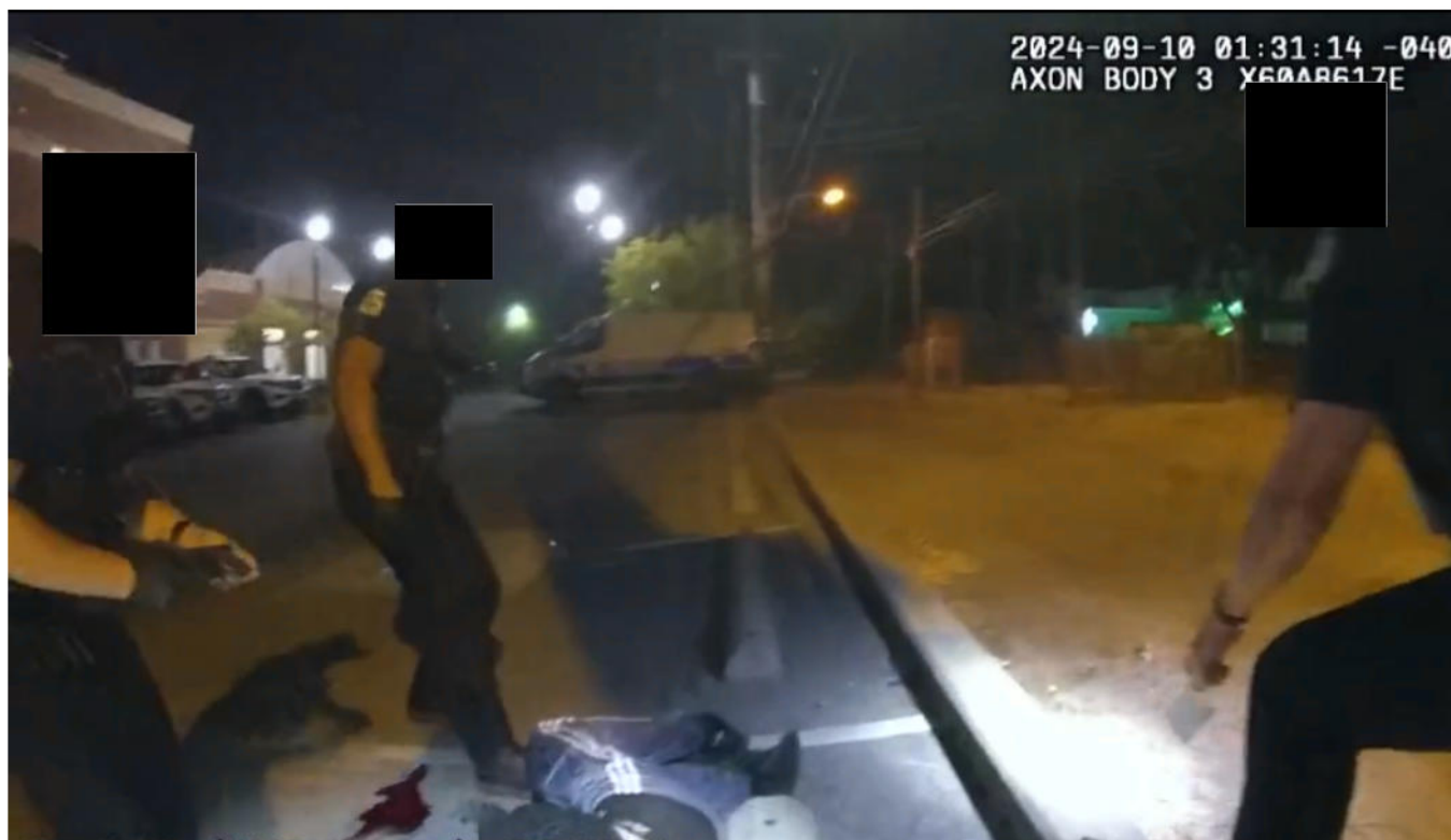
Screenshot from [REDACTED] body-worn camera footage, 01:31:14 hours, 9/10/2024

[REDACTED] moved one of the knives from beneath Mahmoudi's body with his foot, while [REDACTED] moved the other knife by hand.