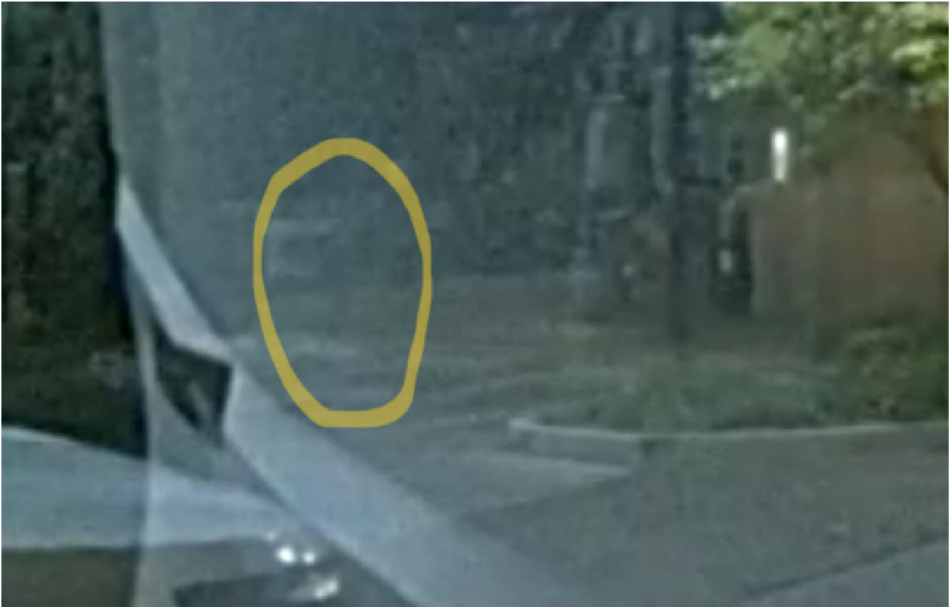
Screenshot from [REDACTED] dash camera footage, 01:29:15 hours, 9/10/2024

Lamine Mahmoudi first appeared in the lower-left corner of [REDACTED] dash camera footage at approximately 0129 hours, highlighted in the image below.