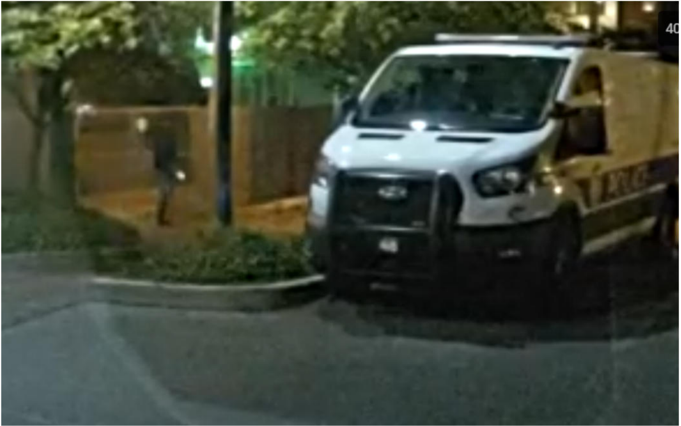
Screenshot from [REDACTED] dash camera footage, 01:29:29 hours, 9/10/2024