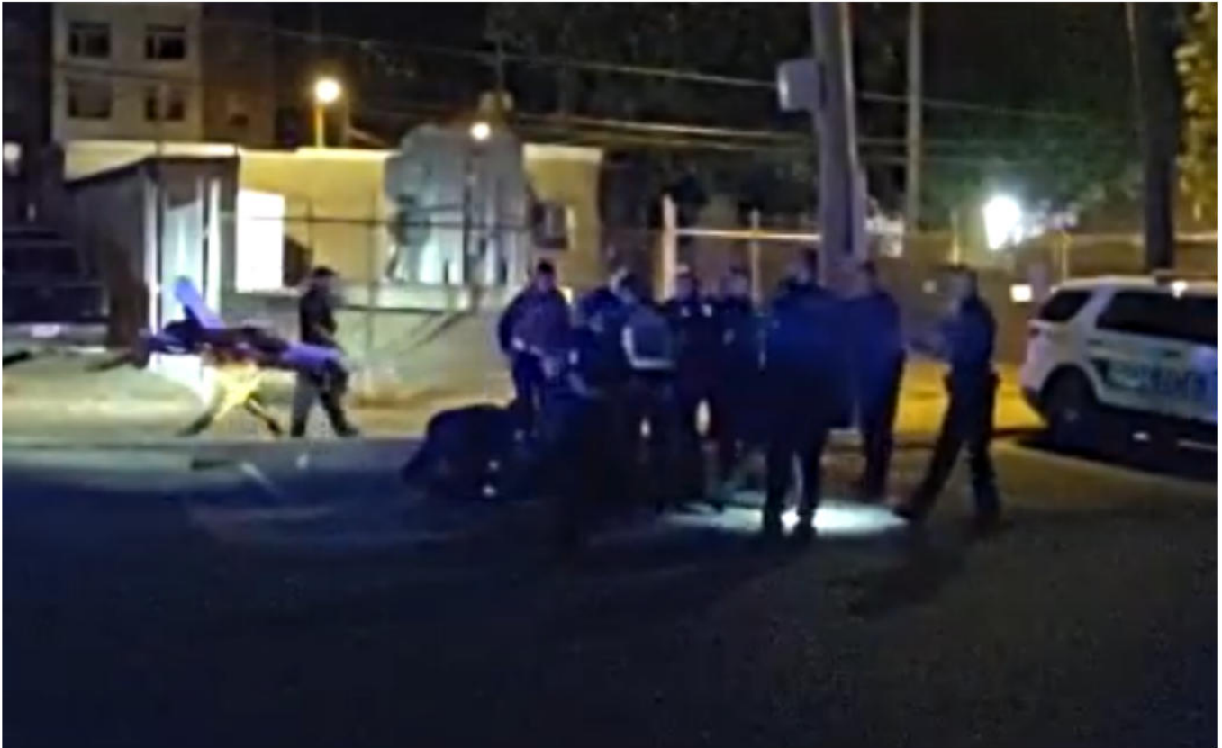
Screenshot from [REDACTED] dash camera footage, 01:36:08 hours, 9/10/2024

Officers continued to render aid until they were relieved by medics at approximately 0136 hours.