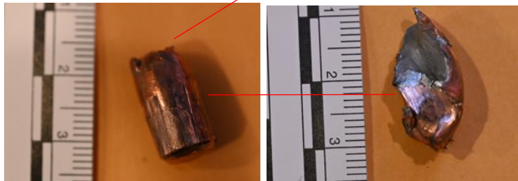
Fired Bullet Location: SW Inv. 13 & 14