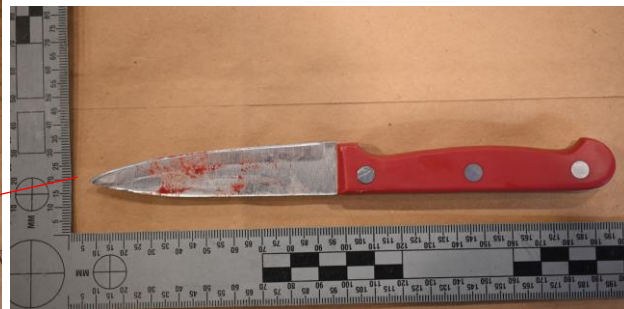
Cooling Unit - North End of Counter - Kitchen Knife with RBS

This document is the property of the Ohio Bureau of Criminal Investigation and is confidential in nature. Neither the document nor its contents are to be disseminated outside your agency except as provided by law - a statute, an administrative rule, or any rule of procedure.