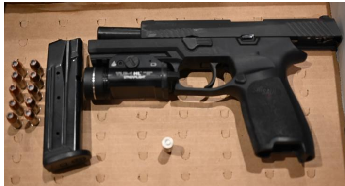
Sgt. Kocher's Sig Sauer Handgun:

Based on a normal load out of seventeen rounds in the magazine plus one in the chamber, it is estimated that a total of seven rounds may have been fired during this incident. This estimate is based on the weapon being loaded to capacity at the time of the incident under normal conditions. Other possibilities exist.