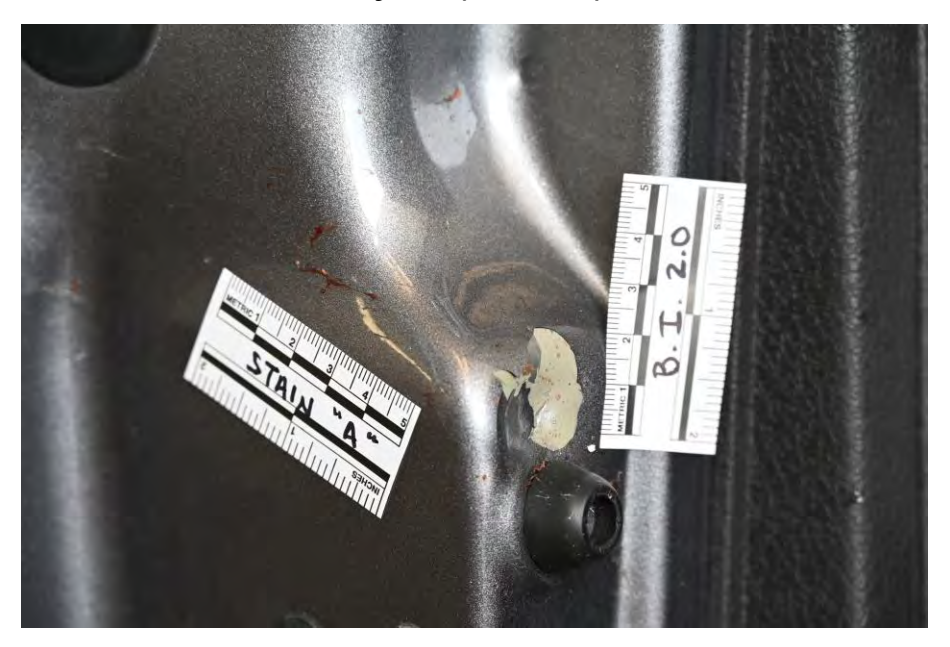
Figure 2: A view of the driver's door jamb side, showing "Stain A" and its position related to "BI 2.0."