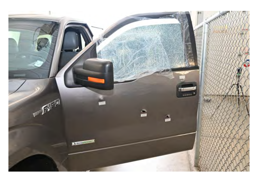
Figure 3: A view of the driver's door exterior with scales and trajectory rods in place.

2024-3052 Officer Involved Critical Incident - 10300 block Silvercreek Road, Doylestown, Ohio 44230, Medina County