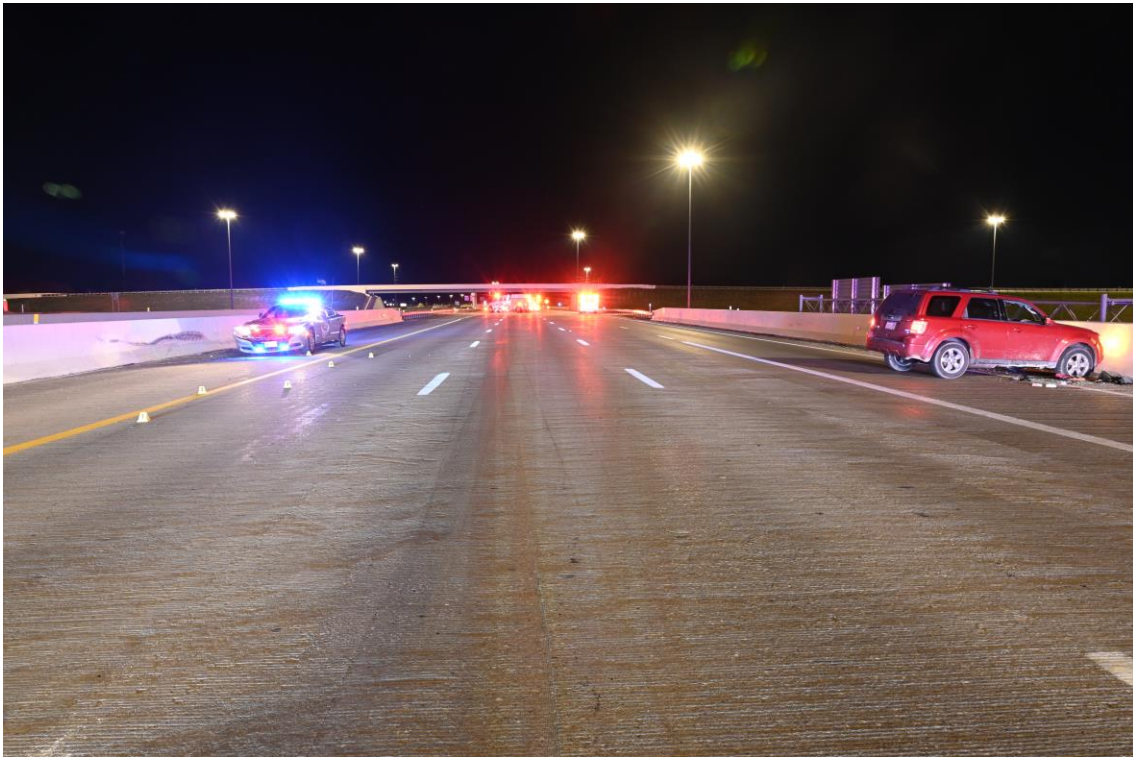
Image 1. I-275 southbound bridge over SR 32

Officer Involved Critical Incident - Interstate 275 / State Route 32, OH, 45245 (Clermont County) (L)