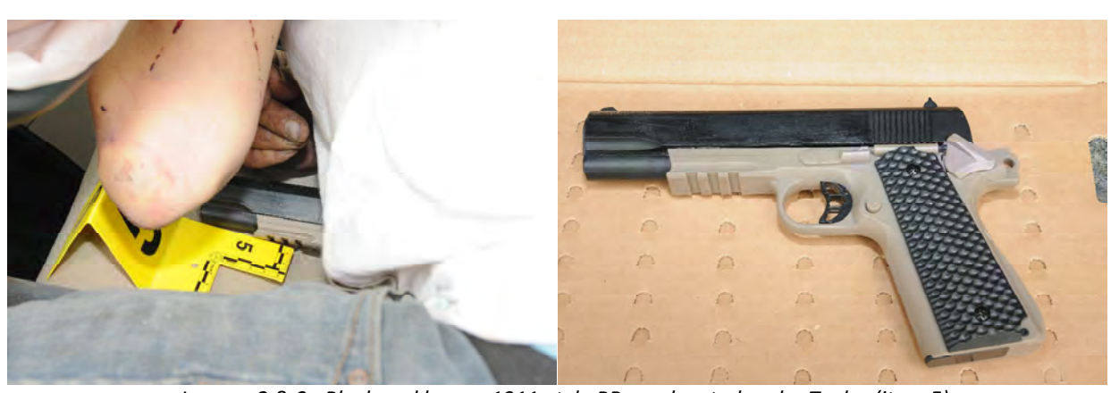
Images 2 & 3. Black and brown 1911-style BB gun located under Taylor (item 5)

Agents were able to pry open the front driver door to gain access to the front driver seat area. Slumped to the right, over the center console, was a young white male with short brown hair. The male, later identified as Devon Taylor, was wearing a white t-shirt, blue jeans, blue Hanes boxers, and Air Jordan shoes. A blue bandana was also tied loosely around his neck. Blood appeared to be coming from an injury to Taylor's head and suspected gunshot wounds were visible along his back, left arm and into his left thigh. From the passenger side front door, SA Austin observed the front sight of a firearm in the area of Taylor's lap. As Agents began to move Taylor, a black/brown handgun barrel became visible under his torso. SA Austin collected a plastic black/brown BB handgun (S/N 21C24408) that contained a magazine with BBs as item 5. The BB gun was in the style of a 1911 pistol and featured a cocked hammer that appeared broken along with a safety that was engaged. It should be noted that the BB gun appeared visually consistent with a real firearm and it was not until it was handled that the weight and construction difference became noticeable.