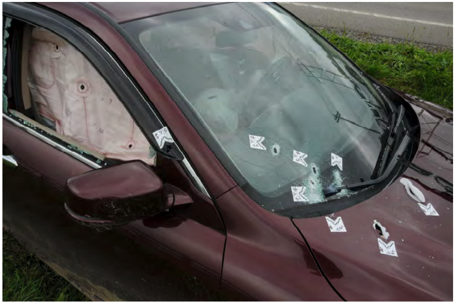
Image 4. BEs 3 through 12, 20 (BEs 1-2 further to the right into hood)

From the exterior of the vehicle, multiple ballistic events (BE) were observed and numerically labeled for identification purposes. BEs 1-5 were located in the hood of the vehicle with characteristics of a flight path from the front passenger corner of the vehicle. BEs 4 and 5 continued through the lower passenger corner of the windshield at 4.1 and 5.1 into the cabin of the vehicle. BEs 6 and 7 were distinct oval shaped bullet holes with beveling that indicated a shot direction of outside the vehicle into the vehicle. BE 8 was a hole that went through the upper edge of the front passenger door and appeared to stop at the A pillar evidenced by bullet splash. BEs 9-12 were suspected bullet holes through the dropdown side curtain air bag at the front passenger seat. BEs 9-11 were described as ragged holes in the airbag with smaller areas of secondary fragmentation damage whereas BE 12 was a circular hole with apparent bullet wipe. All of the observed damage indicated a shot direction from outside of the vehicle towards the area of the front driver seat. An additional suspected bullet hole in the front edge of the front passenger airbag was later located (BE 20).