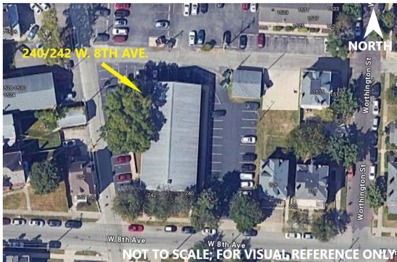
Overhead view of 240, 242 W. 8th Ave.

██████████ said he was uncertain which corner of the building it was. He did state that some officers shot at the suspect, then he disappeared again. ██████████ said he did not know which officers shot at the suspect, but the shots were preceded by numerous commands for the suspect to drop his weapon. ██████████ explained they searched around the building, and realized that the suspect was likely not struck, because there was no evidence of any blood loss.