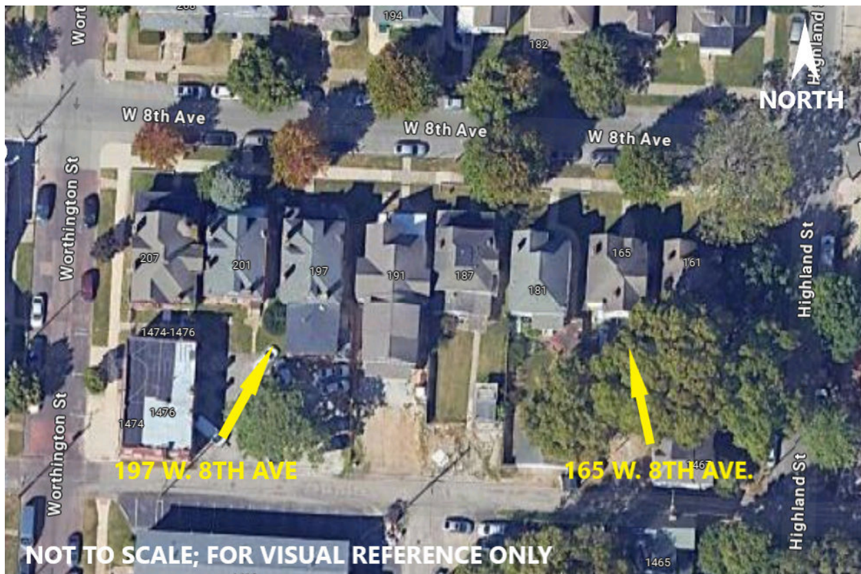
Overhead map of 100 block of W. 8th Ave.

██████████ mentioned that the officers backed up a bit when it was broadcast that the suspect was reloading. ██████████ stated that after the initial gunshots ceased and officers backed out of the house, a single gunshot was heard and a round came flying out one of the windows at the back of the structure.