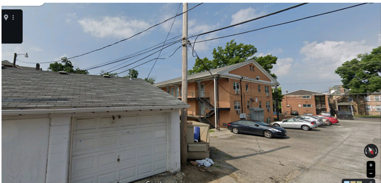
Image from Google Street View facing NE corner of 240/242 W. 8th Ave.

██████████ explained that officers cautiously searched the area for the suspect, and at one point, he was located near the corner of a multi-level apartment building, on its lower level. Given this description, ██████████ was shown an image from Google Street View, facing the northeast corner of 240/242 W. 8th Ave. ██████████ recognized the building, and he confirmed that it was the location where the suspect was spotted.