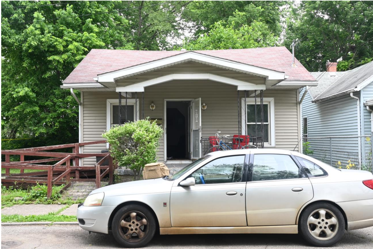
Image 1. Overall of 909 Garden Avenue

Officer Involved Critical Incident - 909 Garden Ave., Middletown, OH 45044 (L)