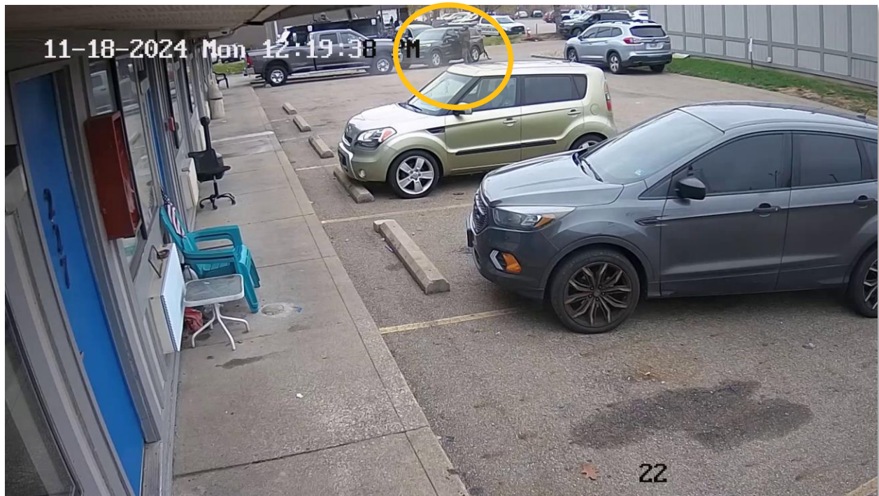
Camera 22 - Screenshot 1

At 01:57:03 officers could be observed forming a perimeter around the crime scene using yellow police tape. The remainder of the video appeared to be the management of the scene, which included the arrival of agents from BCI.