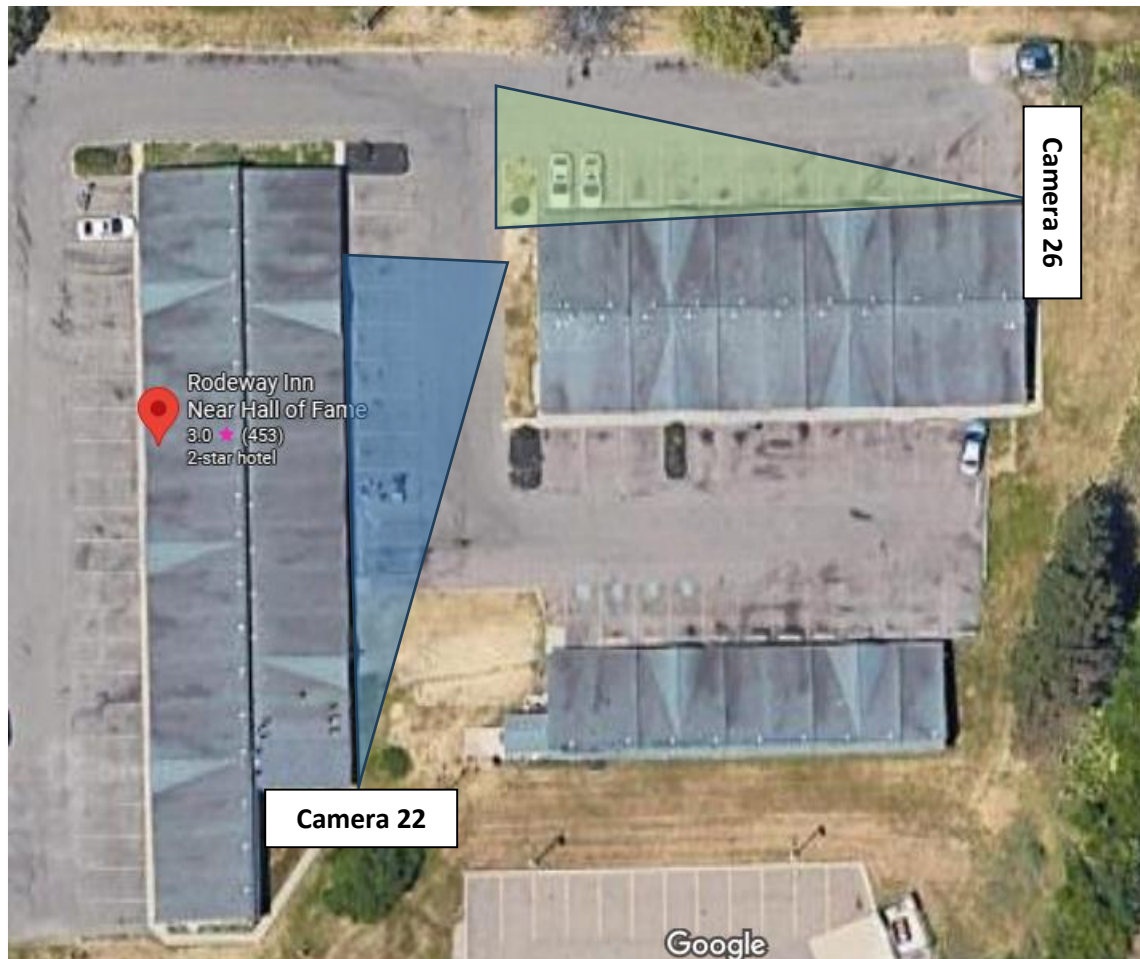
Map Figure 1

Officer Involved Critical Incident - 6880 Sunset Strip Ave NW, Room #220, North Canton, Ohio, 44720