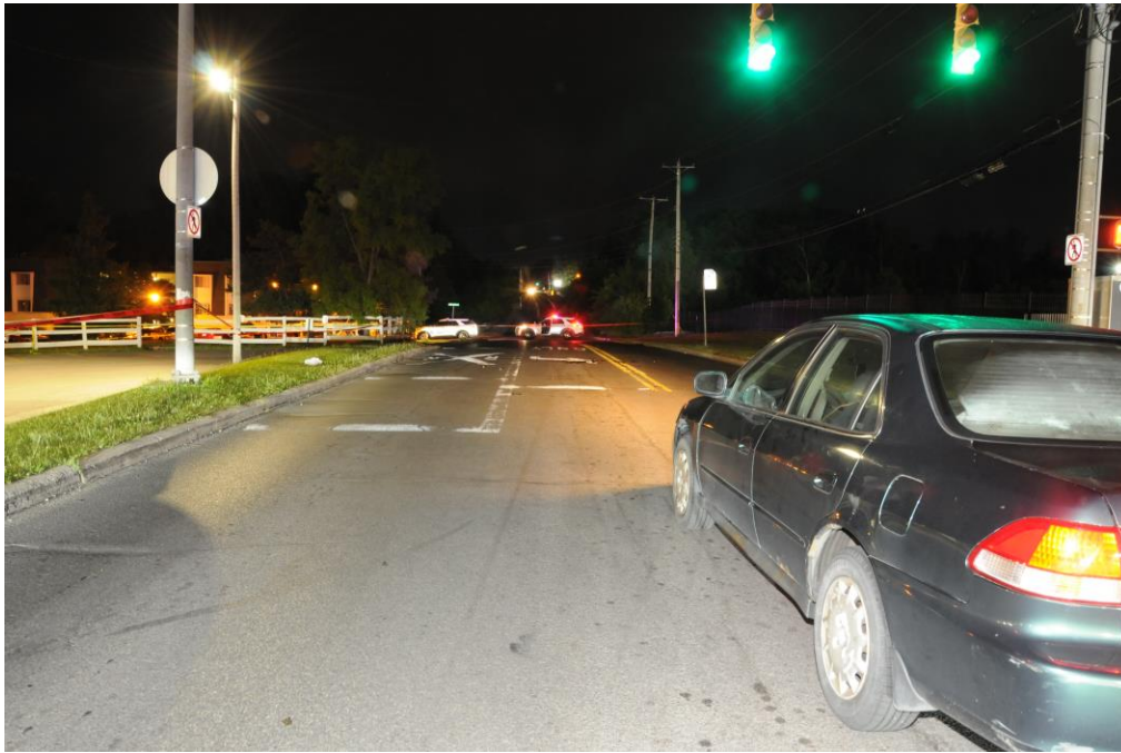
ALC_8122: Facing West

Officer-Involved Critical Incident – 24-1755