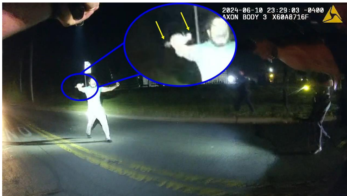
Figure 3 [REDACTED] BWC): F9995_Cortaza continuing into direction of officers with something sticking out of both side of his right hand

This document is the property of the Ohio Bureau of Criminal Investigation and is confidential in nature. Neither the document nor its contents are to be disseminated outside your agency except as provided by law - a statute, an administrative rule, or any rule of procedure.