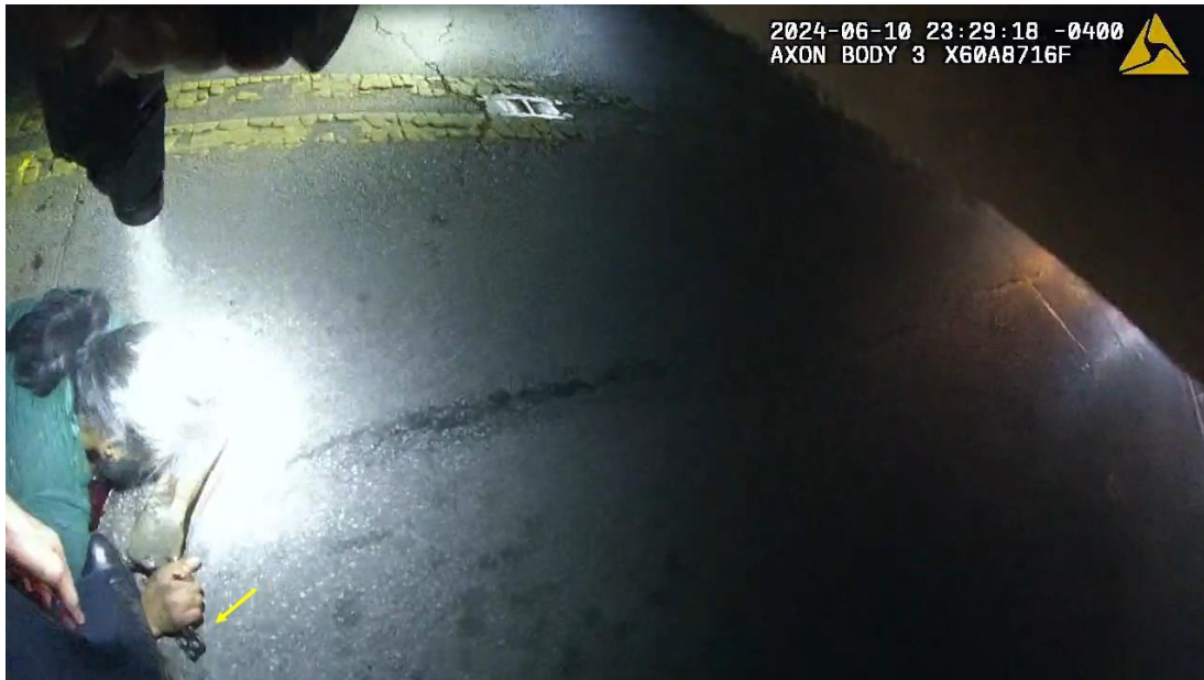
Figure 6 [REDACTED] WC): F104226_Item in Cortaza's right hand_removed by [REDACTED]

After shots were fired, officers approached Cortaza. The item in his right hand was removed by [REDACTED] (see Figure 6)