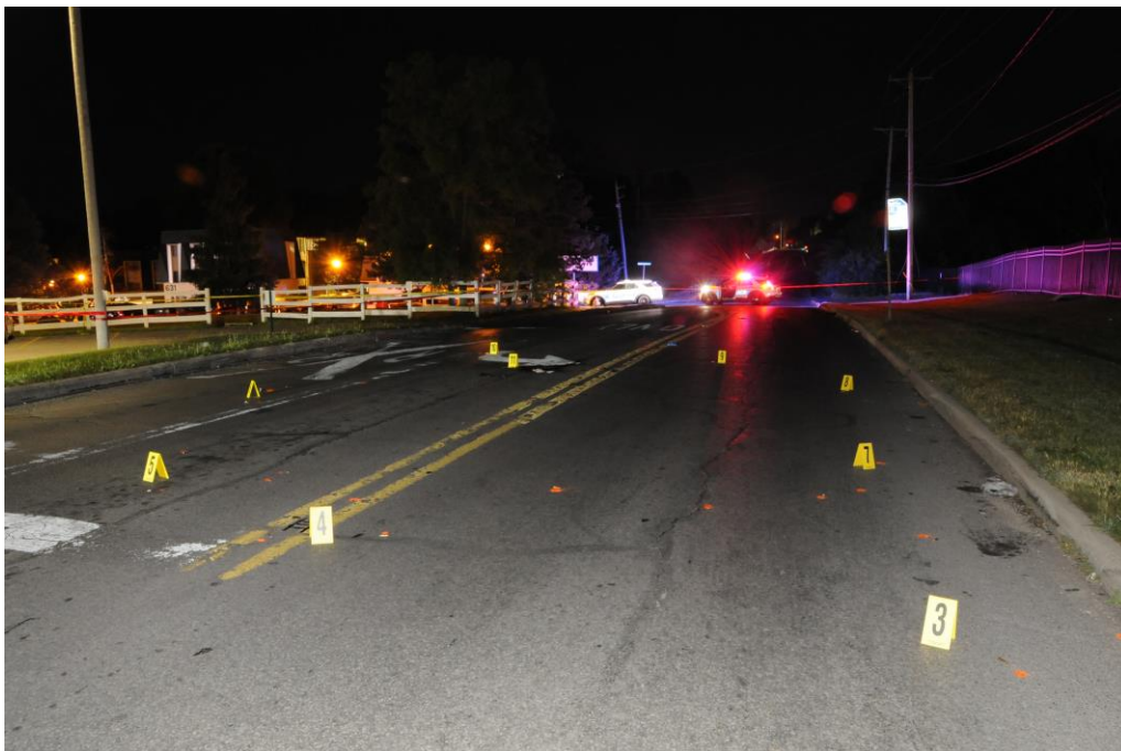
ALC_8138: Facing West/Southwest

This document is the property of the Ohio Bureau of Criminal Investigation and is confidential in nature. Neither the document nor its contents are to be disseminated outside your agency except as provided by law - a statute, an administrative rule, or any rule of procedure.