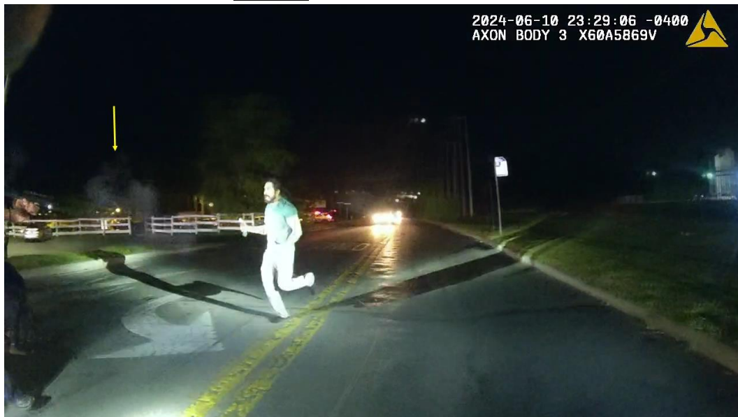
Figure 5 [REDACTED] BWC); F26346_Approximate moment 1 st shots were fired.

This document is the property of the Ohio Bureau of Criminal Investigation and is confidential in nature. Neither the document nor its contents are to be disseminated outside your agency except as provided by law - a statute, an administrative rule, or any rule of procedure.