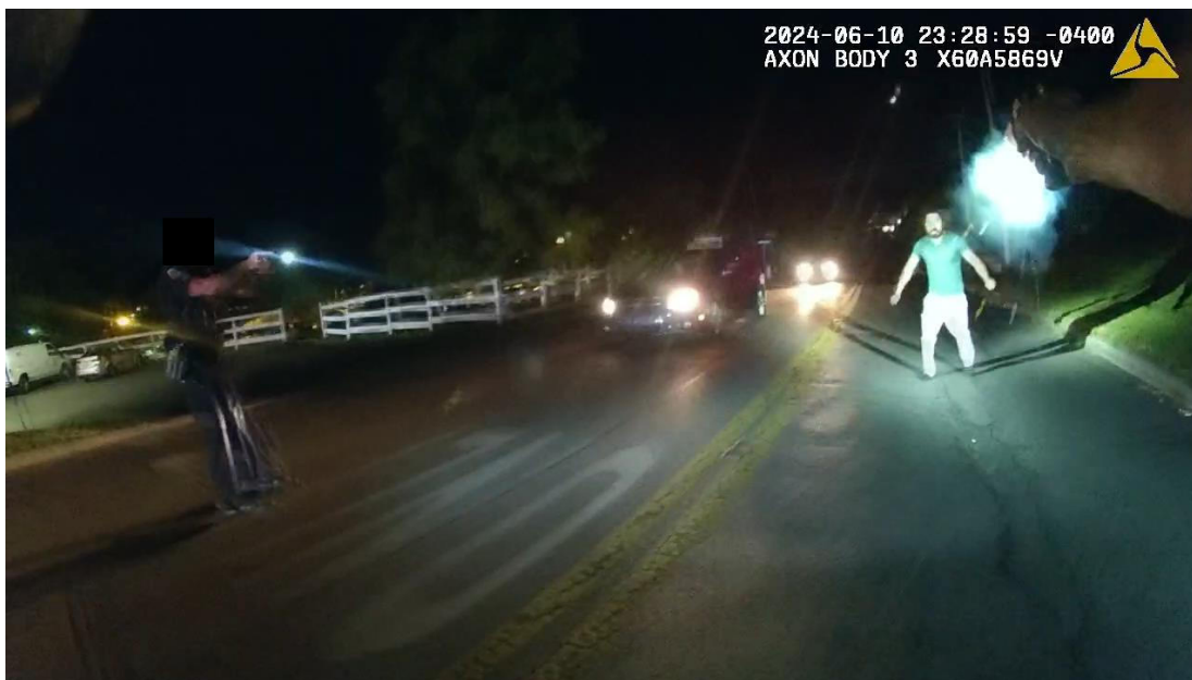
Figure 1 [REDACTED] BWC): F26166_ 2 nd Taser deployment

This document is the property of the Ohio Bureau of Criminal Investigation and is confidential in nature. Neither the document nor its contents are to be disseminated outside your agency except as provided by law - a statute, an administrative rule, or any rule of procedure.