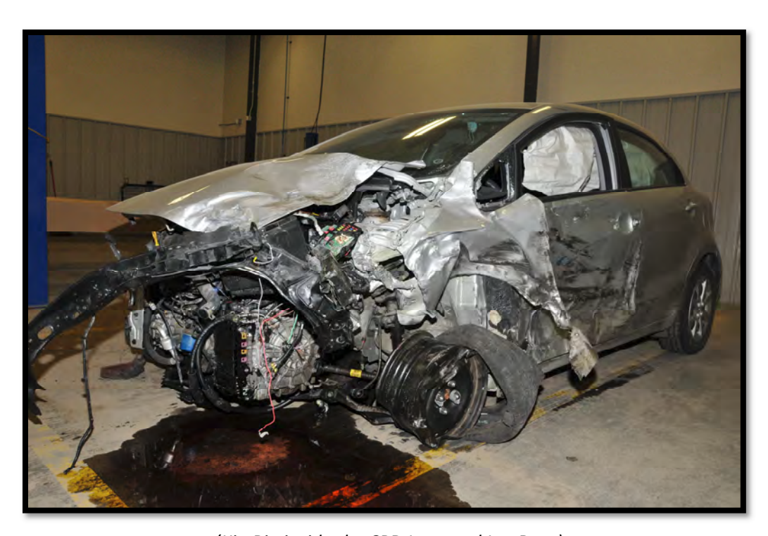
(Kia Rio inside the CPD Impound Lot Barn)

SA Holcomb observed a black Samsung cell phone (Item #1) located in the rear center cup holder. A blue Samsung cell phone was located on the rear passenger side floorboard and collected as Item #2. SA Holcomb observed a suspected bloodstain on the steering wheel airbag. SA Holcomb used Tetramethylbenzidine<sup>1</sup> (TMB) on the suspected bloodstain. The suspected bloodstain was presumptively positive for the presence of blood. SA Holcomb collected two swabs of the suspected blood as Item #3.