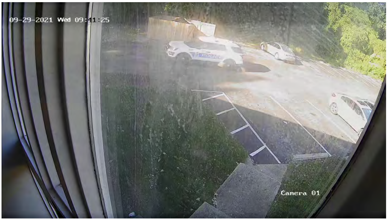
Figure 2: F37259_Ext. Trash_CPD vehicle hits speed bump.

However, based on statements and body camera review, officers Balmert and Hawkins were traveling in the area of the apartment complex looking for the potential caller on the open line. It should be noted a CPD marked patrol car was witnessed traveling past the dumpster enclosure and hit the speed bump at 09:41:25 (time-stamp on video). See Figure 2. This information is noted for approximate timing purposes related to other videos. Please refer to the body camera review, investigative report for further information.