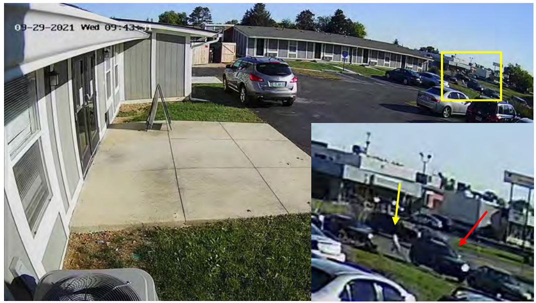
Figure 5: F40720_Ext. Office2_Subject in gray shirt began running (yellow arrow) from SUV (red arrow). Arrows added by SA Collins.