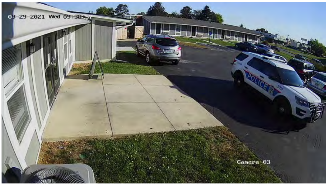
Figure 3: F36603_Ext. Office_CPD vehicle pulls through parking lot.

At 09:38:57, a CPD Marked patrol vehicle (9091) was seen pulling through the parking lot. See Figure 3 .