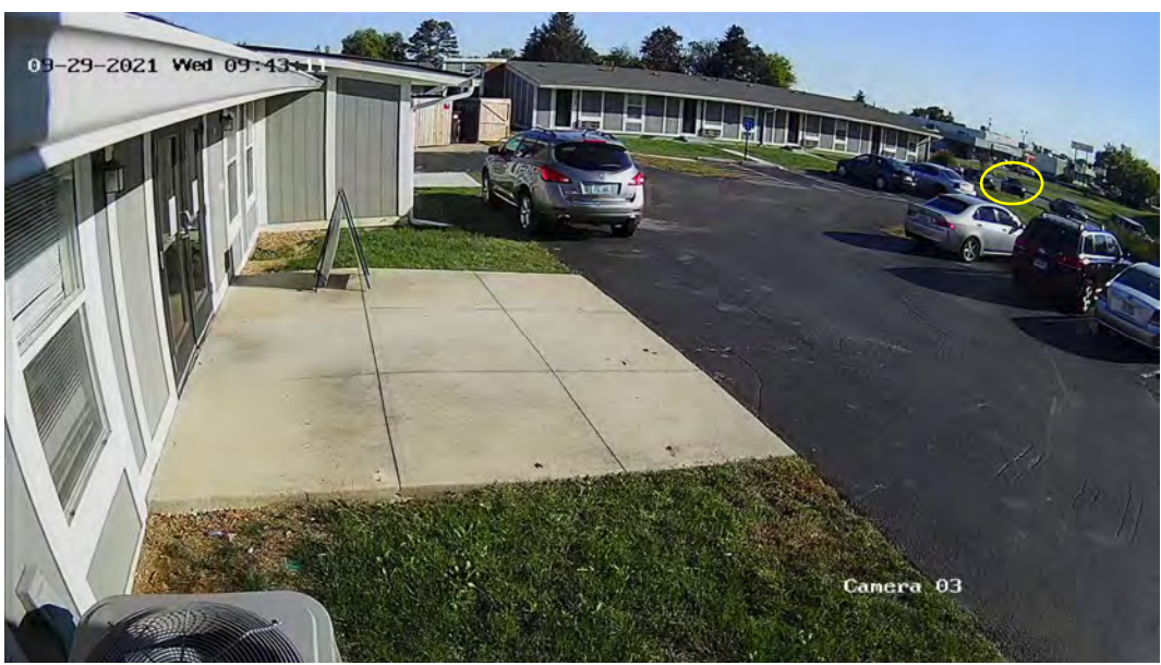
Figure 4: F40415_Ext. Office2_SUV parks on Kimberly

At 09:43:11, a dark colored SUV was seen traveling south on Kimberly Pkwy before parking on the west side of the roadway. A subject was seen exiting the driver's side of the vehicle, walking around the front of the vehicle and then appeared to respond to something as they quickly began running northwest behind an apartment building (09:43:31). See Figures 4 and 5 .