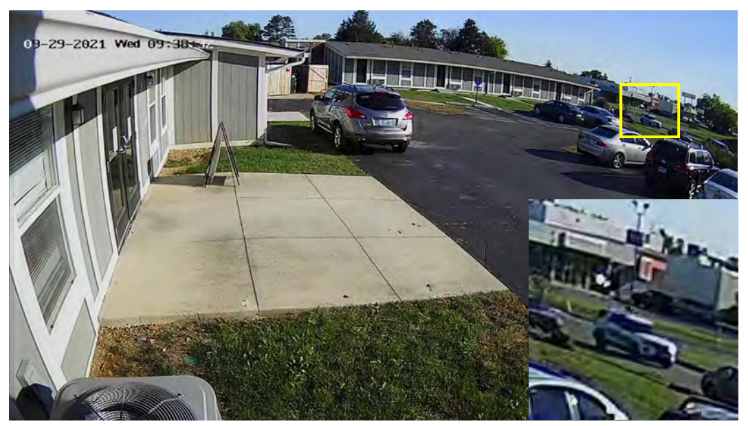
Figure 2: F36229_Ext. Office2_CPD vehicle on roadway. Yellow box added by SA Collins. Cropped area in lower right of photo.

When reviewing the exterior office camera, a CPD marked patrol vehicle was seen coming into the area (on Kimberly) at 09:38:32. See Figure 2 .