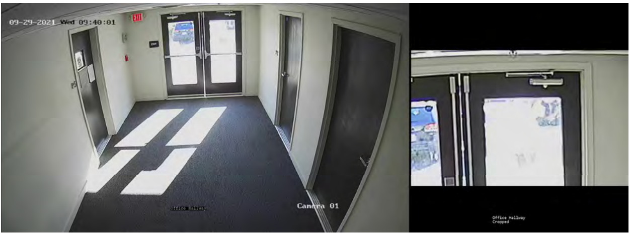
Figure 2: F251_Synced Hallway and Enlarged area of video.

which is a marked image from a synced video created by SA Collins. The video has the area of the doorway enlarged (on the right).