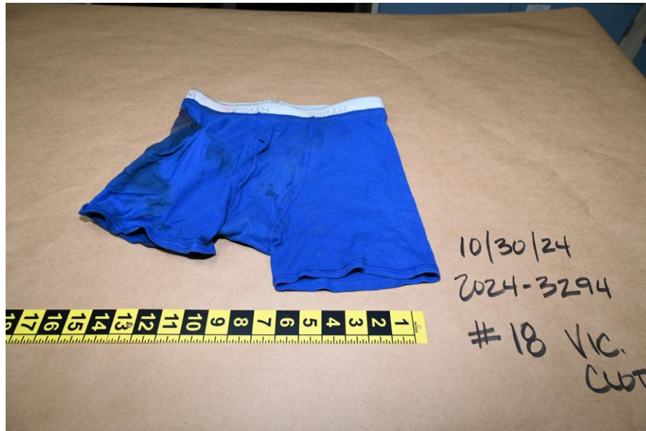
Figure 4, Clothing

Investigation - Officer Involved Critical Incident - Portage Bike Trail Near North Freedom St., Ravenna, Ohio: