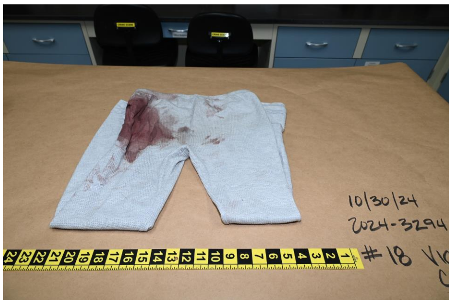
Figure 3, Clothing

This document is the property of the Ohio Bureau of Criminal Investigation and is confidential in nature. Neither the document nor its contents are to be disseminated outside your agency except as provided by law - a statute, an administrative rule, or any rule of procedure.