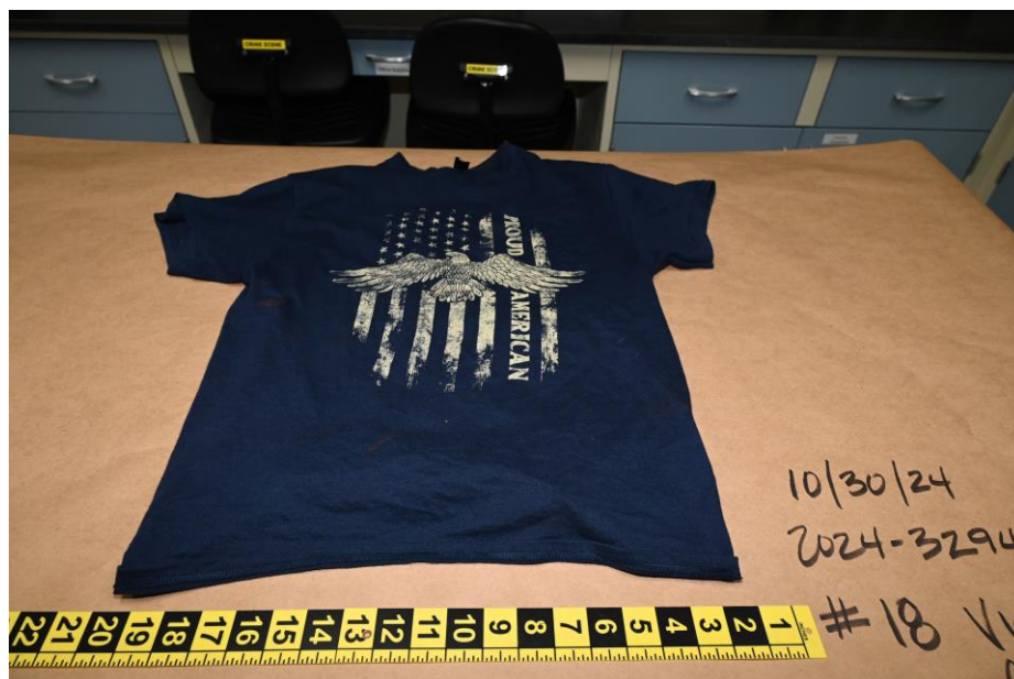
Figure 5, Clothing

This document is the property of the Ohio Bureau of Criminal Investigation and is confidential in nature. Neither the document nor its contents are to be disseminated outside your agency except as provided by law - a statute, an administrative rule, or any rule of procedure.