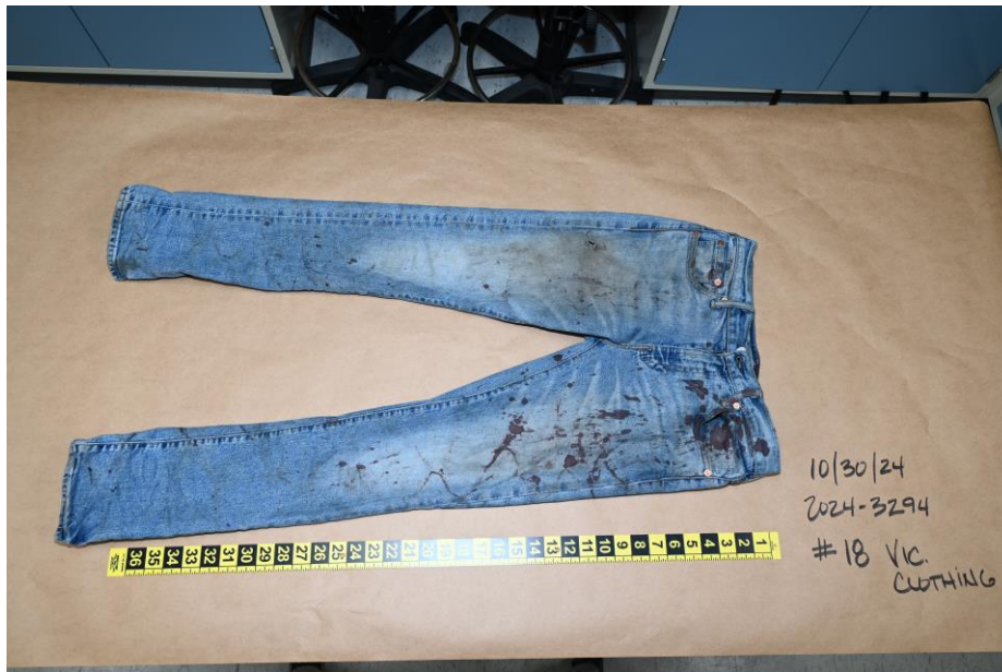
Figure 1, Clothing

On Wednesday, October 30, 2024, SA Dan Boerner removed Larry Burghy's clothing (Item 18) from the drying room and photographed the clothing as found (Figures 1-6, Clothing). Item 18 consists of a pair of blue jeans, a pair of gray thermal pants, a pair of blue underwear, a blue t-shirt, and a pair of work boots. The clothing was repackaged in clean paper bags and placed into temporary evidence cabinet #40. The photographs were subsequently uploaded to Matrix.