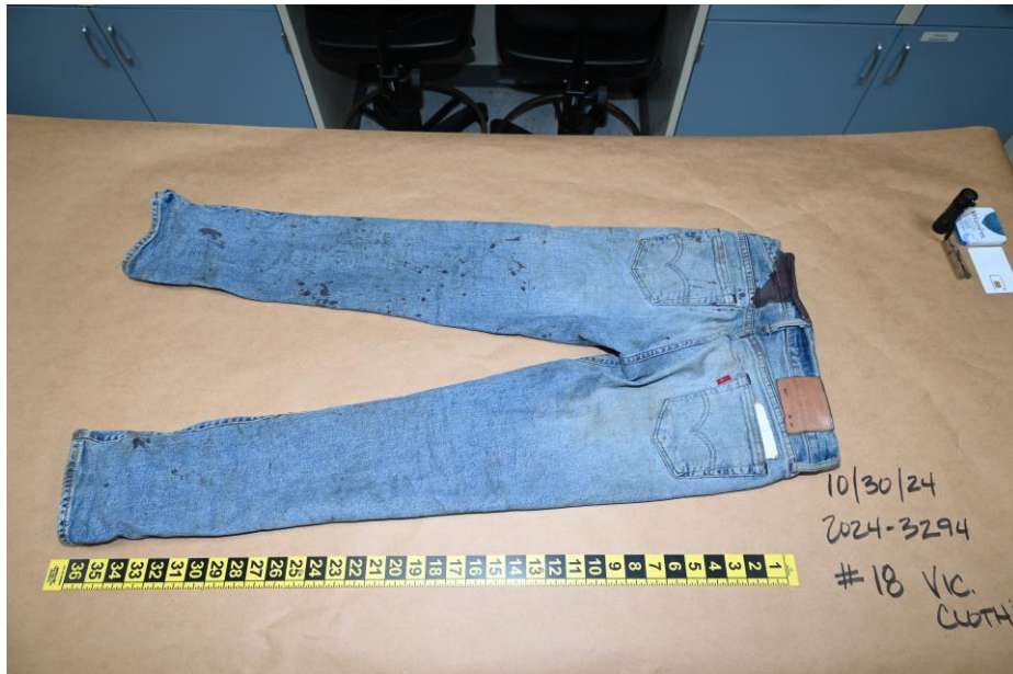
Figure 2, Clothing

Investigation - Officer Involved Critical Incident - Portage Bike Trail Near North Freedom St., Ravenna, Ohio: