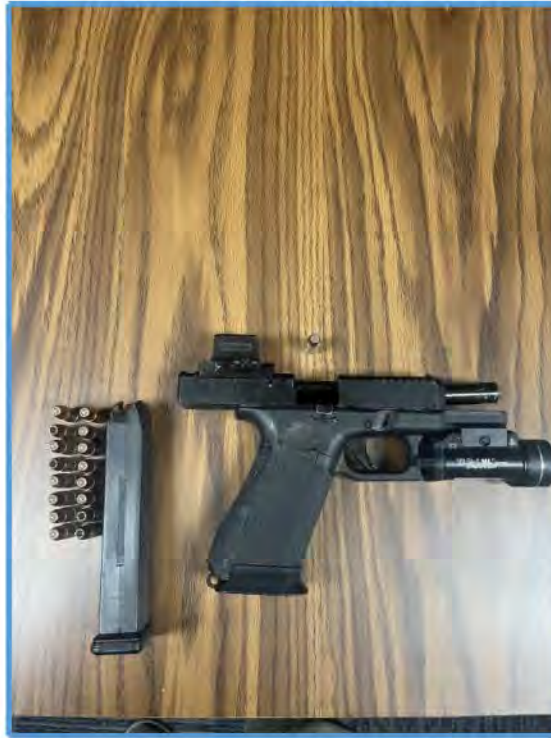
IMG_0786 [REDACTED] Firearm

Officer Involved Critical Incident - 3487 Belmont Avenue, Youngstown, Ohio, 44505