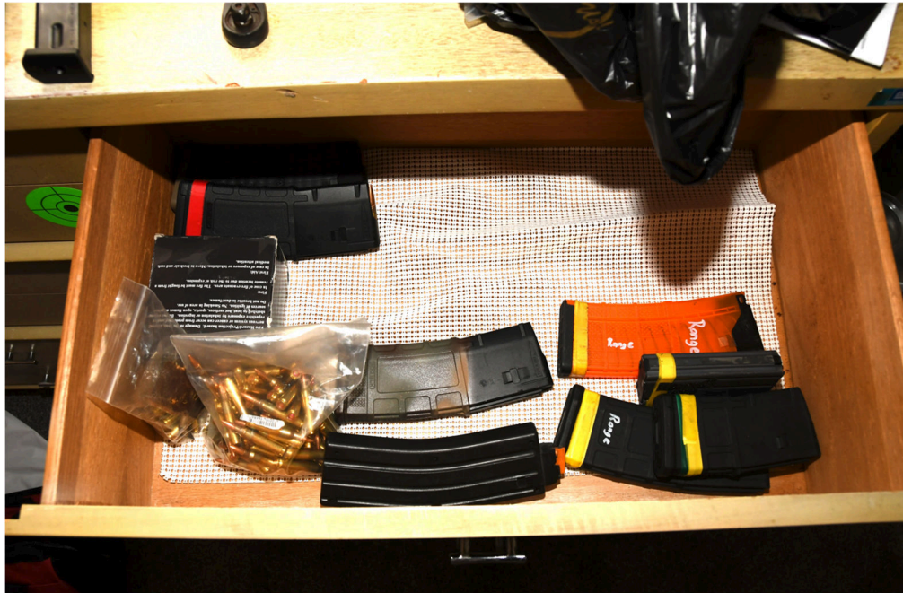
DMH_6347 Photograph of Drawer - Home Office/Guitar Room 1917 Delence St. Toledo, Ohio

Officer Involved Critical Incident, 27695 Tracy Road, Walbridge, OH 43465, (L)