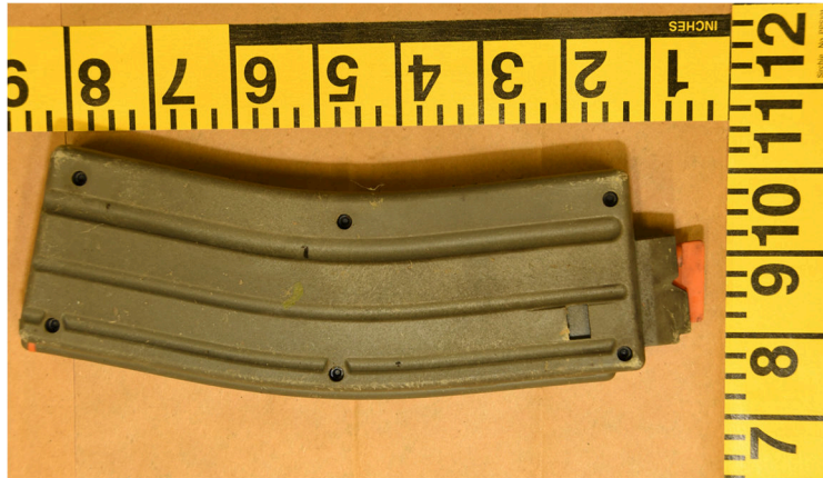
DMH_6949 Photograph of Evidence Submitted by Perrysburg Twp. PD

2024-1584 Officer Involved Critical Incident, 27695 Tracy Road, Walbridge, OH 43465, (L)