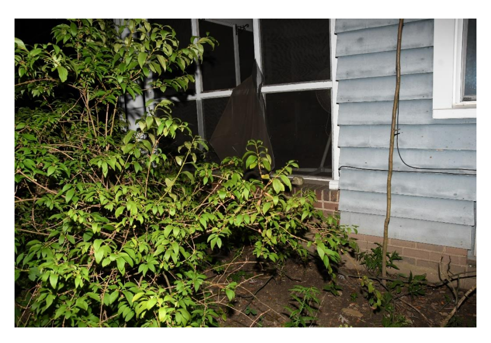
Figure 9, Exterior 1309

2024-2614 Officer Involved Critical Incident - 1309 Yellowstone Rd., Cleveland Hts., Ohio 44121