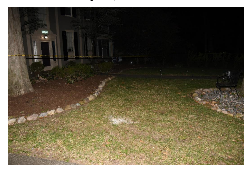
Figure 5, Exterior 1305