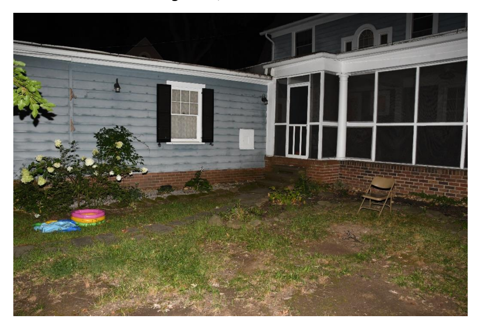
Figure 10, Exterior 1309