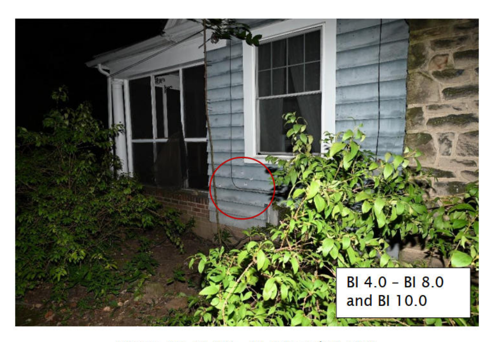
Figure 22, BI 4.0 - BI 8.0 and BI 10.0

2024-2614 Officer Involved Critical Incident - 1309 Yellowstone Rd., Cleveland Hts., Ohio 44121