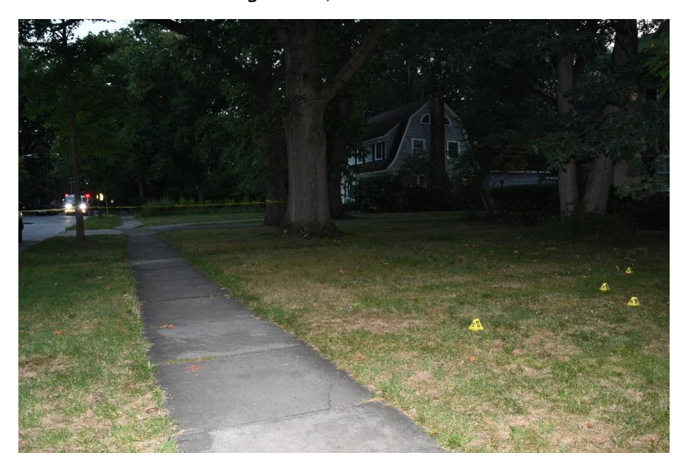
Figure 18, Items 23-27