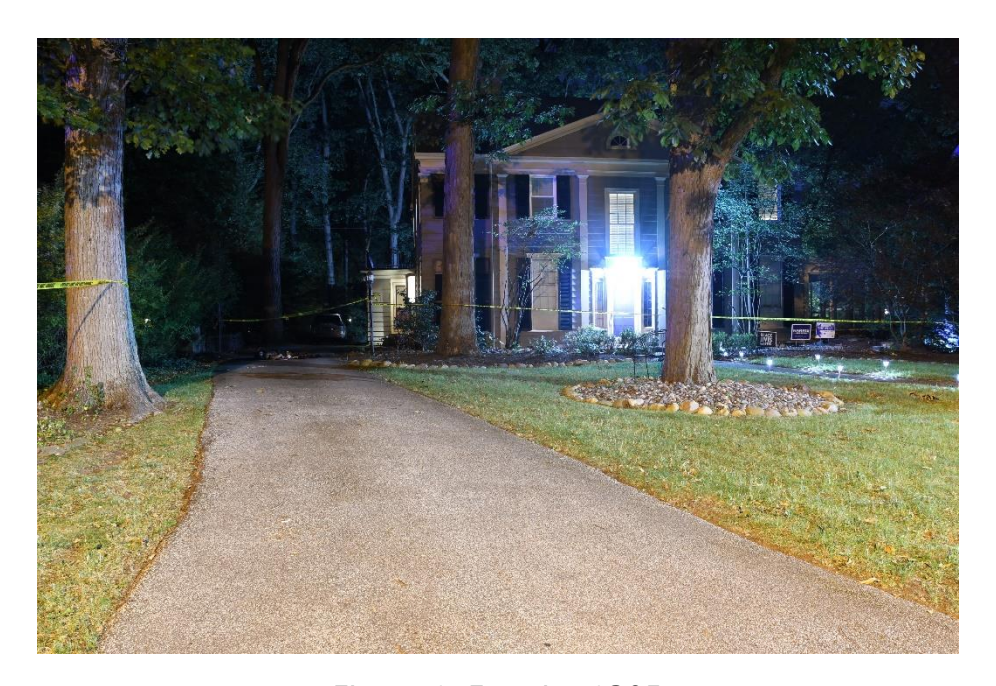
Figure 1, Exterior 1305

On Friday, August 30, 2024, at approximately 0151hrs, SAs Boerner and McClintock learned that written consent to search to search the exterior of the property located at 1305 Yellowstone Rd., Cleveland Hts., Ohio 44121 had been obtained. Overall photographs were taken of the driveway, the front yard, the front flower beds and side yard (South side) (Figures 1-6, Overall photographs – 1305 Yellowstone Rd).