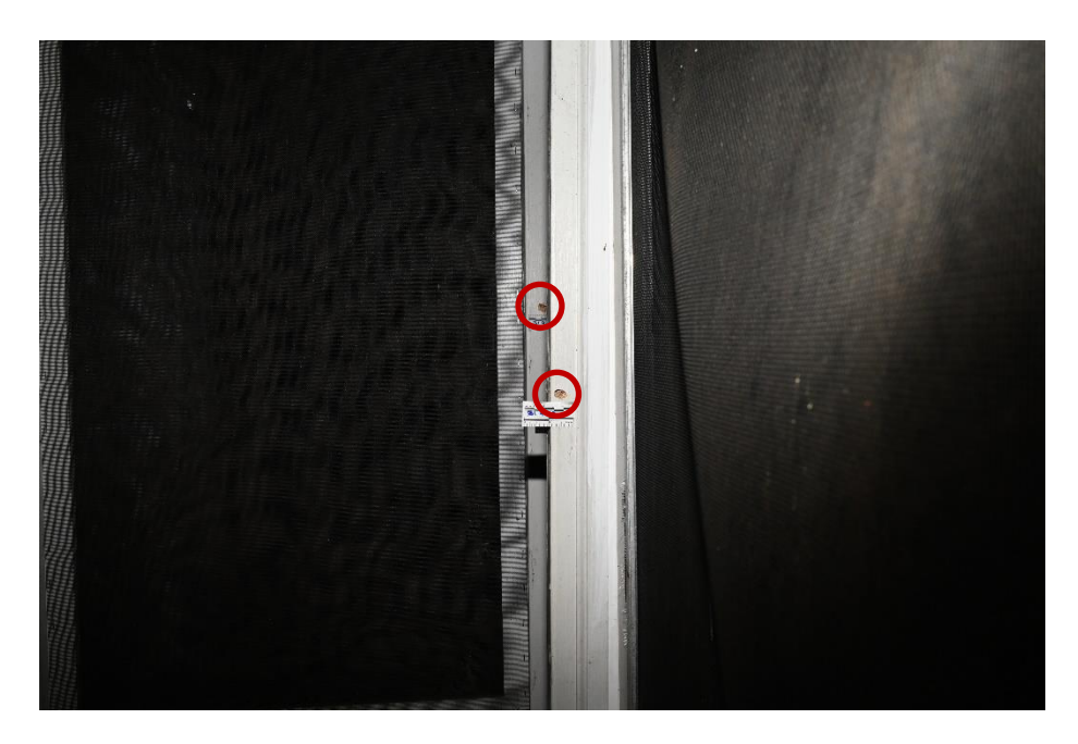
Figure 26, BI 9.2 - BI 9.4

2024-2614 Officer Involved Critical Incident - 1309 Yellowstone Rd., Cleveland Hts., Ohio 44121