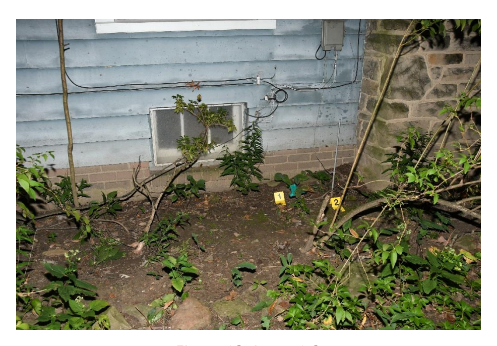
Figure 13, Items 1-2

2024-2614 Officer Involved Critical Incident - 1309 Yellowstone Rd., Cleveland Hts., Ohio 44121