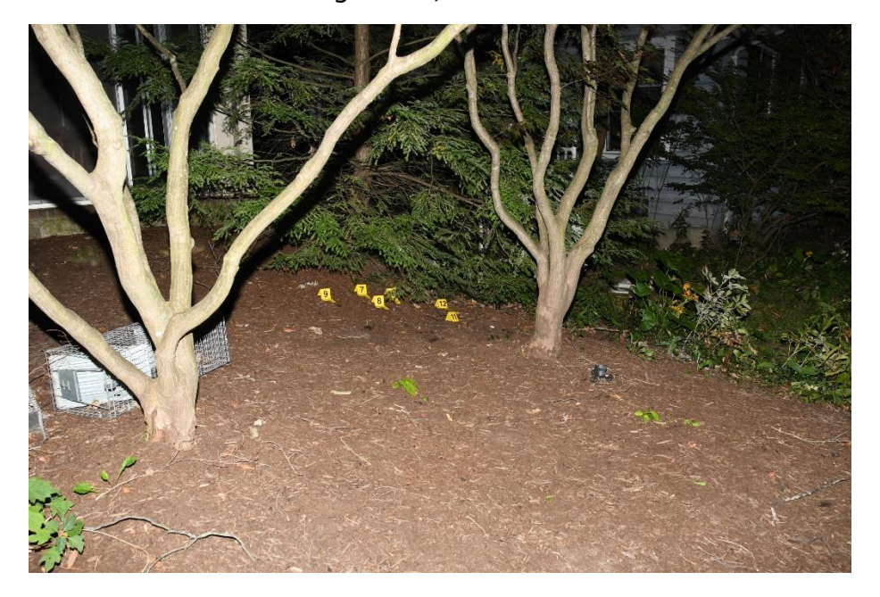
Figure 16, Items 7-12