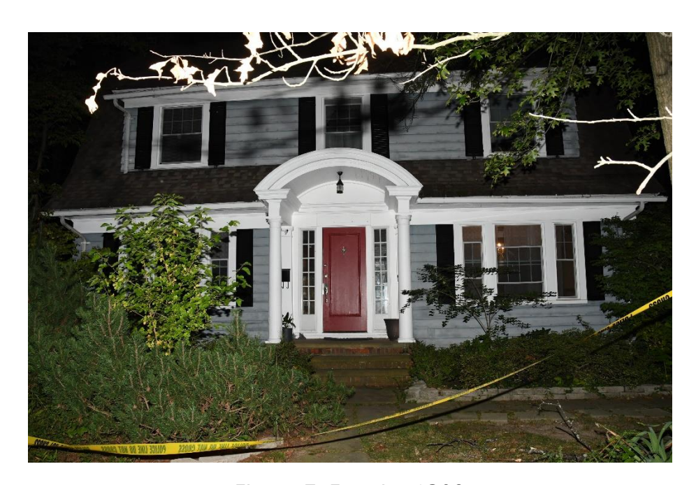
Figure 7, Exterior 1309

2024-2614 Officer Involved Critical Incident - 1309 Yellowstone Rd., Cleveland Hts., Ohio 44121