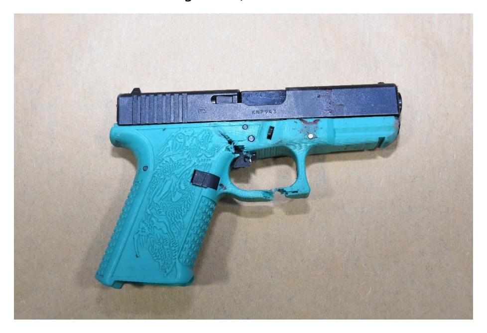
Figure 14, Item 1