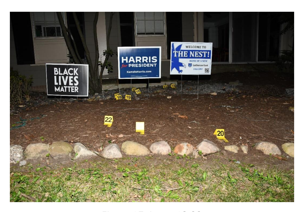
Figure 17, Items 13-22

2024-2614 Officer Involved Critical Incident - 1309 Yellowstone Rd., Cleveland Hts., Ohio 44121