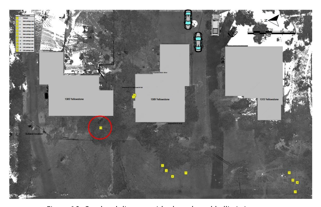
Figure 19, Overhead diagram with placards and ballistic impacts

The exteriors of 1305 - 1321 Yellowstone Rd. were further documented using a Leica RTC360 laser scanner. Using the scan data and additional Leica software, panoramas and three overhead diagrams (with/without placards and with/without ballistic impacts) was created and provided to investigators (Figure 19, Overhead diagram).