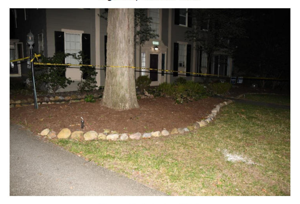
Figure 3, Exterior 1305