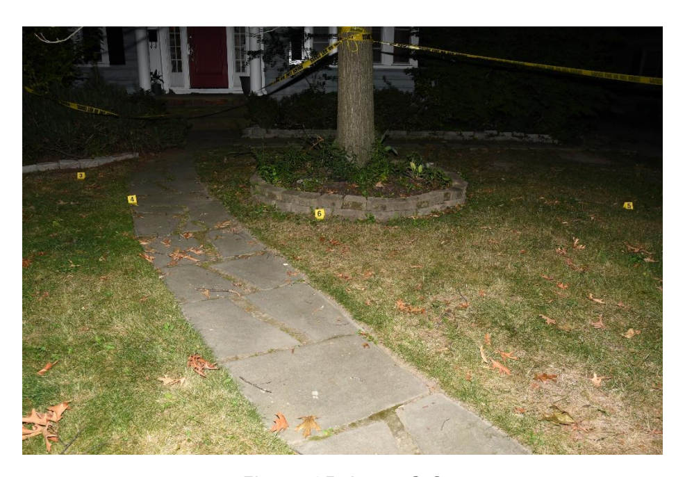
Figure 15, Items 3-6

2024-2614 Officer Involved Critical Incident - 1309 Yellowstone Rd., Cleveland Hts., Ohio 44121