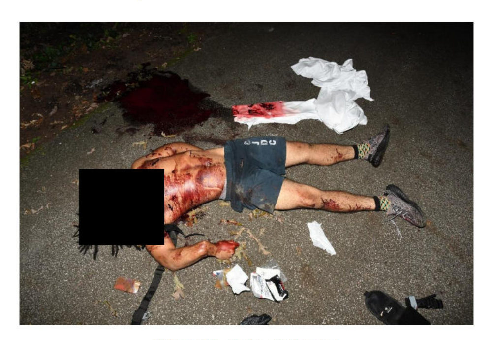
Figure 20, Body of Thomas

2024-2614 Officer Involved Critical Incident - 1309 Yellowstone Rd., Cleveland Hts., Ohio 44121