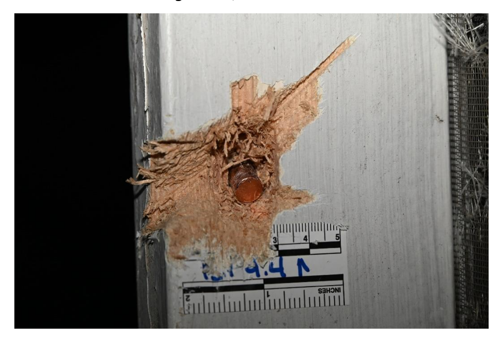
Figure 27, BI 9.4 and Item 36