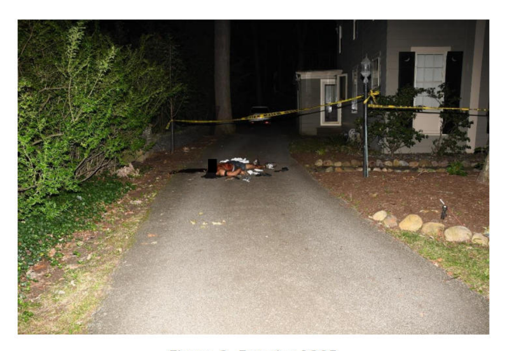
Figure 2, Exterior 1305

2024-2614 Officer Involved Critical Incident - 1309 Yellowstone Rd., Cleveland Hts., Ohio 44121