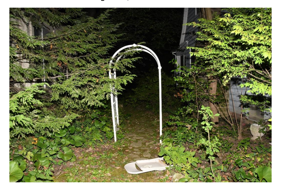
Figure 8, Exterior 1309