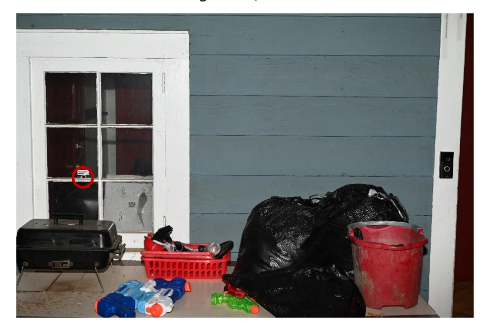
Figure 25, BI 9.1