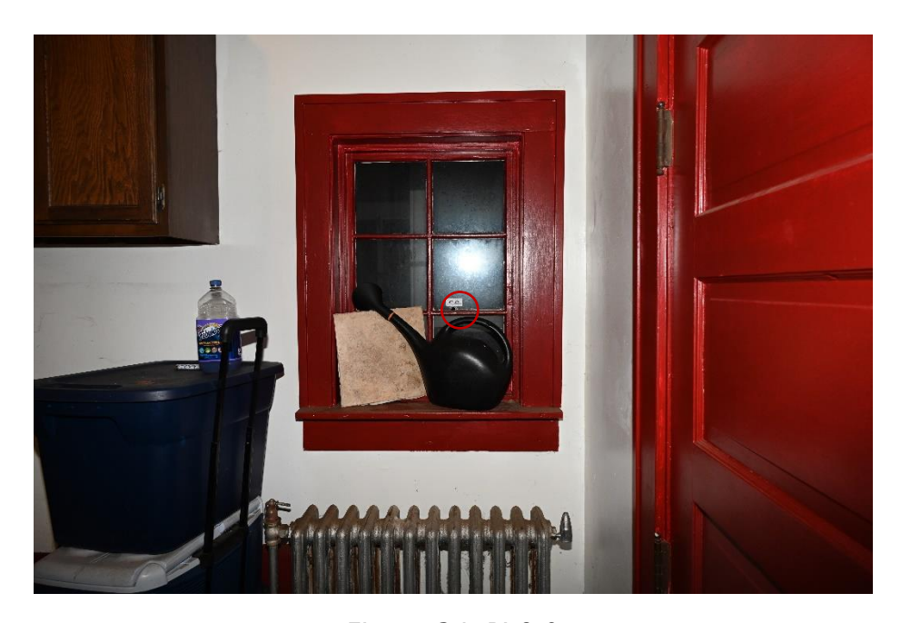
Figure 24, BI 9.0

2024-2614 Officer Involved Critical Incident - 1309 Yellowstone Rd., Cleveland Hts., Ohio 44121