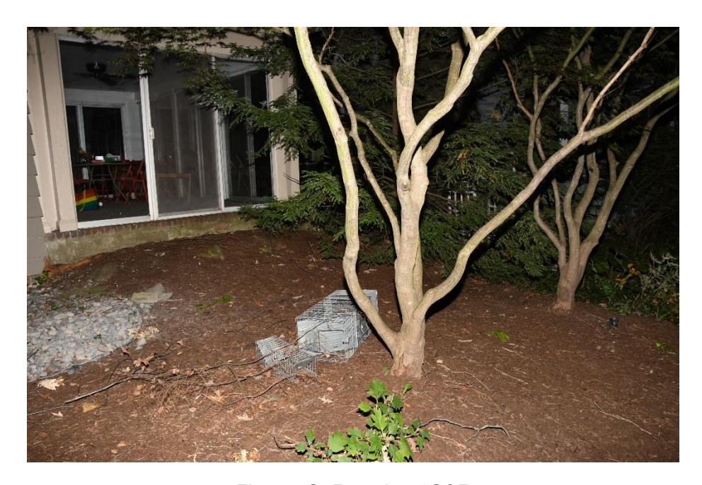
Figure 6, Exterior 1305

2024-2614 Officer Involved Critical Incident - 1309 Yellowstone Rd., Cleveland Hts., Ohio 44121