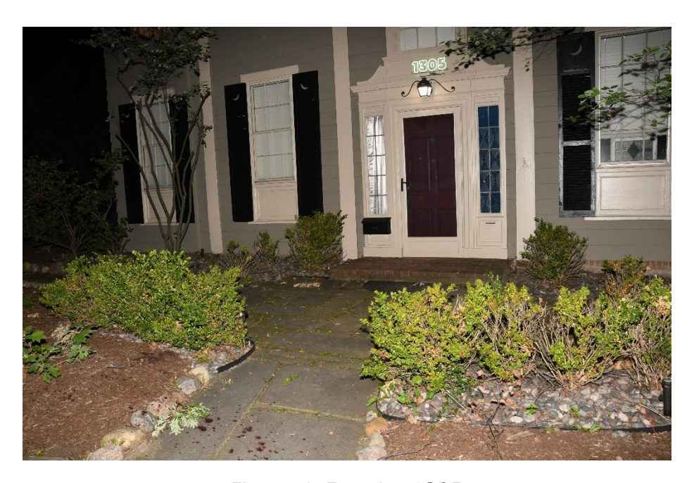
Figure 4, Exterior 1305

2024-2614 Officer Involved Critical Incident - 1309 Yellowstone Rd., Cleveland Hts., Ohio 44121