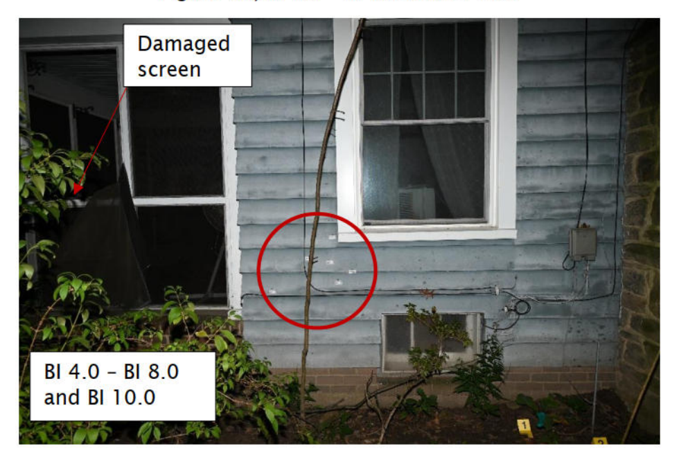
Figure 23, BI 4.0 - BI 8.0 and BI 10.0