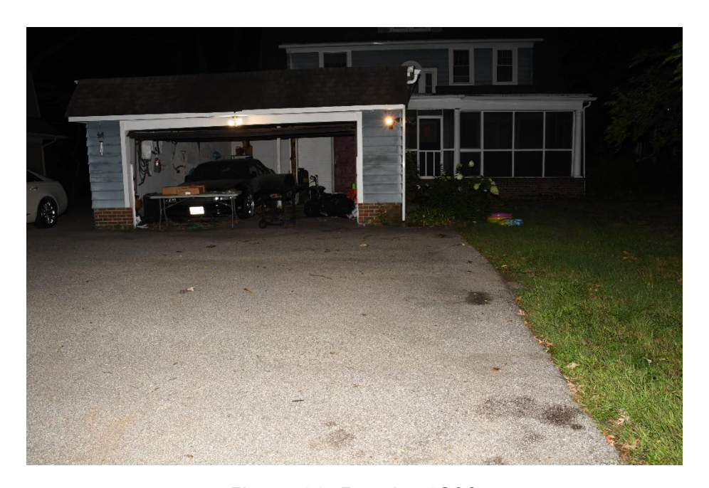
Figure 11, Exterior 1309

2024-2614 Officer Involved Critical Incident - 1309 Yellowstone Rd., Cleveland Hts., Ohio 44121