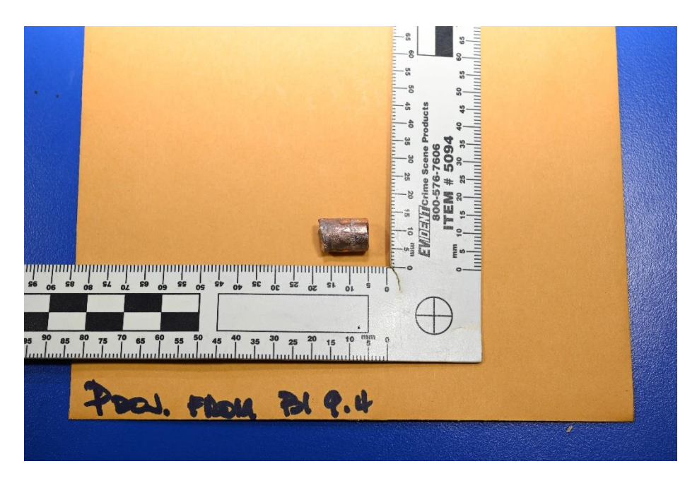
Figure 28, Item 36

2024-2614 Officer Involved Critical Incident - 1309 Yellowstone Rd., Cleveland Hts., Ohio 44121