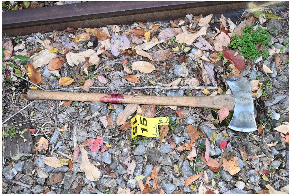
Figure 6, Item 15

Officer Involved Critical Incident - Portage Bike Trail near North Freedom Street, Ravenna, Ohio 44266