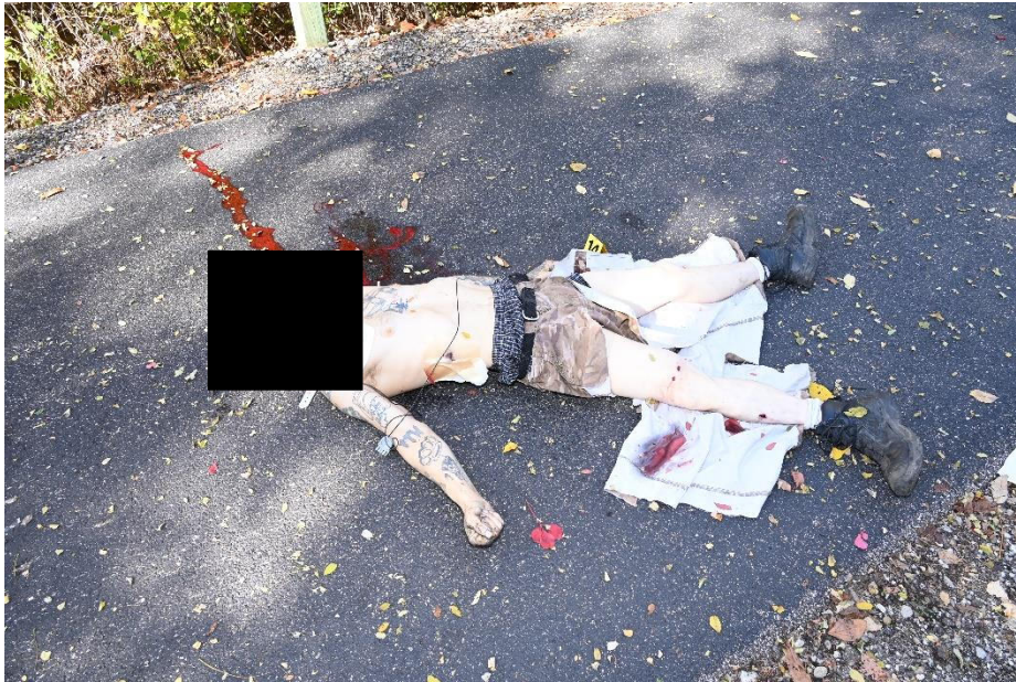
Figure 9, Overall photograph

Officer Involved Critical Incident - Portage Bike Trail near North Freedom Street, Ravenna, Ohio 44266