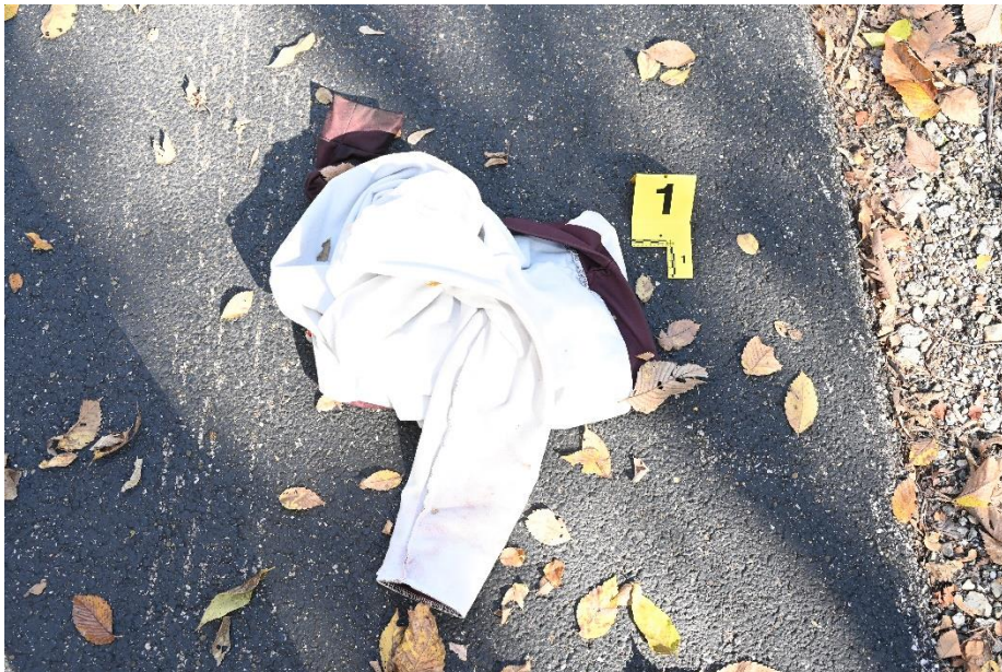
Figure 1, Item 1

This document is the property of the Ohio Bureau of Criminal Investigation and is confidential in nature. Neither the document nor its contents are to be disseminated outside your agency except as provided by law - a statute, an administrative rule, or any rule of procedure.