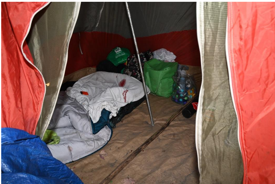
Figure 13, Overall photograph

This document is the property of the Ohio Bureau of Criminal Investigation and is confidential in nature. Neither the document nor its contents are to be disseminated outside your agency except as provided by law - a statute, an administrative rule, or any rule of procedure.