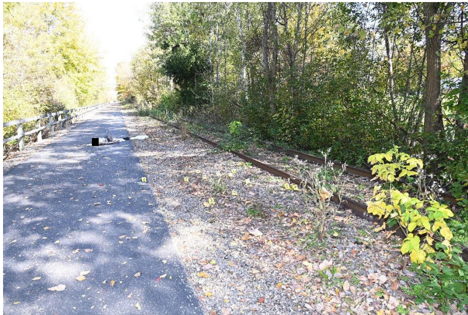
Figure 2, Overall photograph

Officer Involved Critical Incident - Portage Bike Trail near North Freedom Street, Ravenna, Ohio 44266