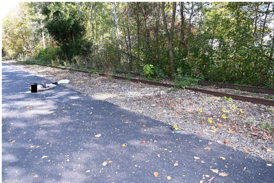
Figure 3, Overall photograph

This document is the property of the Ohio Bureau of Criminal Investigation and is confidential in nature. Neither the document nor its contents are to be disseminated outside your agency except as provided by law - a statute, an administrative rule, or any rule of procedure.