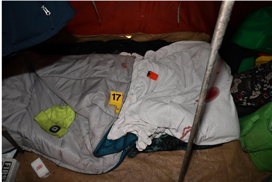
Figure 14, Items 17-18

Officer Involved Critical Incident - Portage Bike Trail near North Freedom Street, Ravenna, Ohio 44266