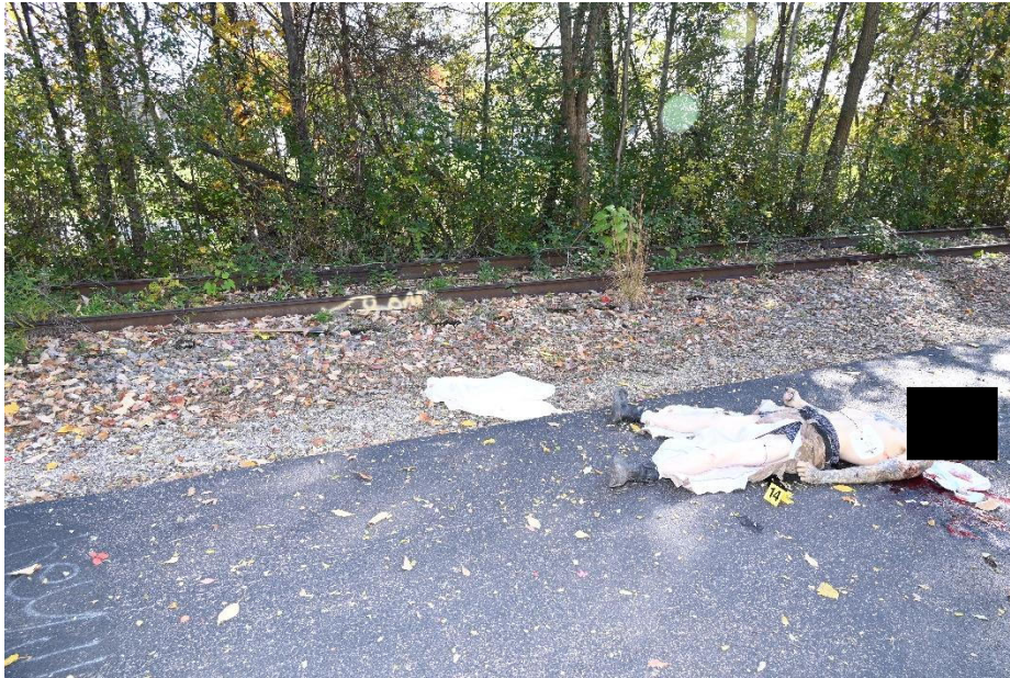
Figure 4, Overall photograph

Officer Involved Critical Incident - Portage Bike Trail near North Freedom Street, Ravenna, Ohio 44266