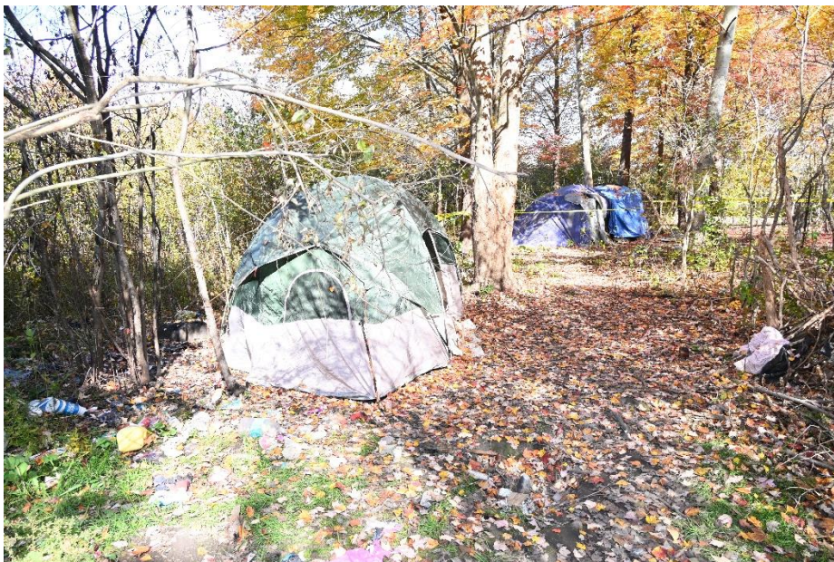
Figure 11, Overall photograph

The scene of the reported stabbing was photographed as it was found (Figures 11-14, Overall photographs). The scene was processed with the authority of a search warrant. The scene was located approximately 1600ft from the intersection of the Portage County Bike Trail and North Freedom St. and approximately 1000ft. from the area of the reported shooting. The scene was examined for items of suspected evidence and two items of suspected evidence were located, documented and collected (Item 17, white blanket with suspected bloodstains, Item 18, sleeping bag with suspected bloodstains).