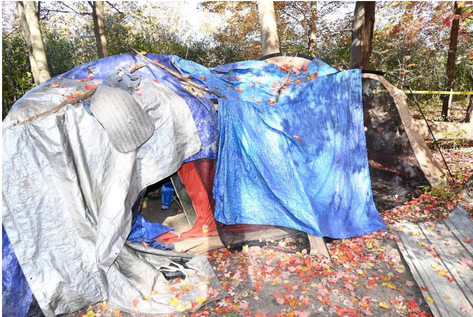
Figure 12, Overall photograph

Officer Involved Critical Incident - Portage Bike Trail near North Freedom Street, Ravenna, Ohio 44266