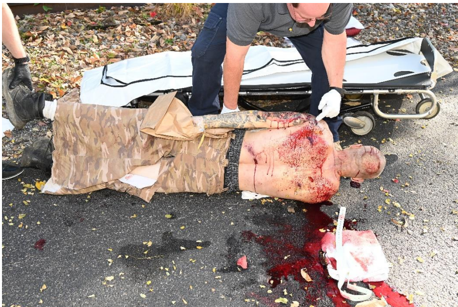
Figure 10, Overall photograph

This document is the property of the Ohio Bureau of Criminal Investigation and is confidential in nature. Neither the document nor its contents are to be disseminated outside your agency except as provided by law - a statute, an administrative rule, or any rule of procedure.