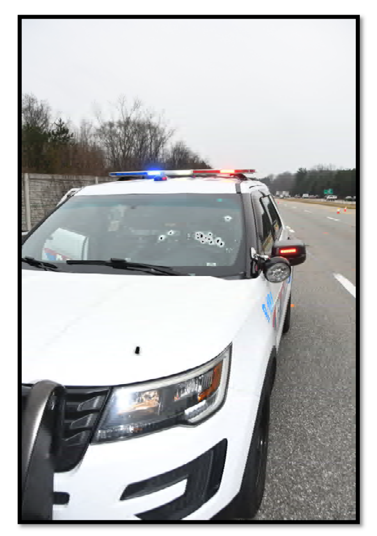
(BE 1.0 located on the hood of the vehicle)

Officer Involved Critical Incident - Interstate 71 North near Mile Marker 123, Lewis Center, Ohio