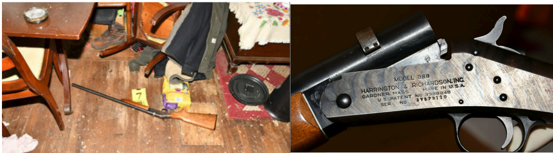
Recovered shotgun located on kitchen floor