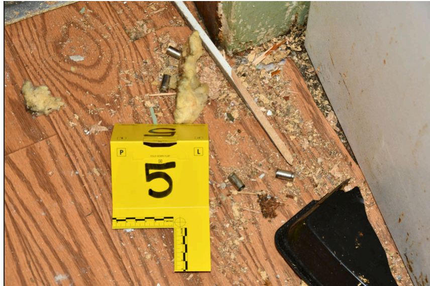
CS Item 5, Lab Item 5-(4) recovered 9mm Luger cartridge cases-Located on kitchen floor at doorway.