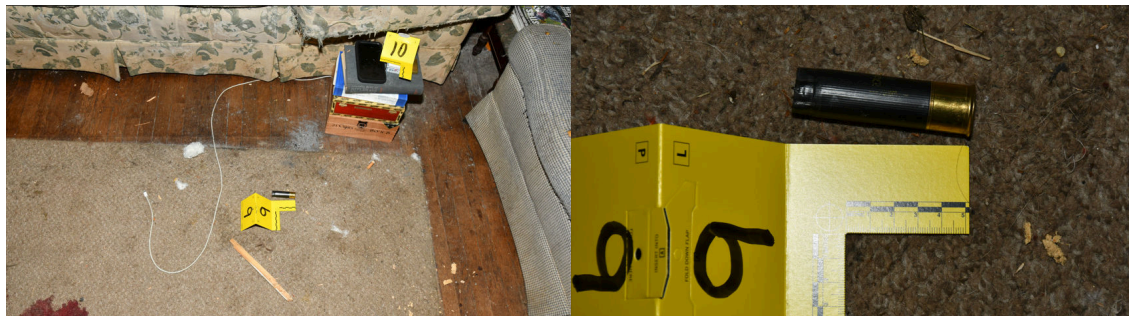
Recovered shotshell (fired) located on living room floor

This document is the property of the Ohio Bureau of Criminal Investigation and is confidential in nature. Neither the document nor its contents are to be disseminated outside your agency except as provided by law - a statute, an administrative rule, or any rule of procedure.