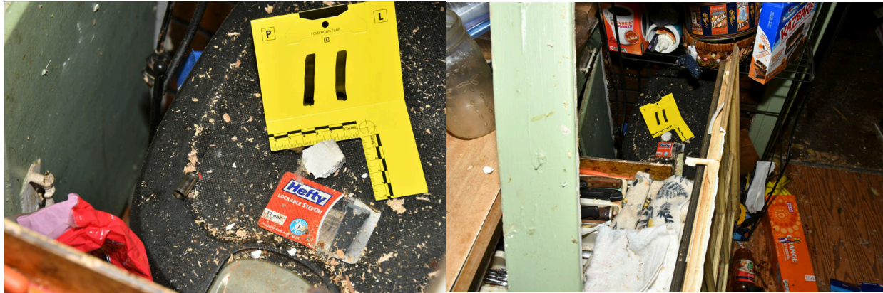
CS Item 11, Lab Item 9-(1) recovered 9mm Luger cartridge cases-Located on wastebasket in kitchen.

[REDACTED] Howland Township, OH 44484 Trumbull County