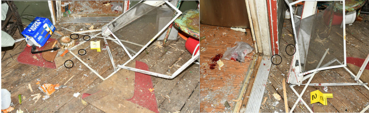
CS Item 2, Lab Item 2-(6) recovered Hornady 5.56 cartridge cases located on back porch.

[REDACTED] Howland Township, OH 44484 Trumbull County