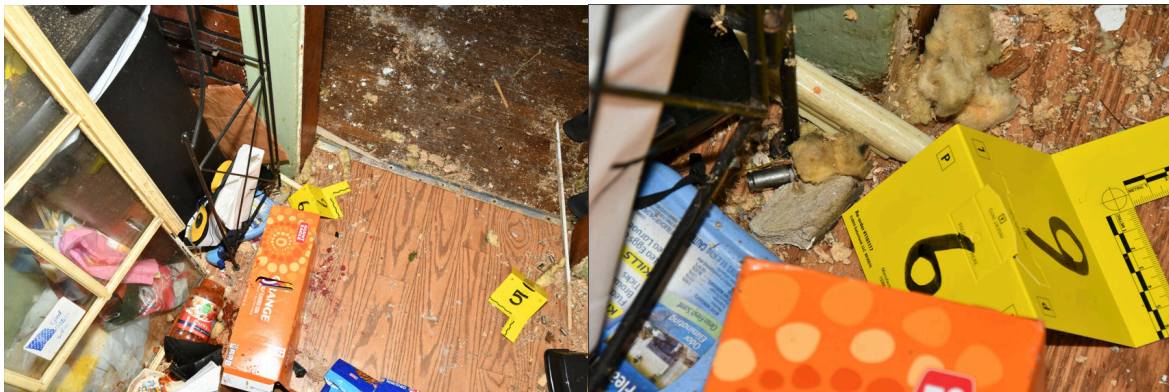
CS Item 6, Lab Item 6-(1) recovered 9mm Luger cartridge cases-Located on kitchen floor at doorway

This document is the property of the Ohio Bureau of Criminal Investigation and is confidential in nature. Neither the document nor its contents are to be disseminated outside your agency except as provided by law - a statute, an administrative rule, or any rule of procedure.