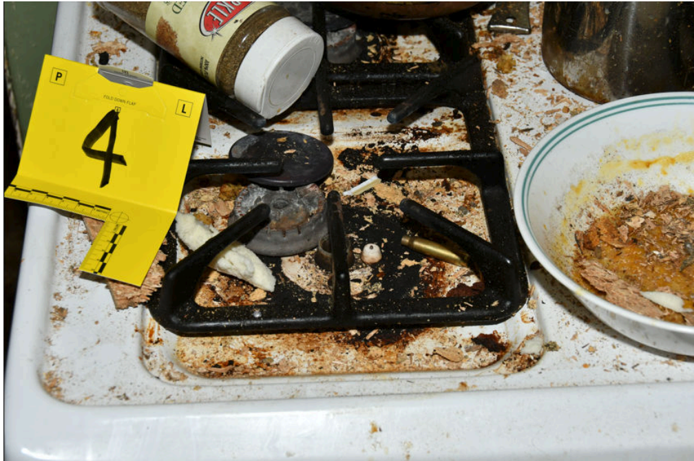
CS Item 4, Lab Item 4-(1) recovered Hornady 5.56 cartridge cases found on stove.

[REDACTED] Howland Township, OH 44484 Trumbull County