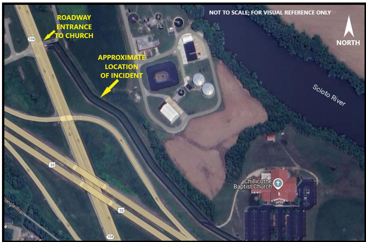
Figure 1: General map of area

Dep. Nott stated that while he was enroute, another deputy [REDACTED] advised that he was on scene, and he had the suspect at gunpoint. The deputy then advised that shots were fired. Deputy Nott estimated that he was around the interchange of State Routes 207 and 104 (approximately 3 miles north of scene) when the shots fired was broadcast. Dep. Nott said he blocked the entrance to the church on 104 with his vehicle when he arrived at the scene, then he ran up the driveway to assist.