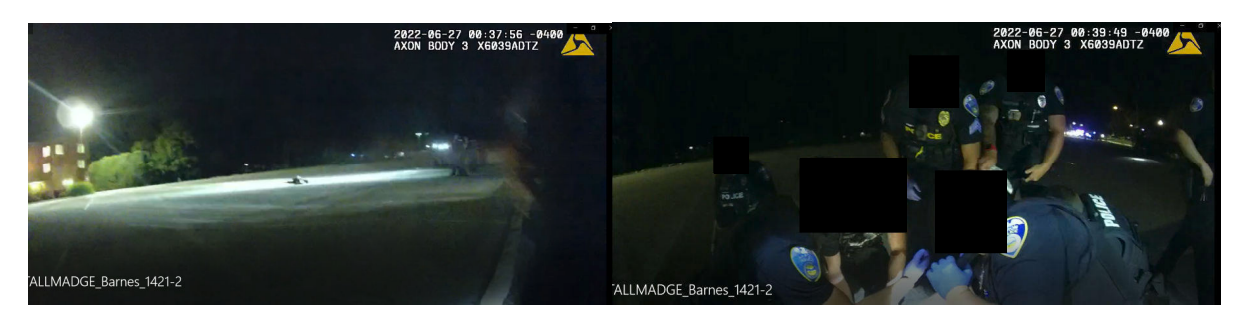
Figure 1 Figure 2

The above images are from Officer Barnes' body-worn camera footage. Based upon Officer Barnes' body-worn camera footage, Officer Barnes is seen running toward the sidewalk after shots have been fired (Figure 1). Officer Barnes is then observed assisting officers with first aid and holding his flashlight (Figure 2).