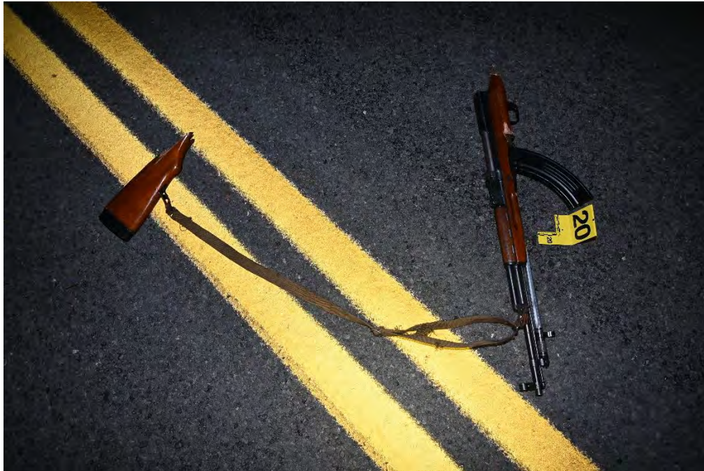
Figure 6: Evidence Item #20

The rifle Septer reportedly stepped out of the vehicle with was laying in the roadway. The rifle was an unknown make with serial number #1736836. The rifle was collected and labeled Evidence Item #20 .