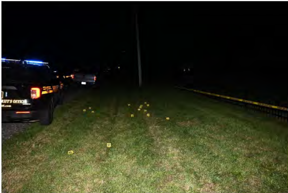
Figure 5: Evidence Items #4-19

Evidence Items #4-19 were located to the west of the roadway. While placing placards, placard 15 was not placed. Due to the missing placard, there is no evidence item #15.