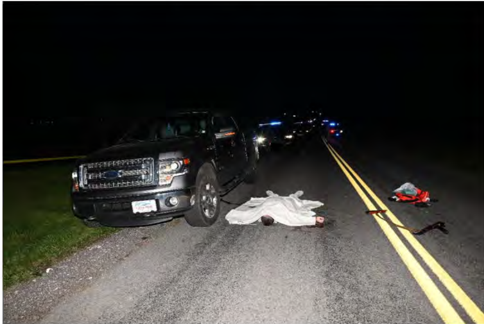
Figure 1: Overall (North)

Officer Involved Critical Incident - 10300 block Silvercreek Road, Doylestown, Ohio 44230, Medina County