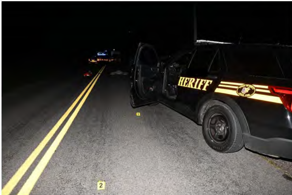
Figure 2: Overall (South)

This document is the property of the Ohio Bureau of Criminal Investigation and is confidential in nature. Neither the document nor its contents are to be disseminated outside your agency except as provided by law - a statute, an administrative rule, or any rule of procedure.