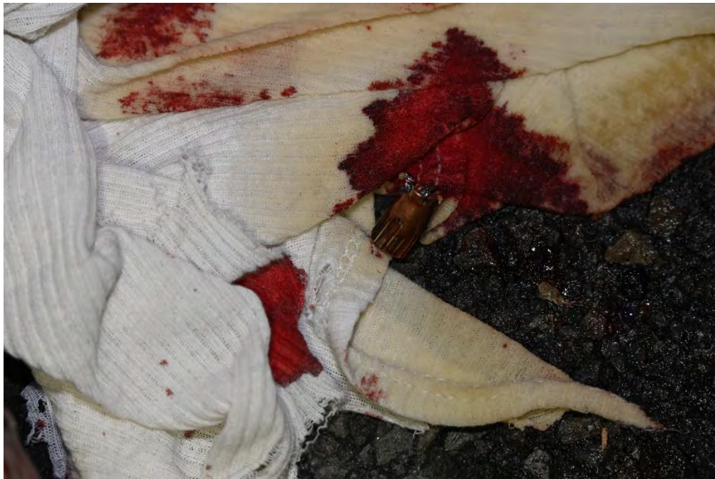
Figure 7: Evidence Item #21