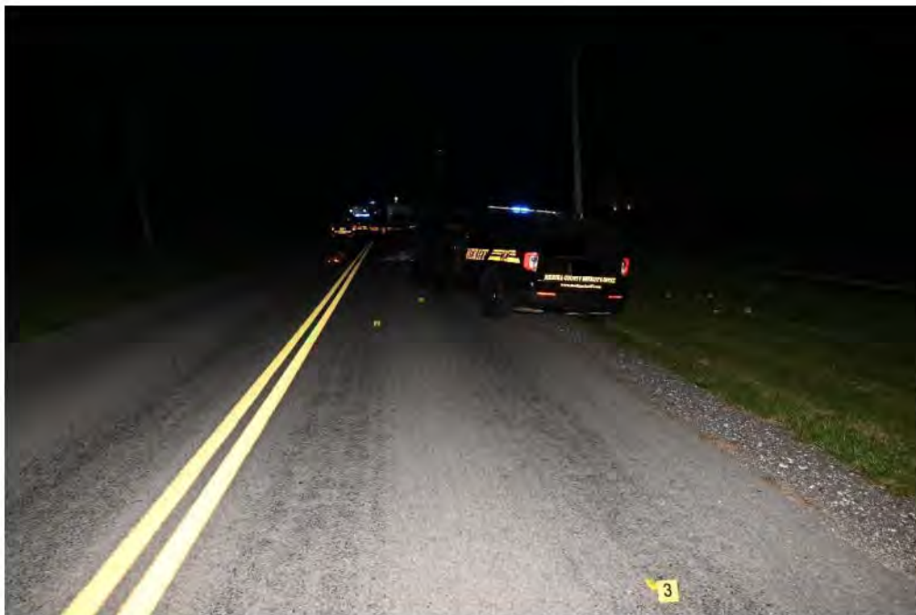
Figure 4: Evidence Items #1-3

A total of 18 Fired WIN 9 mm Luger cartridge casing were located, collected and labeled Evidence Items #1-19 . Evidence Items #1-3 were located in the southbound lane of Silvercreek Road.