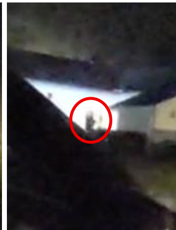
Sgt. Shaw BWC Video Still Shot – 21:04:36 hours & zoomed photo