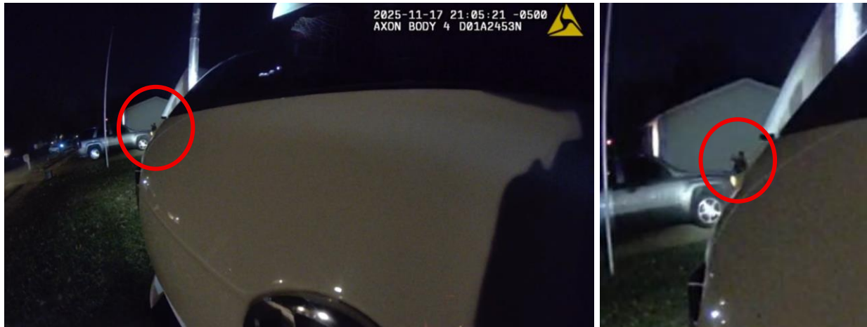
██████████ BWC Video Still Shot – 21:05:21 hours & zoomed photo

Officer Involved Critical Incident - 4272 Cider Mill Drive, Cincinnati, OH 45245 (L)