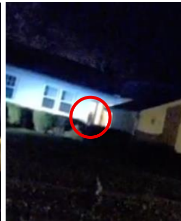
[REDACTED] BWC Video Still Shot – 21:04:28 hours & zoomed photo