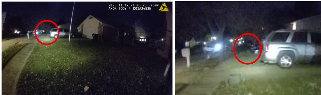
██████████ BWC Video Still Shot – 21:05:25 hours & zoomed photo