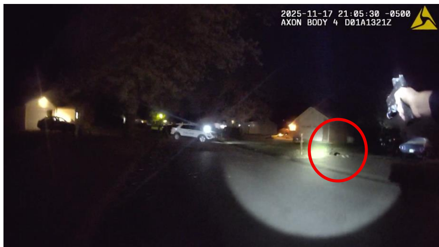
██████████ BWC Video Still Shot – 21:05:30 hours