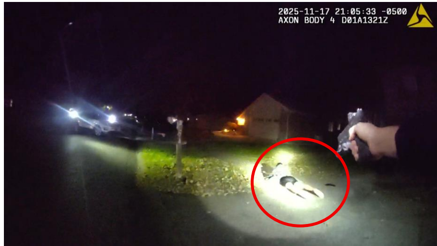
[REDACTED] BWC Video Still Shot – 21:05:33 hours

Officer Involved Critical Incident - 4272 Cider Mill Drive, Cincinnati, OH 45245 (L)