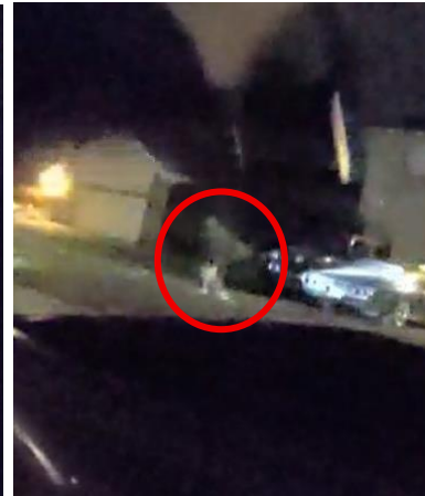
██████████ BWC Video Still Shot – 21:05:26 hours & zoomed photo