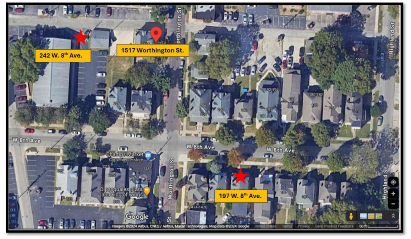
(Google maps showing scene expansion)