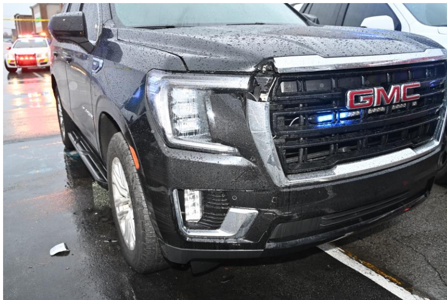
Fig. 4: Damage to the front of the unmarked LTPD Chevrolet Suburban.

There was visible damage to the front of the unmarked LTPD Chevrolet Suburban which was reportedly parked behind the subject vehicle. There was vehicle debris located under the Suburban, which was later collected and sealed into a paper bag as evidence item 7. There was also visible damage to the front of marked LTPD cruiser 9, which was reportedly parked in front of the subject vehicle. Vehicle debris was observed on the ground in front of cruiser 9.