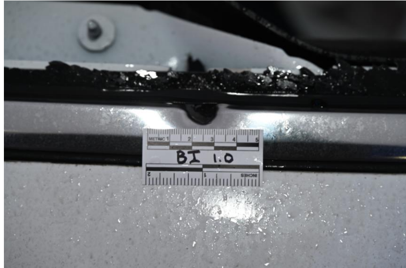
Fig. 10: A closer view of BI 1.0 with scale.

Several reddish stains and additional ballistic impacts were observed in the passenger cabin of the vehicle. The subject vehicle was towed from the scene to LTPD for further investigation. An evidence receipt was completed and signed by S/A Doran and SIU S/A Matt Armstrong. S/A Armstrong took custody of all evidence for transport to BCI Richfield for storage.