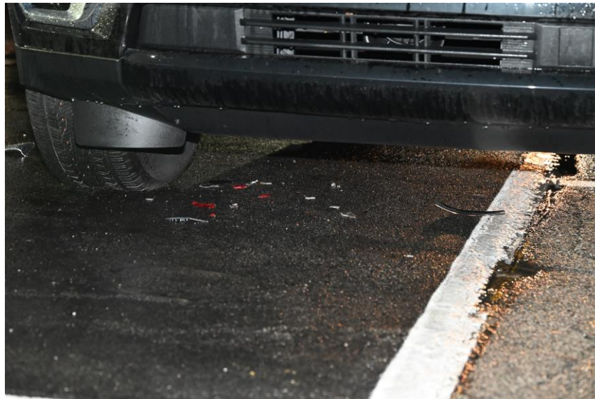
Fig. 5: Vehicle debris located under the LTPD Chevrolet Suburban (evidence item 7).

Officer Involved Critical Incident - 3487 Belmont Avenue, Youngstown, Ohio, 44505