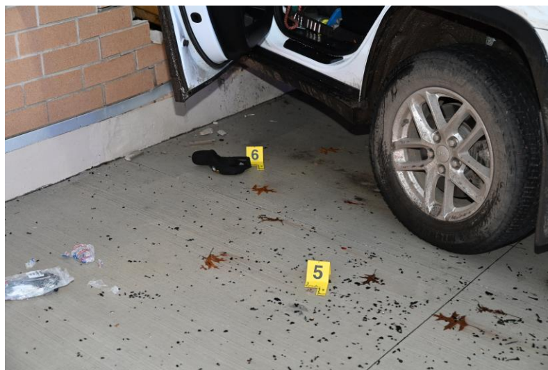
Fig. 8: A fired projectile jacket and black ballcap located near the rear left tire of the subject vehicle. View is facing Southeast.

The subject vehicle was photographed as it was found. A fired projectile jacket (item 5) and a black ballcap (item 6) were found on the ground on the left side of the vehicle. A ballistic impact was observed on the rear windshield trim (BI 1.0), and the rear windshield glass had fallen from the frame. S/A Hootman placed a trajectory rod in BI 1.0, and additional BLK360 scans were completed.