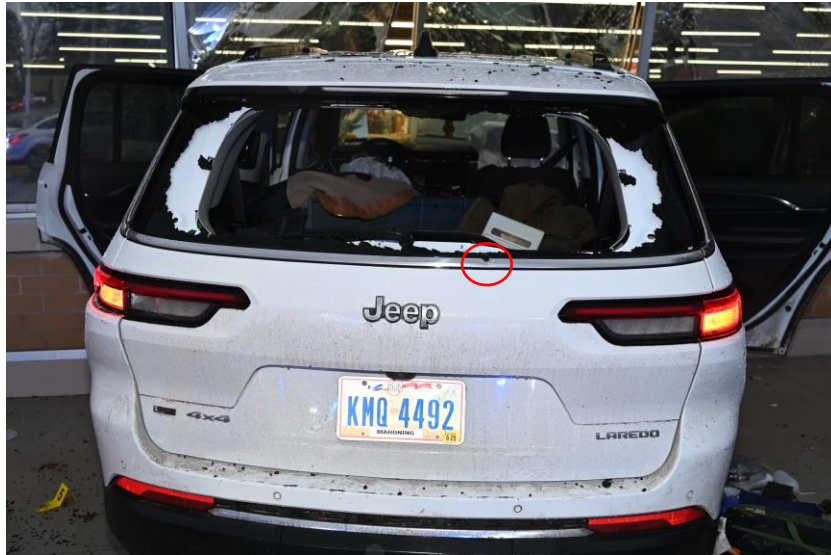
Fig. 9: View of the subject vehicle, facing East. BI 1.0 is circled in red.

Officer Involved Critical Incident - 3487 Belmont Avenue, Youngstown, Ohio, 44505