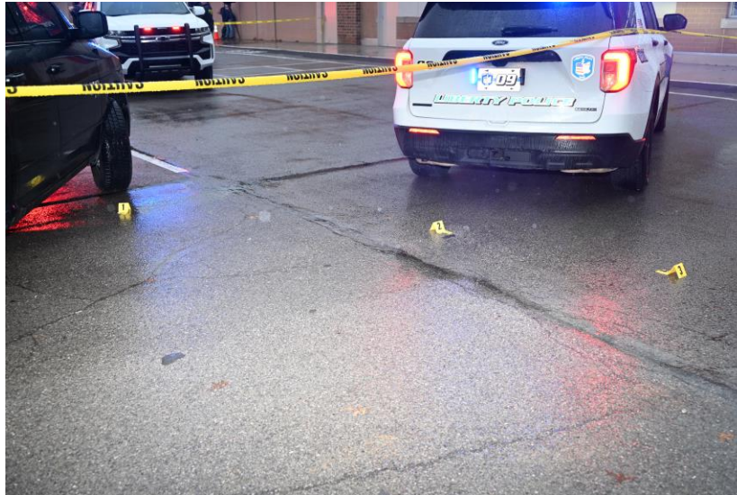
Fig 2: Three fired cartridge casings located on the South side of scene. Camera view is facing Northeast.

Officer Involved Critical Incident - 3487 Belmont Avenue, Youngstown, Ohio, 44505