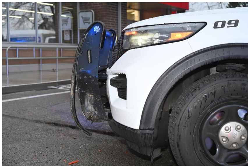
Fig. 6: Damage to the front of the marked LTPD cruiser 9.

This document is the property of the Ohio Bureau of Criminal Investigation and is confidential in nature. Neither the document nor its contents are to be disseminated outside your agency except as provided by law - a statute, an administrative rule, or any rule of procedure.