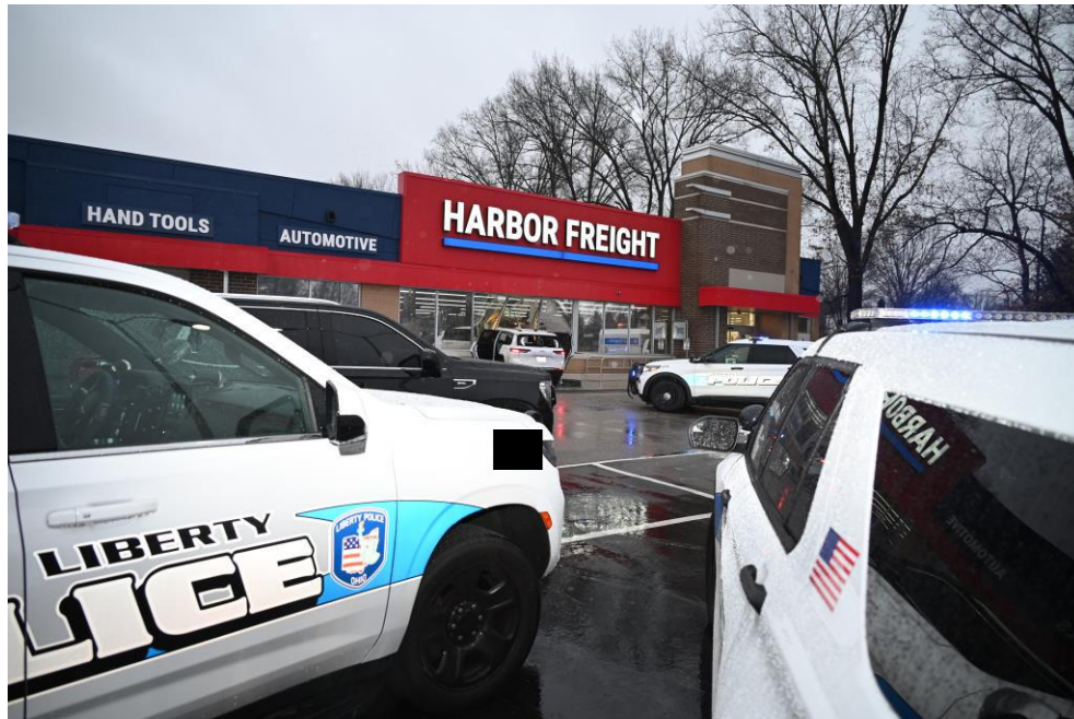
Fig. 1: A view of the store front, subject vehicle, and involved LTPD vehicles. View is facing Southeast.

Officer Involved Critical Incident - 3487 Belmont Avenue, Youngstown, Ohio, 44505