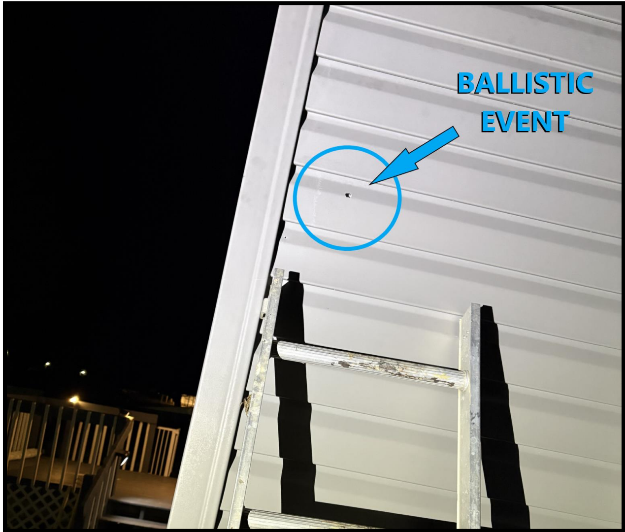
Figure 9: Suspected bullet impact, northeast corner of structure

2026-0240 Officer Involved Critical Incident - 4800 Duvall Rd., Lot 303, Ashville, OH 43103