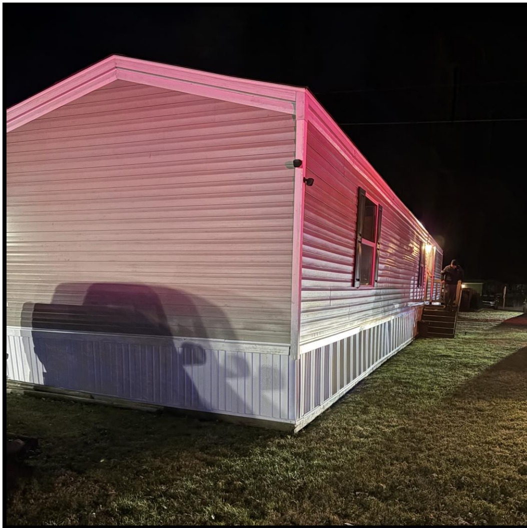
Figure 8: Location of cameras on exterior of Lot 263, northwest corner

Blink® security cameras were observed mounted on the northwest corner and elsewhere on the exterior of the structure on Lot 263. The resident, Michael Chapin, advised that his cameras did not record, because his subscription service expired and the batteries were dead.