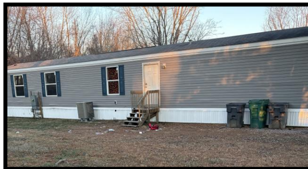
Figure 1: Front, west-facing door of Lot 303

On the evening of Tuesday, January 20, 2026, Ohio Bureau of Criminal Investigation (BCI) Special Agents James Gore and Mathew Austin (SA Gore and SA Austin) conducted a neighborhood canvass in the immediate vicinity of 4800 Duvall Road, Lot 303, which was the site of an officer-involved shooting that occurred earlier the same date. The purpose of the canvass was to locate and identify potential witnesses to the events. SA Gore and SA Austin were able to contact residents at Lots 292, 263, and 304. Contact was also later made at Lot 128 B, after it was reported that the residence had been struck by a projectile from the incident.