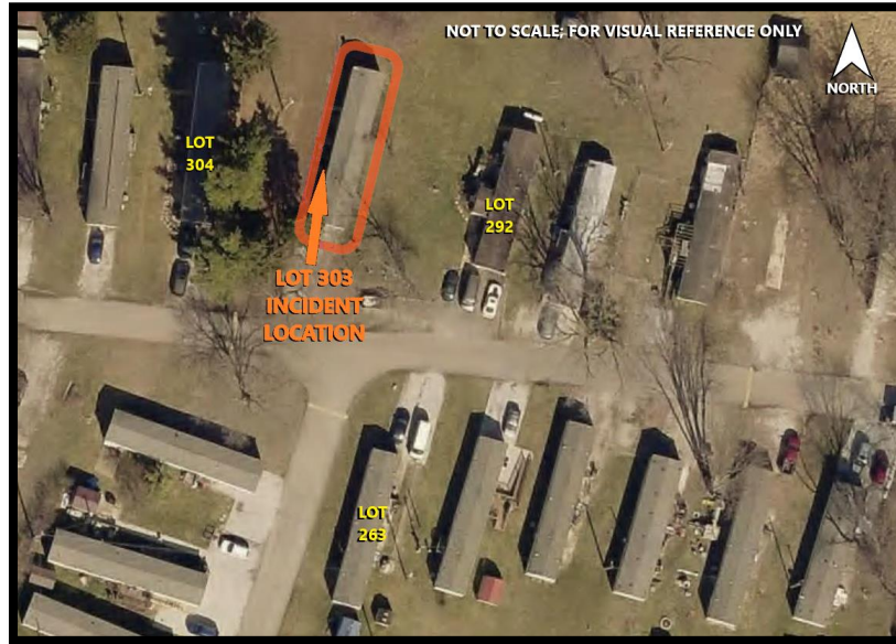
Figure 2: Reference map of immediate vicinity

2026-0240 Officer Involved Critical Incident - 4800 Duvall Rd., Lot 303, Ashville, OH 43103