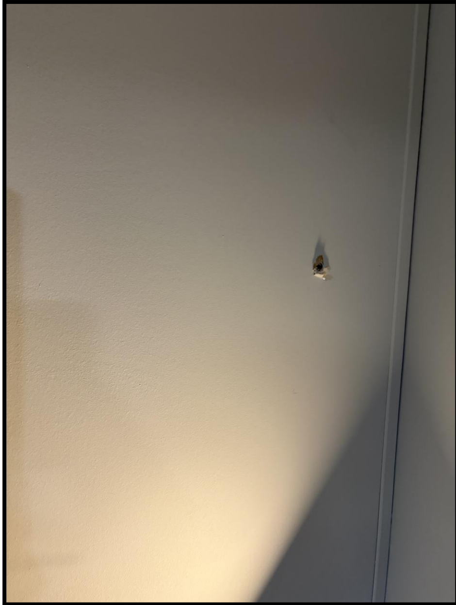
Figure 10: Entry point on north wall of bedroom

2026-0240 Officer Involved Critical Incident - 4800 Duvall Rd., Lot 303, Ashville, OH 43103