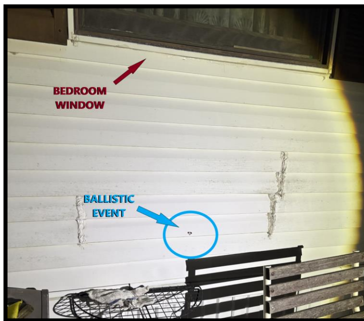
Figure 7: Suspected bullet impact to west wall of structure

SA Gore and SA Austin then examined the suspected entry point of the projectile, which was on the west-facing wall of the structure.