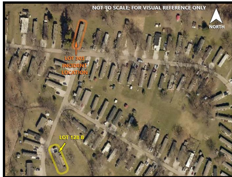
Figure 3: Reference map depicting location of Lot 128 B

This document is the property of the Ohio Bureau of Criminal Investigation and is confidential in nature. Neither the document nor its contents are to be disseminated outside your agency except as provided by law - a statute, an administrative rule, or any rule of procedure.