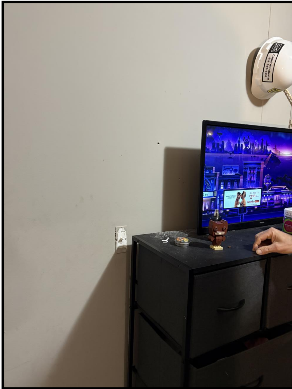
Figure 11: Impact on south wall of bedroom

2026-0240 Officer Involved Critical Incident - 4800 Duvall Rd., Lot 303, Ashville, OH 43103