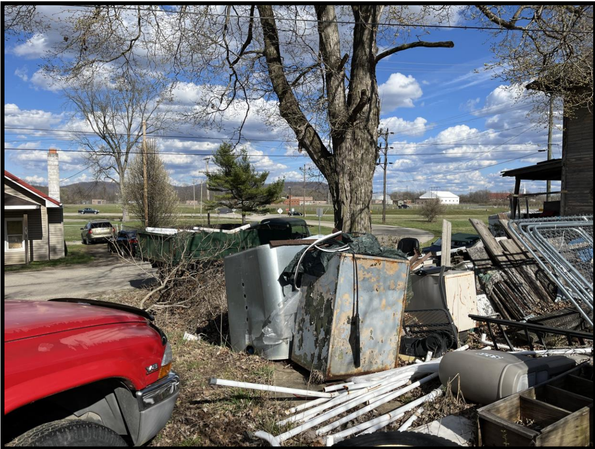
(Woods POV from 15306 Pleasant Valley Rd.)

SA Chung met with Woods at 15329 Pleasant Valley Road at approximately 1645 hours on the above-mentioned activity date. Woods showed SA Chung where she was standing when she on the phone with RCSI dispatch and also witnessed the shooting. SA Chung took photographs and documented the GPS coordinates. Woods advised SA Chung that the property owner of 15306 Pleasant Valley Road has since removed and added some items from the property. The property is best described as a personal scrap yard that contained some non-operating vehicles, a skid-steer and other miscellaneous items. The follow up contact concluded at 1700 hours.