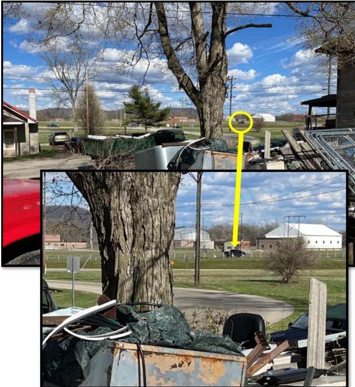
(Woods POV with black truck frame of reference shown)

Officer Involved Critical Incident -14000 OH-104 Chillicothe, OH 45601 (L)