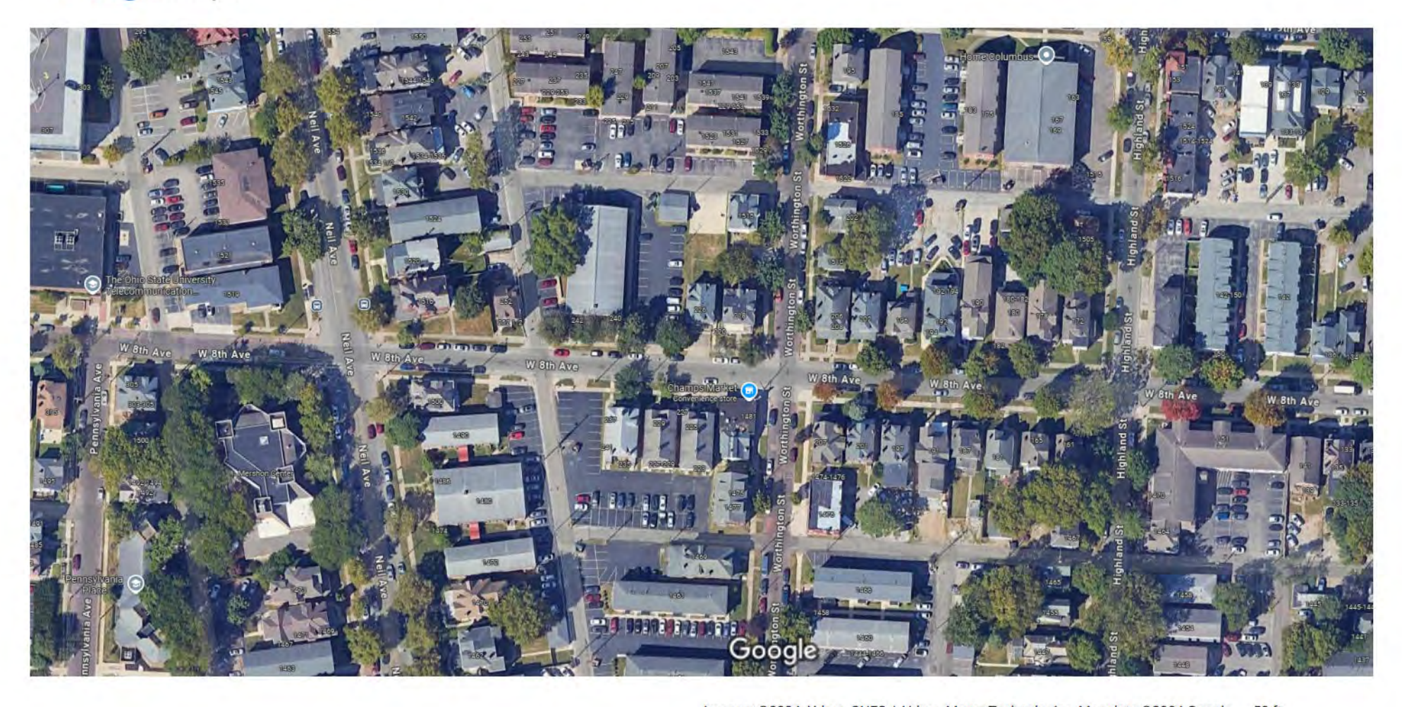
Imagery @2024 Airbus, CNES / Airbus, Maxar Technologies, Map data @2024 Google 50 ft