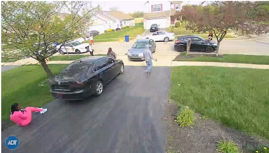
Figure 7: Post Shooting incident