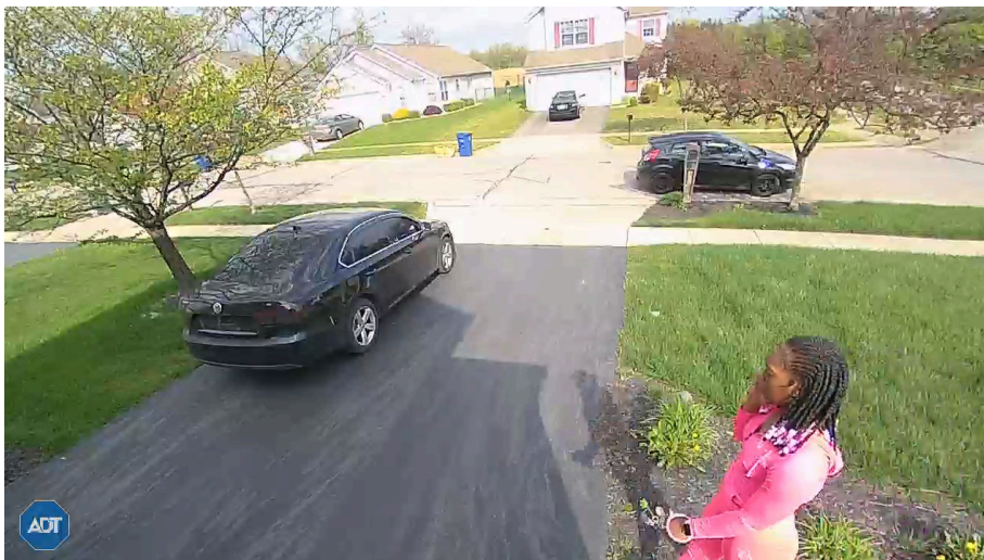
Figure 6: Tionna entering driveway while on her phone