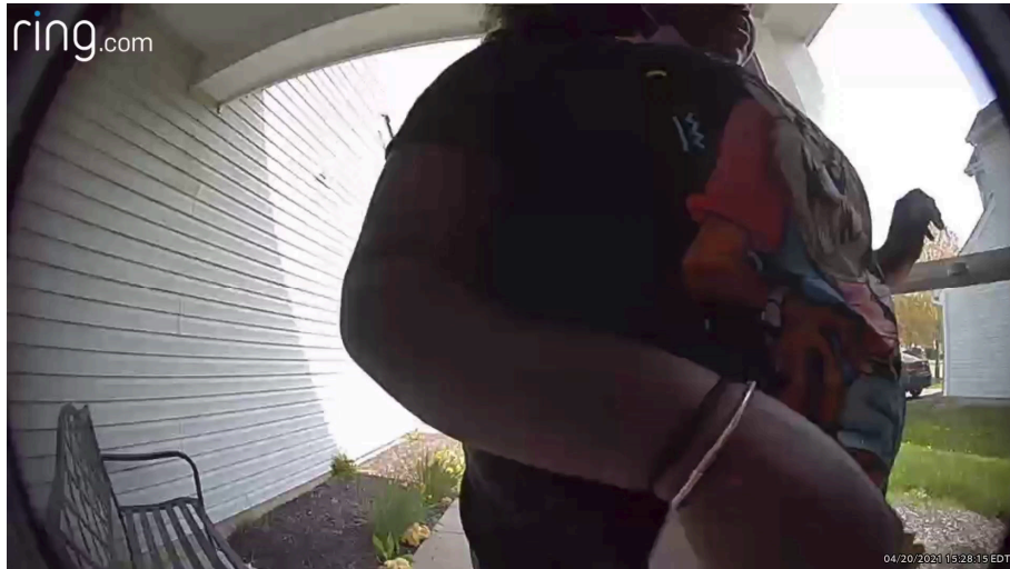
Figure 9: Ma'khia and Ja'niah returning home