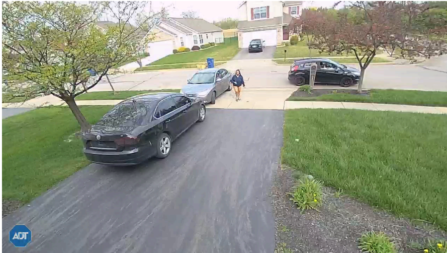
Figure 5: Shai-Onta arriving to the house. Jeanene's vehicle too is parked in front.