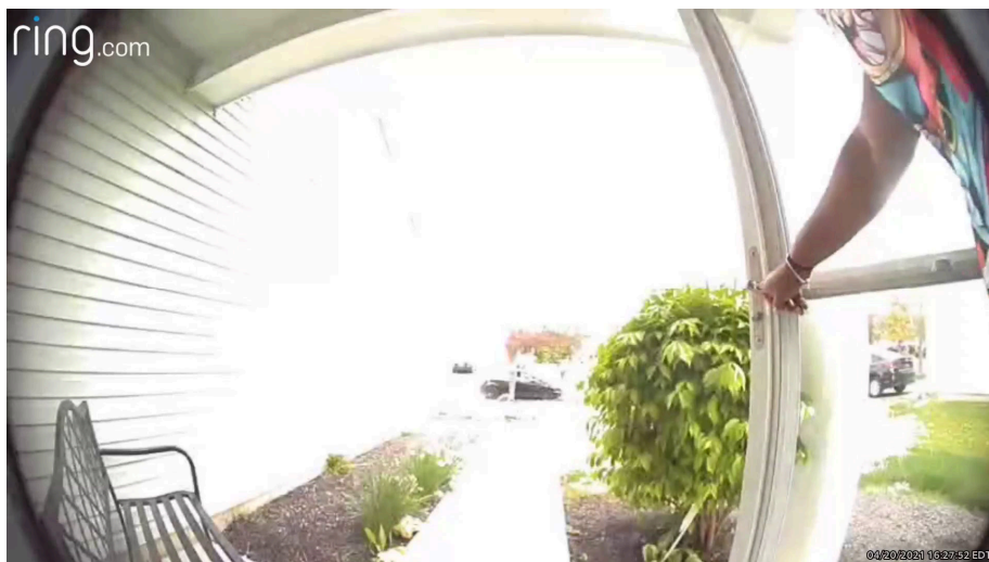
Figure 10: Ma'Khia at front door talking with Jeanene and unknown female

This document is the property of the Ohio Bureau of Criminal Investigation and is confidential in nature. Neither the document nor its contents are to be disseminated outside your agency.