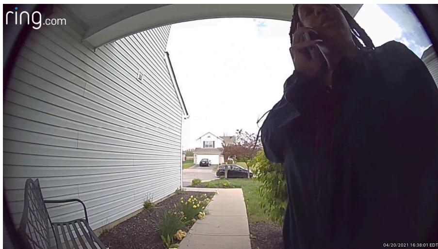
Figure 12: Shai-Onta at front door

This document is the property of the Ohio Bureau of Criminal Investigation and is confidential in nature. Neither the document nor its contents are to be disseminated outside your agency.