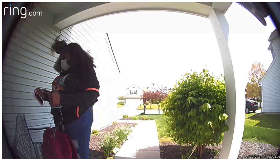
Figure 8: Ma'Khia returning home