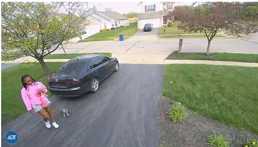
Figure 4: Tionna Bonner returning to 3171 Legion