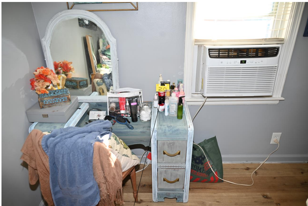
(Camera found on make-up table)

All items were individually packaged and sealed by S/A Hootman. After collecting the items listed above it was learned that the neighbor provided a camera to the female victim to record what was going on inside the home due to the volatile situation that was transpiring throughout the day. The camera was supposedly placed discreetly in the master bedroom. This was located on a makeup table under other items. The camera had a micro-SD card inserted, the SD card was removed by S/A Hootman and listed as item #20 on the evidence inventory sheet, the camera was left in the home.