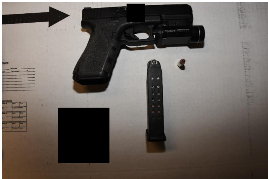
Figure 11, Item 2

This document is the property of the Ohio Bureau of Criminal Investigation and is confidential in nature. Neither the document nor its contents are to be disseminated outside your agency except as provided by law - a statute, an administrative rule, or any rule of procedure.