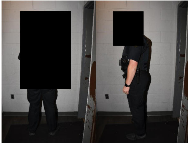
Figures 7-10, [REDACTED]

Officer Involved Critical Incident - 1309 Yellowstone Rd., Cleveland Hts., Ohio 44121