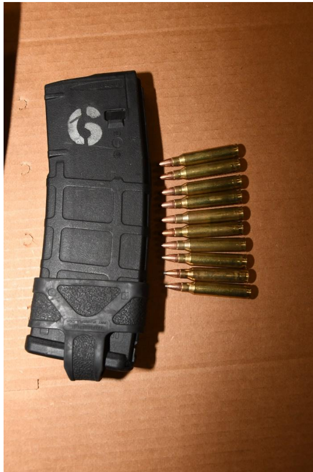
Figures 5-6, Item 1

Officer Involved Critical Incident - 1309 Yellowstone Rd., Cleveland Hts., Ohio 44121