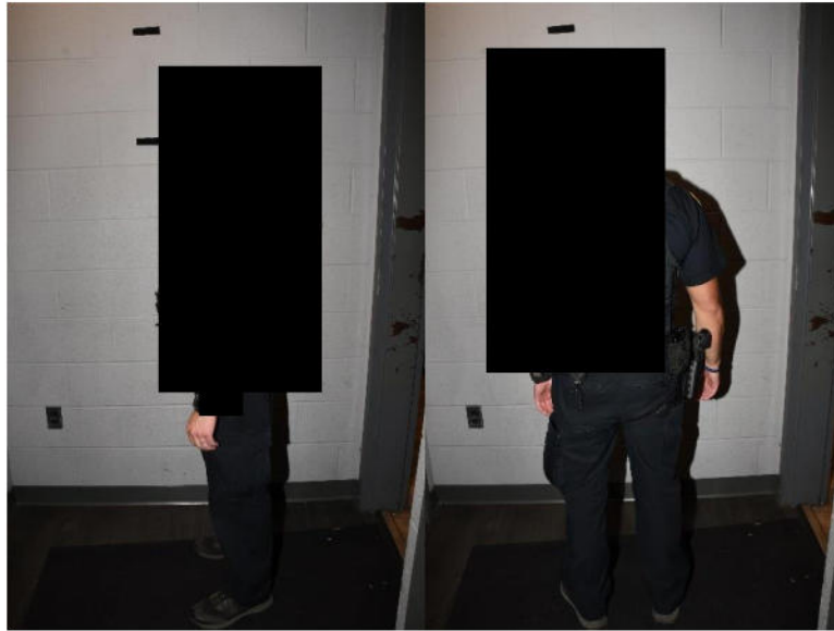
Figures 12-15, [REDACTED]

Officer Involved Critical Incident - 1309 Yellowstone Rd., Cleveland Hts., Ohio 44121