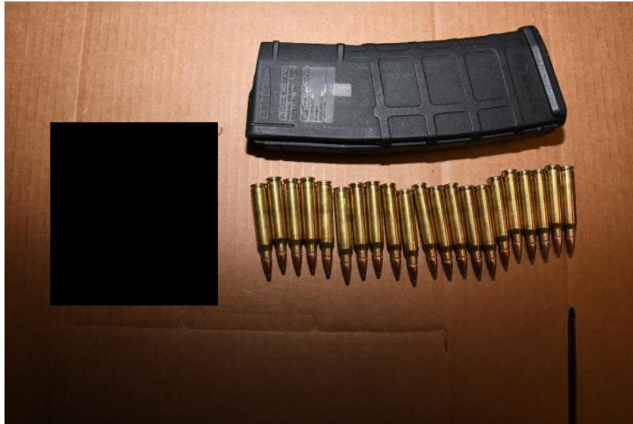
Figures 16-17, Item 3

Officer Involved Critical Incident - 1309 Yellowstone Rd., Cleveland Hts., Ohio 44121