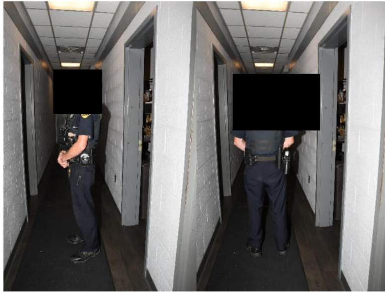
Figures 1-4 [REDACTED]

Officer Involved Critical Incident - 1309 Yellowstone Rd., Cleveland Hts., Ohio 44121