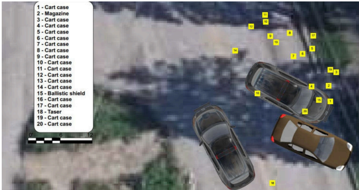
The above crime scene photo captures the overhead diagram taken by a FARO focus S-70 Sc.