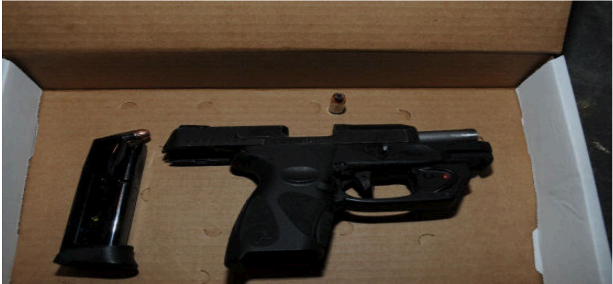
The above crime scene photo captures a Taurus 9mm handgun which was located on the driver-side floorboard area of the tan Chevrolet Malibu.

Officer-Involved Critical Incident – 2022-0727 914 Salt Springs Road, Youngstown, Ohio 44509